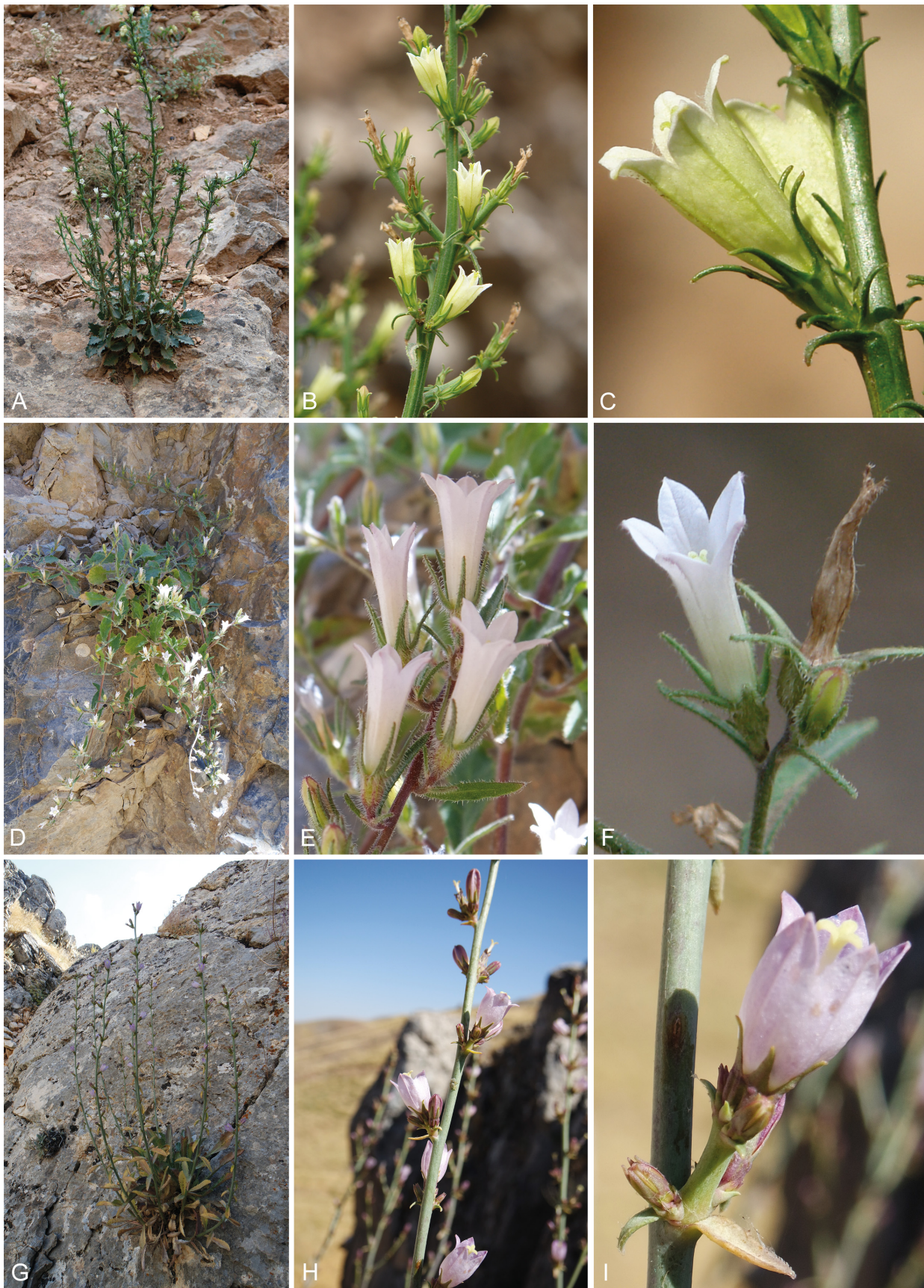
Fig. 3. A–C: Campanula dersimensis ; A: habit; B: inflorescence; C: flower; Turkey, Tunceli, 2012. – D–F: C. quercetorum ; D: habit; E: inflorescence; F: flower; Turkey, Tunceli, 2015. – G–I: C. yildirimlii ; G: habit; H: inflorescence; I: flower; Turkey, Erzincan, 2014. – Photographs: A–C, F by Mehmet Fırat; D, E, G–I by Hasan Yıldırım.