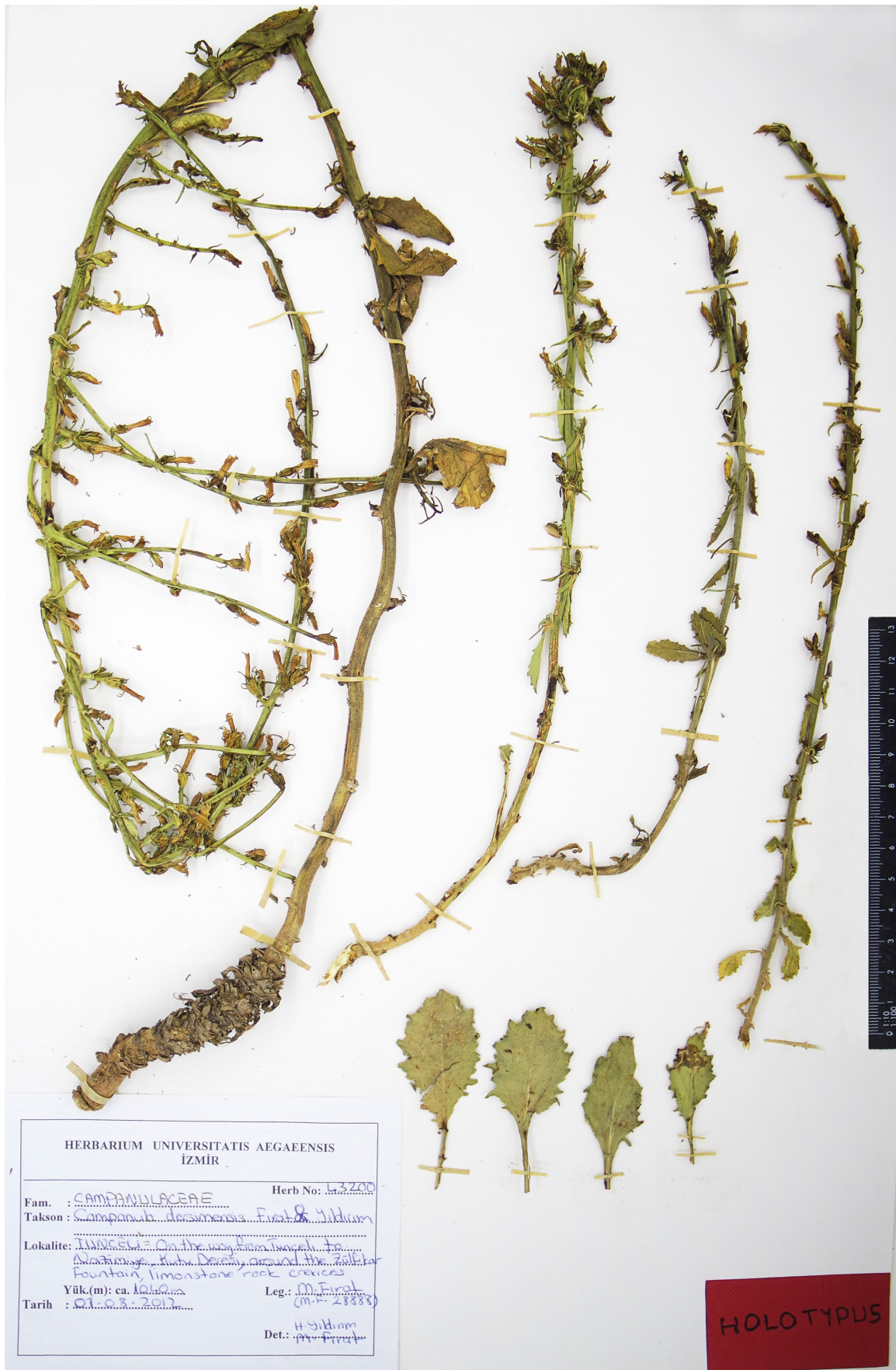
Fig. 1. Holotype of Campanula dersimensis : M. Firat 28888 (EGE 43200).