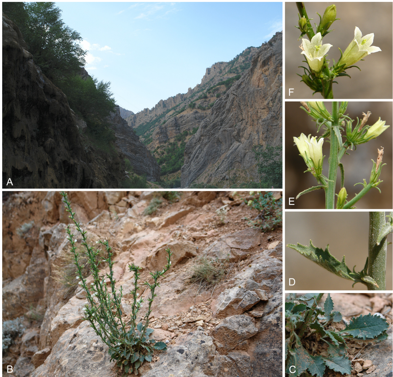
Fig. 2. Campanula dersimensis : A: habitat; B: habit; C: rosette leaves; D: part of stem, cauline leaf and indumentum; E: part of inflorescence; F: flowers. – Turkey, Tunceli, 2012, photographs by Mehmet Firat.

of C. sect. Rupestres were also used to obtain a compatible tree with the CAM17 clade of Mansion & al. (2012).