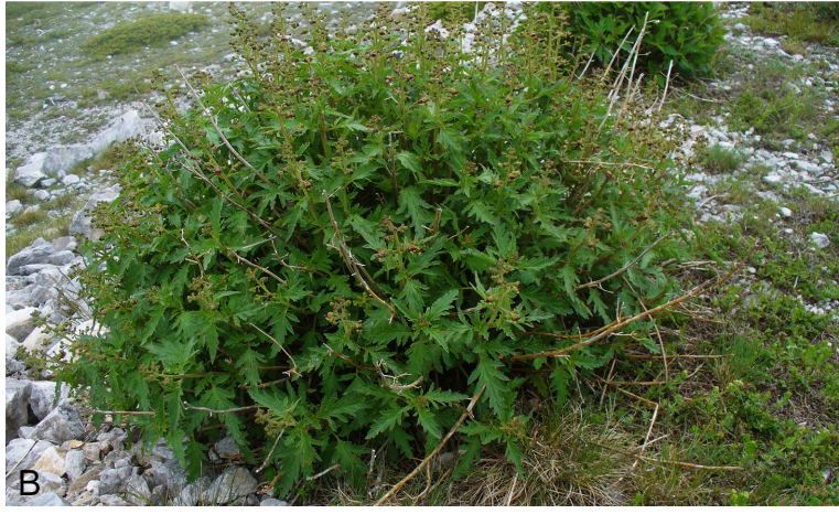
Fig. 2. Habitats of Scrophularia bulgarica (A) and S. heterophylla subsp. laciniata (B). – A: conglomerate cliffs in Sokolna reserve, C Stara Planina; B: calcareous scree slopes, near Orelyak summit, Pirin mountains.

Nikolić & al. 1986; Ranđelović & Stamenković 1986; Lakušić & Niketić 1988; Gajić 1989; Krivošej 1997; Ranđelović & al. 2000; Bogosavljević & al. 2008). A revision of the herbarium material from these localities revealed that in some localities (mostly Balkan mountains and gorges of E Serbia) records of S. heterophylla subsp. laciniata were in fact misidentifications of S. bulgarica . It was also found that S. heterophylla subsp. laciniata does not actually grow in E Serbia and its range is confined to C and S Serbia.