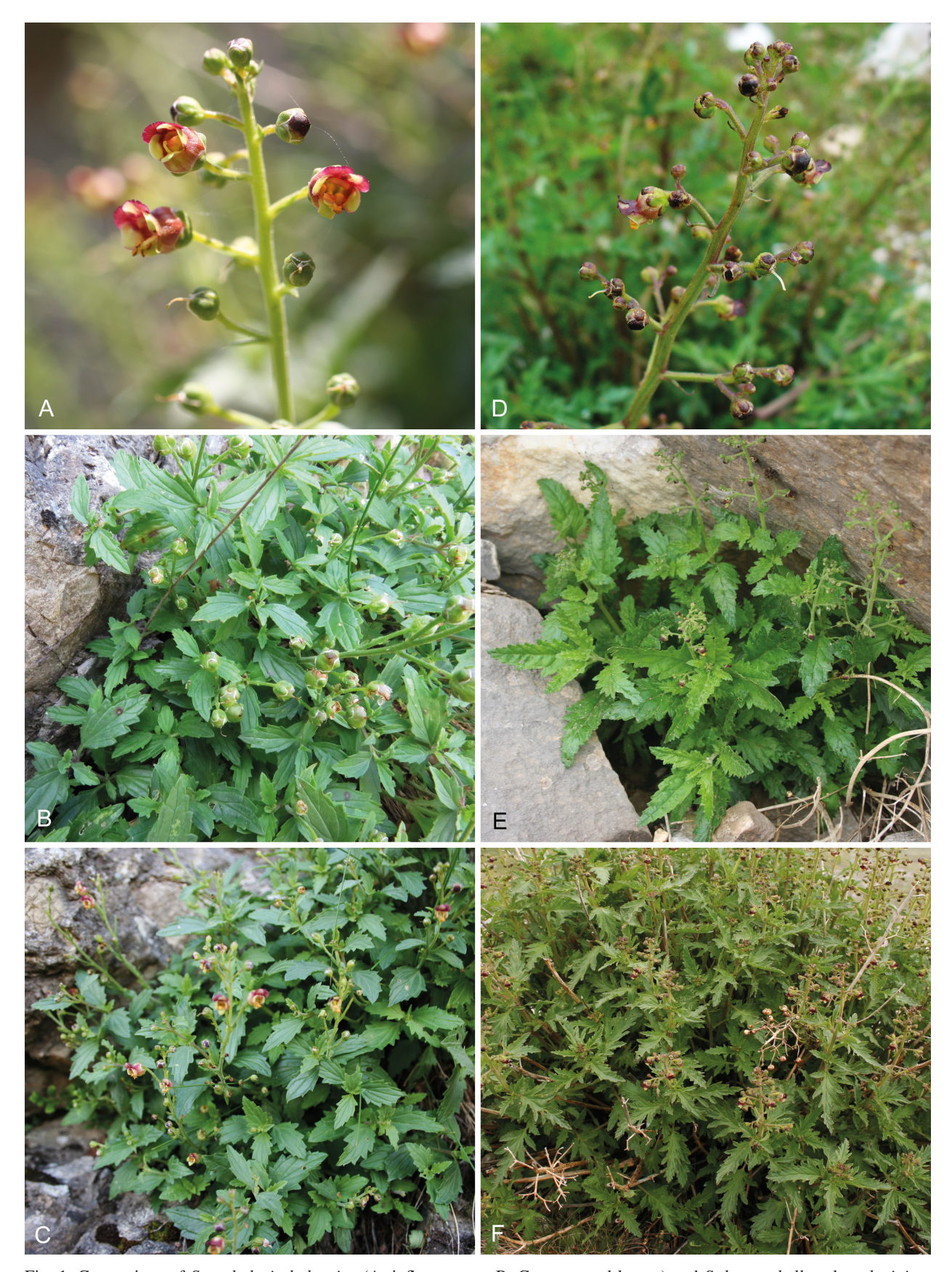
Fig. 1. Comparison of Scrophularia bulgarica (A: inflorescence; B, C: stems and leaves) and S. heterophylla subsp. laciniata (D: inflorescence; E, F: stems and leaves).