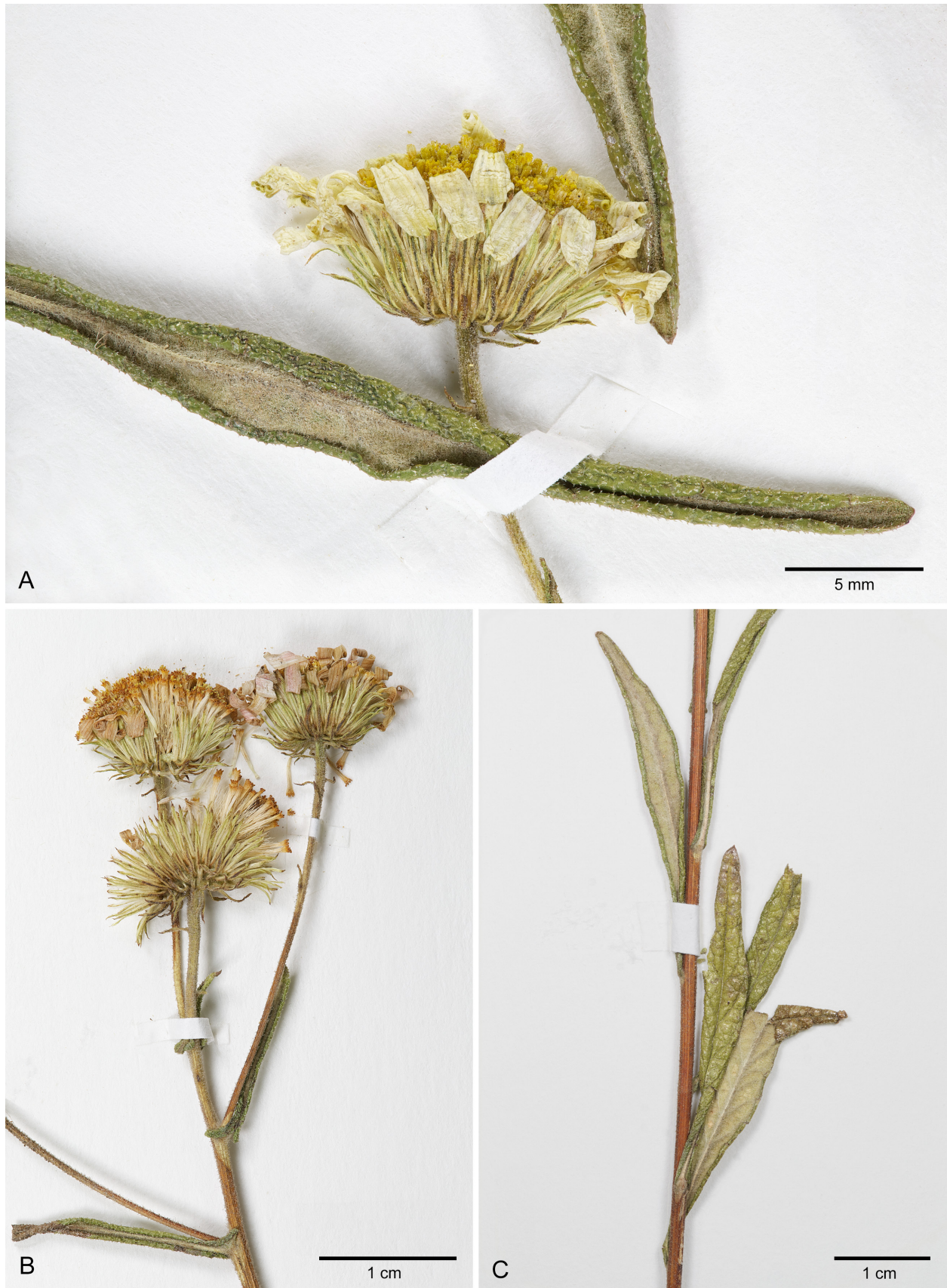
Fig. 4. Vicoa anisopappoides – A: capitulum and revolute leaves; B: synflorescence with three capitula; C: xeromorphic leaves with bullate, scabrid upper surface, revolute margins and white tomentose lower surface. – A–C: from the holotype, PH & al. 6033 (S S07-16156), photographs by Jennifer Kearey.