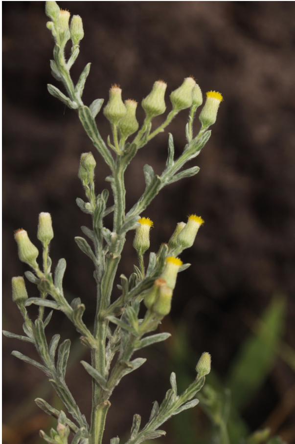
Fig. 6. Galgera decurrens – Namibia, Caprivi Strip, Bukalo, 31 Jan 2018.

This genus is a member of the Inuleae–Plucheinae related to, e.g., Nicolasia S. Moore and Doellia Sch. Bip. ex Walp. in the large “Pluchoid” clade mentioned above (Nylinder & Anderberg 2015; Fig. 2). Laggera species (Anderberg 1991) have winged stems or at least long decurrent leaf bases, florets with purple or pink corollas, and styles with obtuse sweeping-hairs extending below the bifurcation. Nylinder & Anderberg (2015) found that Laggera was polyphyletic as presently circumscribed because one of its species, viz. L. decurrens , belongs in a different clade within the subtribe. Apart from its distant relationships to other species of Laggera , L. decurrens also differs from them in morphology by having capitula with yellow corollas, tailed anthers with polarized endothelial tissue wall thickenings, and styles with acute sweeping-hairs ending above the bifurcation. It is here found as sister to Antiphiona close to the Geigeria–Ondetia and Calostephane–Pegolettia clades (Fig. 2). In Nylinder & Anderberg (2015) the Geigeria–Ondetia pair is sister to Antiphiona–Laggera decurrens . Like Antiphiona , these were formerly members of the Inuleae–Inulinae . They have florets with yellow corollas (purple with yellow tips in Antiphiona ), styles with acute sweeping-hairs ending above the bifurcation (below in Geigeria Griess.) and polarized endothelial tissue. In these respects, they correspond well with the character