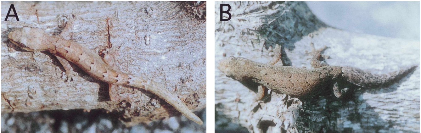
Fig. 3. Dorsal patterns of Lepidodactylus lugubris from the Ogasawara Islands and the Ryukyu Archipelago. A: clone A from Haha-jima (KUZ 47063). B: clone C from Zamami-jima, Okinawa Islands (KUZ 34867).