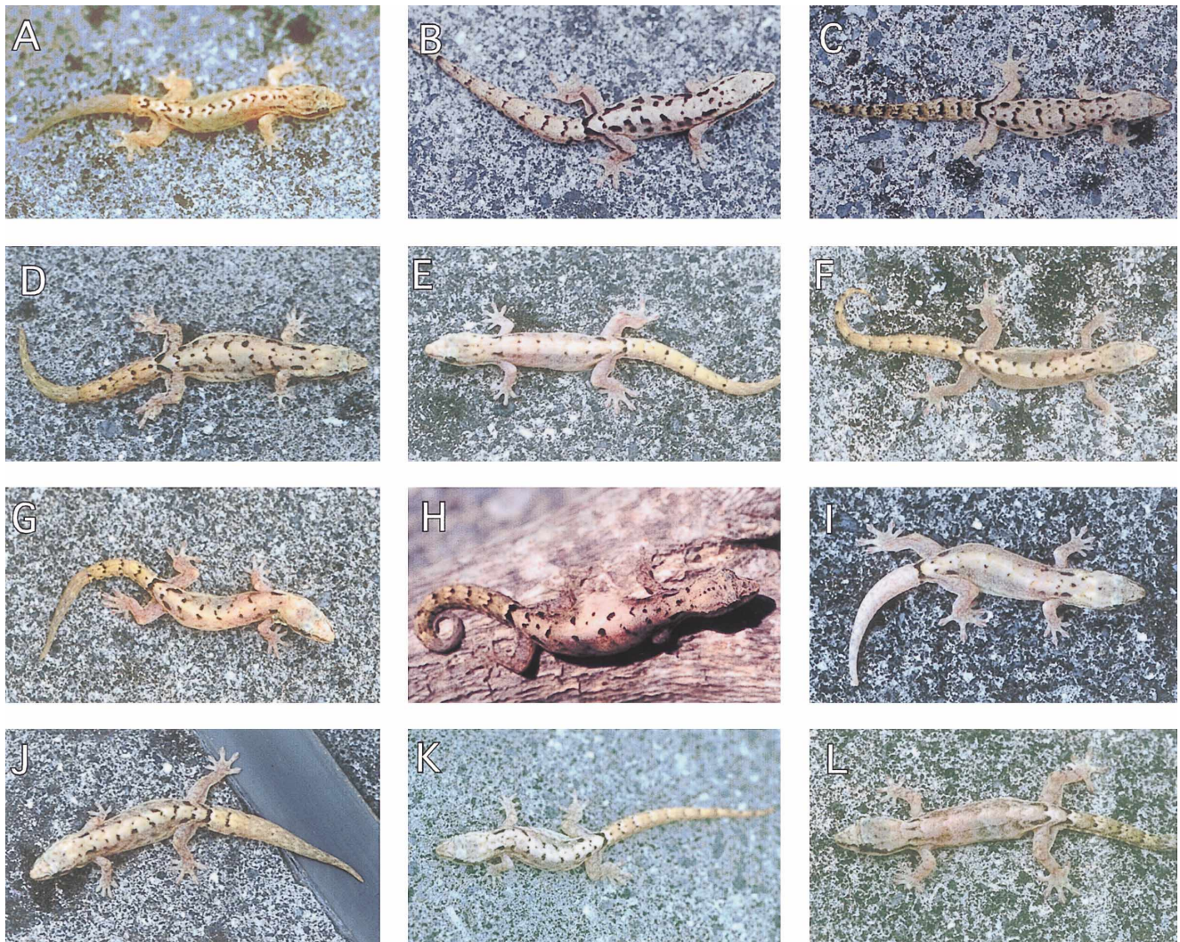
Fig. 4. Dorsal patterns of Lepidodactylus lugubris from the Daito Islands. A: clone Da from Minamidaito-jima (KUZ 48533). B: clone B from Kitadaito-jima (KUZ 48466). C: clone B' from Minamidaito-jima (KUZ 48482). D–J: clones BI-1–BI-7 from Minamidaito-jima (KUZ 48658, 48460, 48483, 48637, 34738, 48653, and 48638, respectively). K: clone BI-8 from Kitadaito-jima (KUZ 48530). L: clone N from Minamidaito-jima (KUZ 48463).