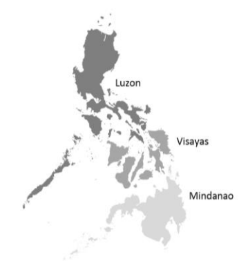
Fig. 1. Map of the Philippines with its main island groups Luzon, Visayas, and Mindanao; author processed based on NAMRIA (2017)