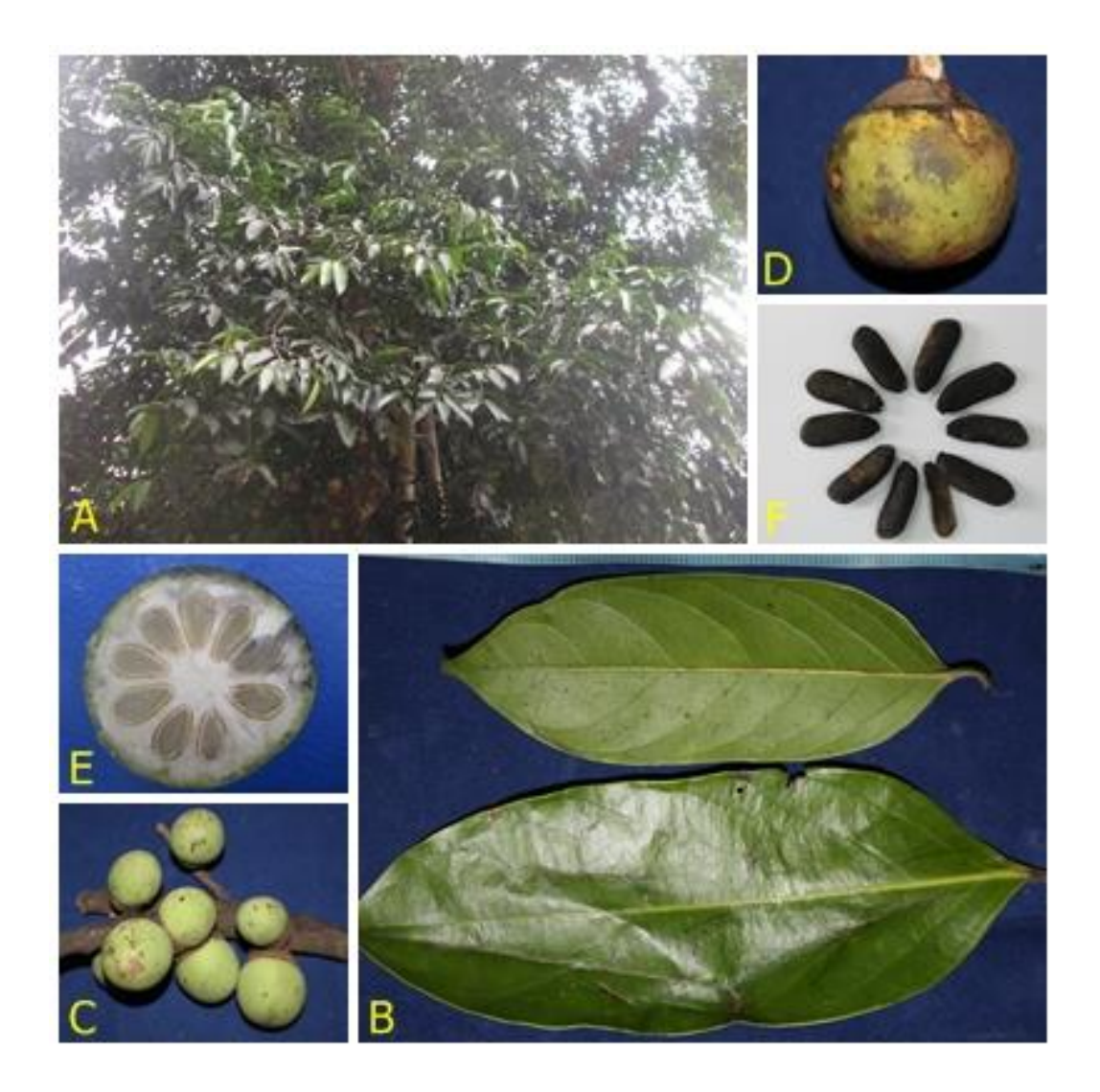
Fig. 1. Diospyros phuketensis Phengklai (Photo by Hoang Thanh Son, February, 2016, Quang Ngai Prov.). A. Tree. B. Leave (lower surface and upper surface). C. Inflorescence fruits. D. Mature fruit. E. Cross-section of fruit. F. Seeds.

on the lower surface and subdepressed on the upper surface; scalariform veins usually distinct on the lower surface; reticulate veins hardly distinct; petiole 1-1.5 cm, grooved on the adaxial side, white adpressed-pubescent, then glabrescent, dark brown when dry. Inflorescences not yet seen. Infructescences ramiflorous. Fruits depressed on both top, 4.5-5.5 by 4.0-6 cm, pubescent then glabrescent, yellowish brown with grey brown patches; fruiting calyx saucer-shaped, 1-1.5 by 3-4.5 cm, with 5 slightly undulate lobes along margin, densely pale lenticelate on outer part, annular ring-like between fruiting calyx and the end of fruit-stalk; fruit-stalk tubular, 15-20 by