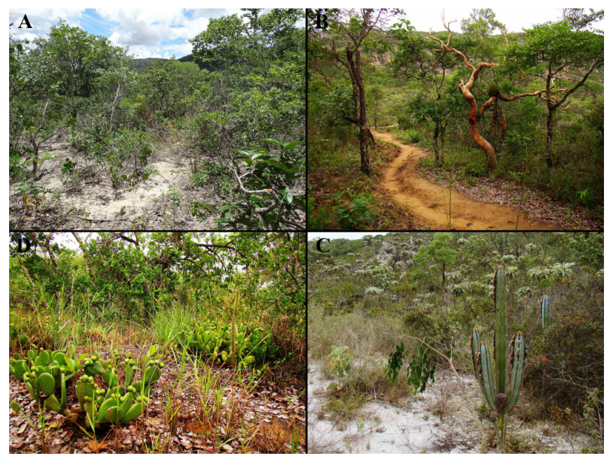
Figure 3. Environments where specimens of Psilophthalmus paeminosus were found at Parque Estadual de Grão Mogol, State of Minas Gerais, southeastern Brazil. Clockwise from upper left: A - closed, tall-shrubby, xerophilous vegetation on quartz sand soil; B - arboreal savannah, typical of the Brazilian Cerrado; C - open vegetation on sandy soil, with emphasis on the cactus Pilosocereus fulvilanatus ; D - leaf-litter in arboreal savannah, with emphasis on the "palm cactus" Tacinga inamoena .