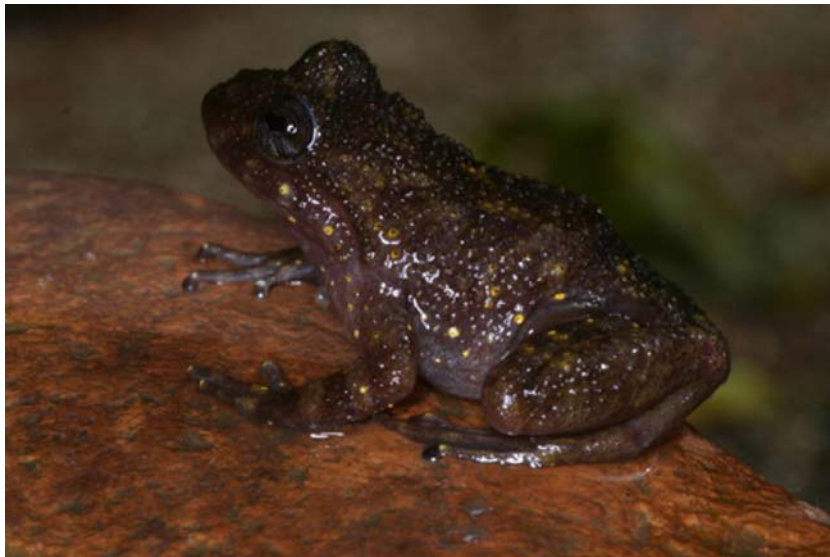
Figure 5. Male of C. izecksohni in life from the surroundings of Corupá (Santa Catarina, Brazil).