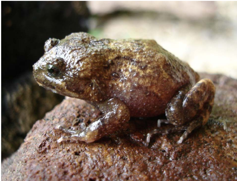
Figure 1. Female of Cycloramphus bolitoglossus in life, from Parque Nacional da Serra de Itajaí, Santa Catarina, Brazil (MCP 8725, 39.5mm).

Additional material of C. bolitoglossus was found recently in the herpetological collections of three natural history museums in Germany (Fig. 3). These historical specimens, which were in excellent conditions but partly misidentified and not yet inventoried, have been collected between 1918 and 1928 in the surroundings of Corupá (river basin of Rio Humboldt and Rio Novo) in northern Santa Catarina by the German collector Wilhelm Ehrhardt. This material comprised following specimens: ZMB 29997, 68240, 68184-186 (five specimens, see Gutsche et al. 2007a); ZMH A01745, A08793-95, A08796-8800, A08901 (ten specimens, see Gutsche et al. 2007b); and ZSM 103/1988 (two juvenile specimens). It is to remark that, in the ZSM collection,