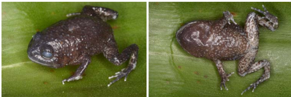
Figure 9. One of two recently collected specimens in pitfalls from Ilha de Santa Catarina, Santa Catarina, Brazil (MCP 8277-8278), preliminary identified as C. cf. catarinensis. A) dorsolateral, B) ventral views.

Finally, two specimens of Cycloramphus (Fig. 9) collected in November 2004 in insect pitfalls on the island of Ilha de Santa Catarina (UCAD Reserve near Florianópolis) extend the