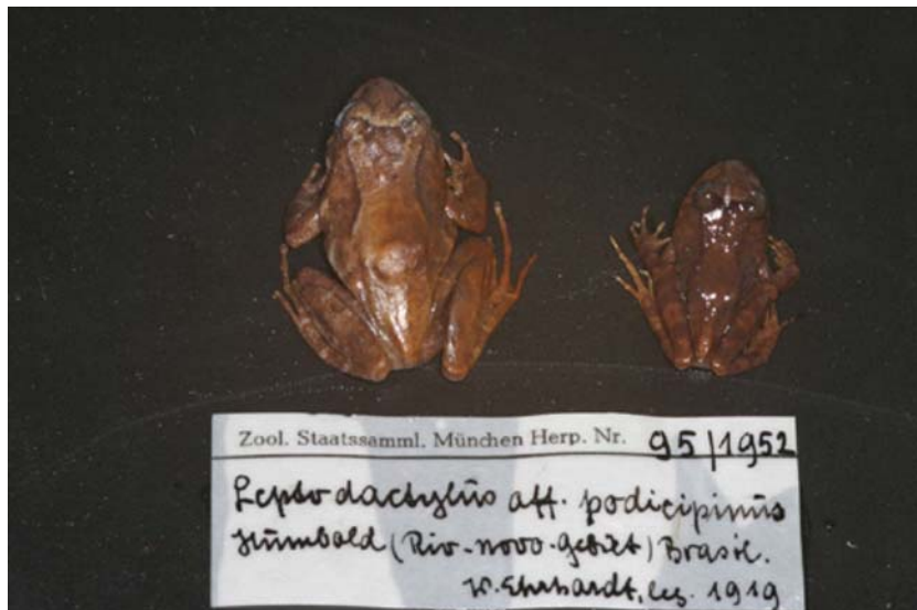
Figure 7. Two specimens of C. diringshofeni (labeled as Leptodactylus aff. podicipinus ) in the ZSM collection, collected near Corupá (Rio Novo, Santa Catarina, Brazil) by W. Ehrhardt.

differences to specimens of C. asper we examined. During our studies in the ZMB collection we rediscovered two type specimens of C. asper which were considered “probably destroyed” according to Heyer (1983a) or “possibly lost” according to Frost (2007). These syntypes (two specimens without numbers according to Heyer 1983a) of Niedenis spinulifer Ahl, 1924 (a synonym of C. asper ) are inventoried under ZMB 26867 and 63129 (Fig. 8). According to the label the locality is given as “?Ndjiri-Sümpfe? ?Schillings?” (meaning Ndjiri swamps, Schillings?), but the type locality of this species was regarded “surely southern Brazil” by Bokermann (1966).