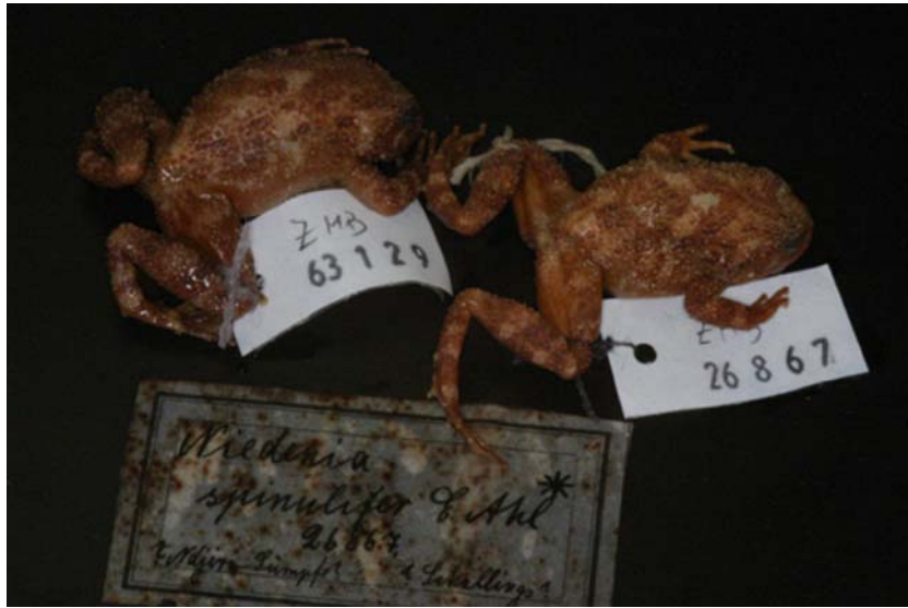
Figure 8. Two rediscovered syntypes (ZMB 26867 and 63129) of Niedenia spinulifer (= C. asper ) in the ZMB collection (locality restricted to “surely southern Brazil” by Bokermann (1966)).