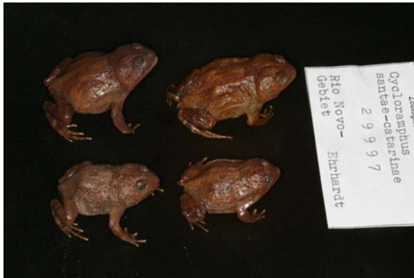
Figure 3. Historical material of C. bolitoglossus in the ZMB collection, collected near Corupá (Rio Novo, Santa Catarina, Brazil) by Wilhelm Ehrhardt.