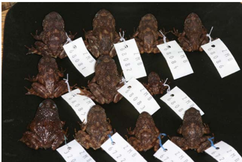
Figure 6. Historical material of C. izecksohni in the ZMB collection, collected near Corupá (Rio Novo, Santa Catarina, Brazil) by W. Ehrhardt.