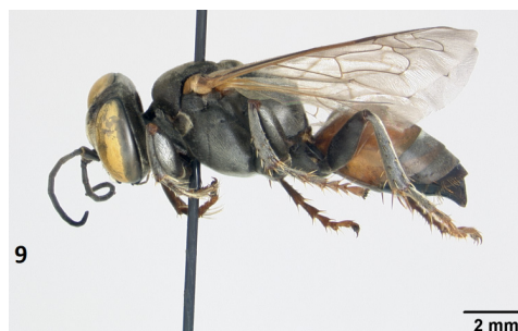
Figure 9. Tachysphex dignus .