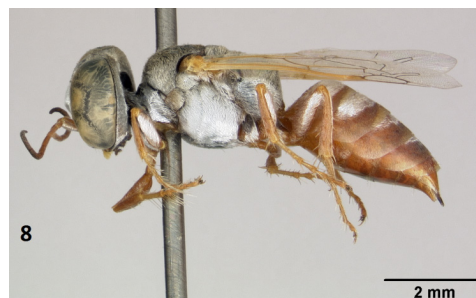
Figure 8. Tachysphex deserticola .