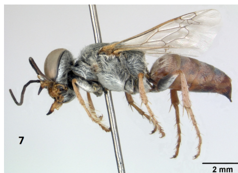
Figure 7. Tachysphex argentatus .

Distribution in Saudi Arabia: Wadi Majarish (Pu-