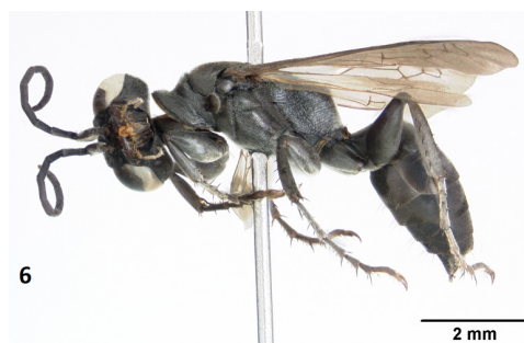
Figure 6. Liris festinans praetermissus .

Material Examined: 1♂, 28.vi.2007, Hutet Beni Tamim (180 Km south of Riyadh).