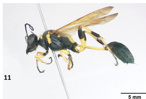
Figure 11. Sceliphron madraspatanum .

Distribution in Saudi Arabia: New for the fauna of Saudi Arabia.