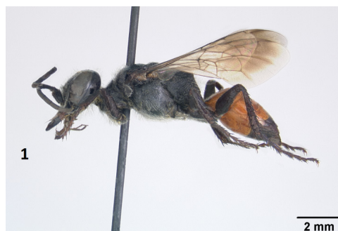
Figure 1. Astata boops .

General Distribution: PA (Croatia, Greece, Israel, Italy, Syria, Turkey).