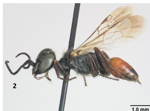
Figure 2. Dryudella nephertiti .