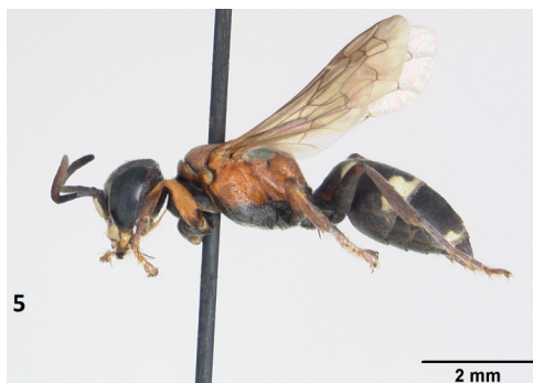
Figure 5. Harpactus formosus .

Material Examined: 1♀, Hutet Beni Tamim (180 Km south of Riyadh), 19.vii.2008.