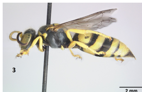
Figure 3. Bembecinus asiaticus iranicus .