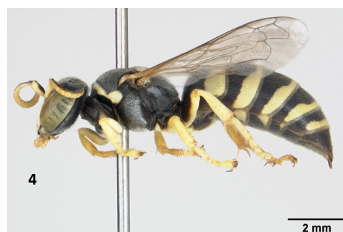
Figure 4. Bembecinus meridionalis .