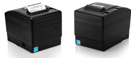
Comparison Table of SRP-S300 Series