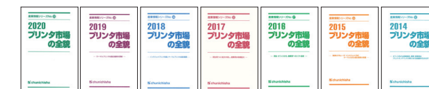
Chunichisha, Japan (2014-2020), Whole Picture of the Printer Market

According to latest printer market research report by Chunichisha, the Japanese Research Company, BIXOLON secures its seventh consecutive year as the global leader in the mobile receipt printer market.