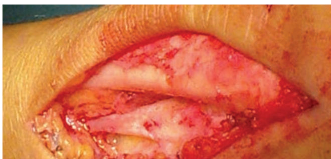
Figure 2 Thickened and widened plantaris tendon found ventral (deep side) to the medial side of the Achilles mid- and distal portion. Notice fat tissue interpositioned between the Achilles and plantaris tendons.