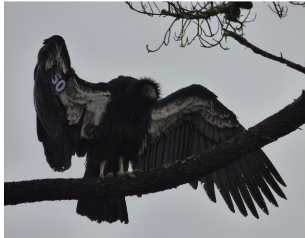
A California condor in the Carmel Highlands.

But unlike most of their contemporaries, which went extinct 10,000 or more years ago, California condors persisted, albeit with a dramatically reduced range. The dynamics of this decline and persistence, as revealed by the contrast with another group of birds, the teratorns, are the subject of this article.