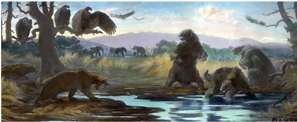
This mural of a La Brea tar pit, painted in the 1920s by Charles R. Knight, depicts a variety of Pleistocene megafauna, some perhaps about to become stuck in the tar. Several Merriam's teratorns can be seen perched and flying in the upper left corner.

Merriam's teratorn was first described in 1909 from the La Brea Tar Pits of Los Angeles. It has since become California's, and by extension the world's, best-known teratorn, with the La Brea location alone yielding remains of over 100 individuals. Because these fossils were recovered alongside those of woolly mammoths, giant ground sloths, and saber-toothed cats, among other large mammals, scientists long speculated that Merriam's teratorns were scavengers, alighting on dying animals and suffering with them their tar-trapped fate.