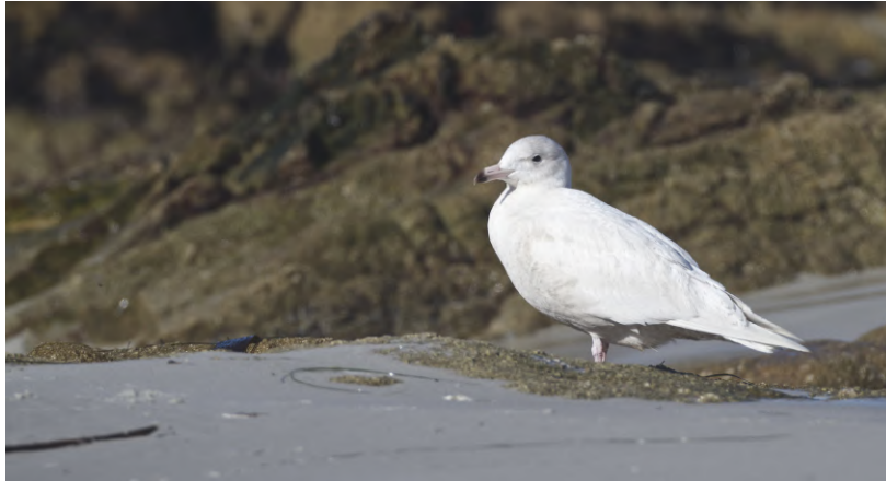
Glaucous gulls like this one, photographed at Bird Rock in Pebble Beach in 2013, are rare winter visitors to the Monterey Peninsula.