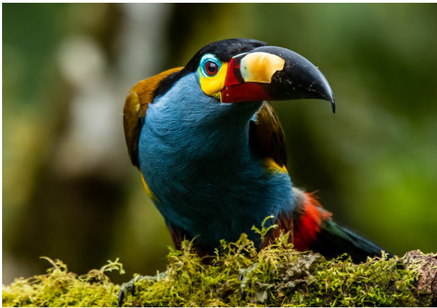
Plate-billed mountain toucans like this one live in Andean forests in Ecuador and Colombia.