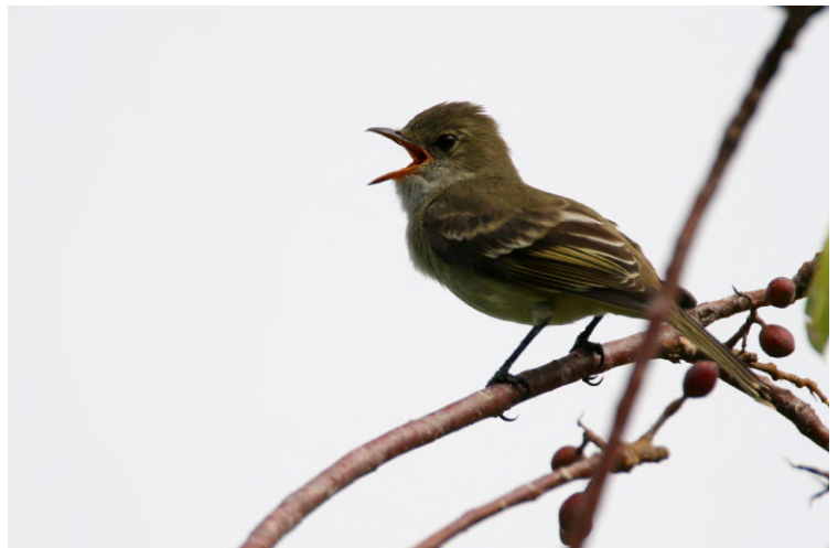
This Caribbean elaenia is a member of Tyrannidae, a family of New World flycatchers whose species are often more easily identified by sound than appearance.