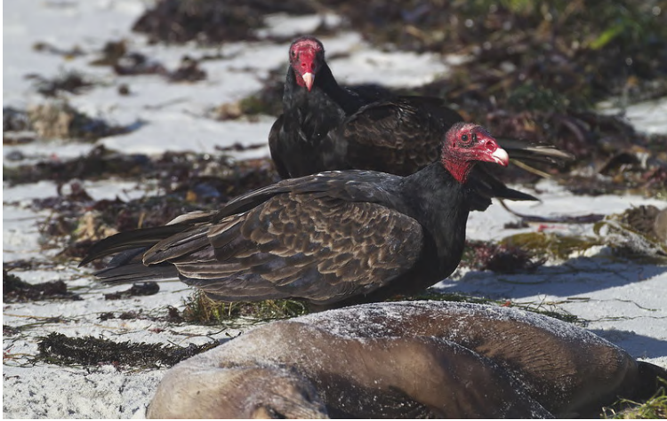
Turkey vultures in Pebble Beach scavenge a dead California sea lion, in much the same fashion as condors would.

Condors living farther inland or on less productive coasts like those of Florida or the Gulf of Mexico, where marine life was never sufficiently abundant to supplement the birds' otherwise land-based diet, went extinct. Even as recently as the 1980s, when the wild California condor population declined to a mere 22 individuals, the species' last redoubt was in the Transverse Mountains of its namesake state, just a short distance from the rich and diverse ecosystems of the coast.