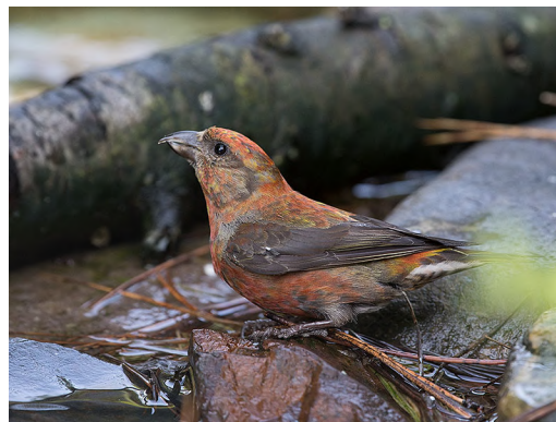
From left to right, a common loon and red crossbill, two noteworthy finds in this winter’s Christmas Bird Counts.