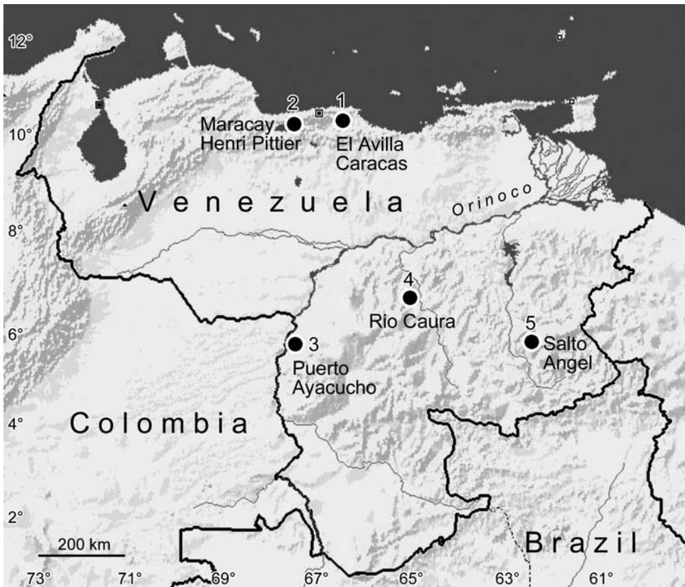
Fig. 1: Relief map of Venezuela with dots indicating the geographical position of the investigated localities (based on Microsoft Encarta Weltatlas Version 98; designed by W. Obermayer).