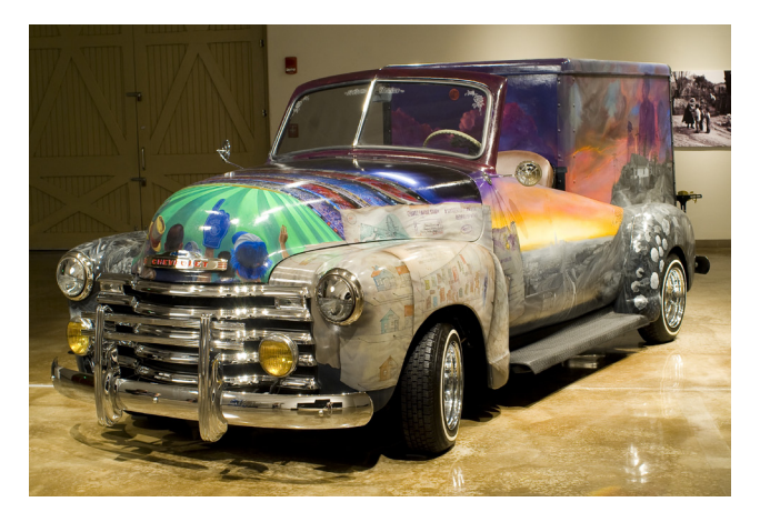
Figure 3. Ry Cooder / Vincent Valdez, El Chavez Ravine , 2005–7. Oil on 1953 Chevy ice cream truck. Collection of Ry Cooder.

The City I and II constitute Valdez's most recent investigation of U.S. histories characterized by discrimination and racially motivated violence. In his 2005 El Chavez Ravine collaboration with musician Ry Cooder (fig. 3), for example, Valdez explored the oppression of Mexican and Mexican American communities in the Chavez Ravine neighborhood of Los Angeles. In the early 1950s, city officials seized Chavez Ravine properties through exercise of eminent domain, with guarantees of improved housing, education, and health facilities. El Chavez Ravine features an urban confrontation between the rapidly modernizing city and Los Angeles's historic neighborhoods. Chavez Ravine homes were eventually demolished to make way for Dodger Stadium, leaving promises of urban renewal unfulfilled. A reminder of the loss of a community and a way of life, the pictorial narrative unfolds around a 1953 Chevy ice cream truck that might have circulated in the Chavez Ravine neighborhood.