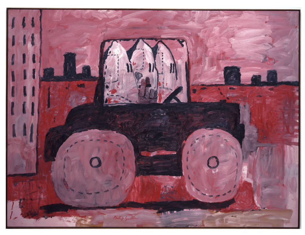
Figure 4. Philip Guston, City Limits , 1969. Oil on canvas, 77 x 103 1/4 in. The Museum of Modern Art. Gift of Musa Guston. © The Estate of Philip Guston and The Museum of Modern Art / Licensed by SCALA / Art Resource, NY.

The Strangest Fruit, a series of nine paintings produced by Valdez in 2013 (figs. 6, 7), is a study of lynching imagery in the United States that exemplifies Valdez's interest in employing art as a vehicle to acknowledge untold stories and bring to light invisible histories.9 Valdez draws visual connections between the use of lynching to terrorize African Americans and the lesser-known history of its use against people of Mexican origin and descent. 10 The Strangest Fruit depicts ten male figures rendered naturalistically against expansive white backgrounds: All of them hang from invisible nooses.<sup>11</sup> Dressed in contemporary clothes and bound by an invisible rope, Valdez's ten Mexican and Mexican American figures evoke the positions of men put to death by mobs. The inclusion of contemporary details in The Strangest