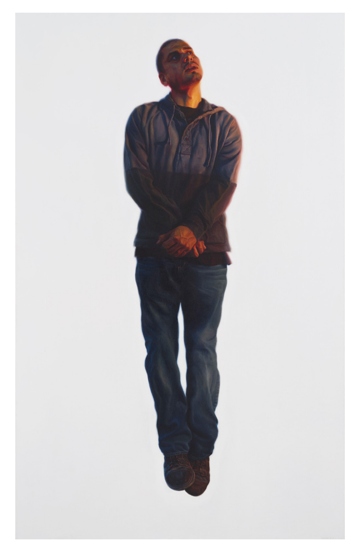
Figure 7. Vincent Valdez, Untitled , from the series The Strangest Fruit , 2013, oil on canvas, 92 x 55 in., Blanton Museum of Art, The University of Texas at Austin, Promised gift of Jeanne and Michael Klein, 2016. © Vincent Valdez.