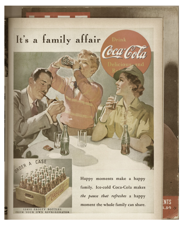
Figure 2. Reproduction of Coca-Cola advertisement as published in an issue of Life magazine, October 4, 1937.