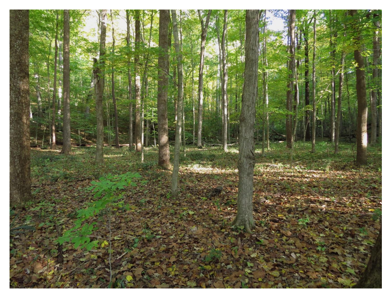
Figure 14: Mesic floodplains occur on high terraces that rarely experience flooding.

wildflowers occurs in this habitat including bent, prairie, and sessile trilliums ( Trillium sessile ), celandine poppy, dwarf larkspur, Dutchman's breeches, cutleaf toothwort, spring beauty, and Jack-in-the-pulpit. Woodland fescue and wild ryes ( Elymus spp. ) are common grasses.