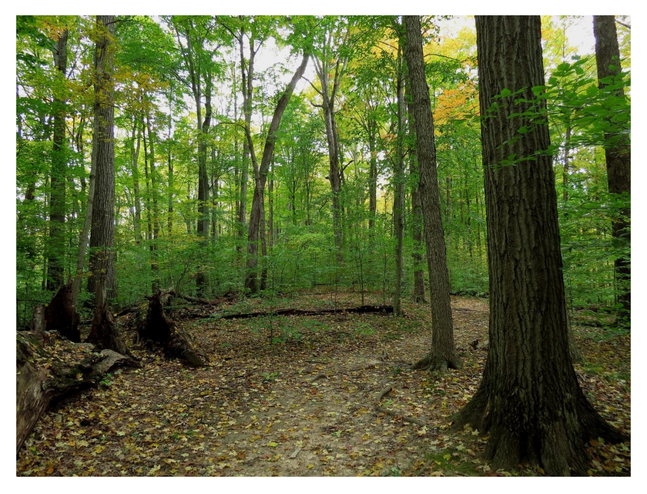
Figure 6: Mature mesic woodland on limestone ridges.

Due to deeper soils and gentle grades, these ridges are one of the most resilient communities for trail development. Their wide, relatively flat tops provide ample space for trail placement. However, where the trail departs this community to drop to lower elevations, careful engineering must be applied to prevent the trail from being utilized as a conduit for runoff from the ridgetop.