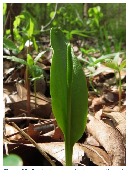
Figure 28: Ophioglossum vulgatum was the only new fern located in the survey

One new species of fern was located in the park. Several specimens of the obscure adder's tongue fern ( Ophioglossum vulgatum ) were observed in the mesic floodplain woods in the eastern portion of the park. This tiny fern was observed in April before it could be concealed by the lush floodplain vegetation.