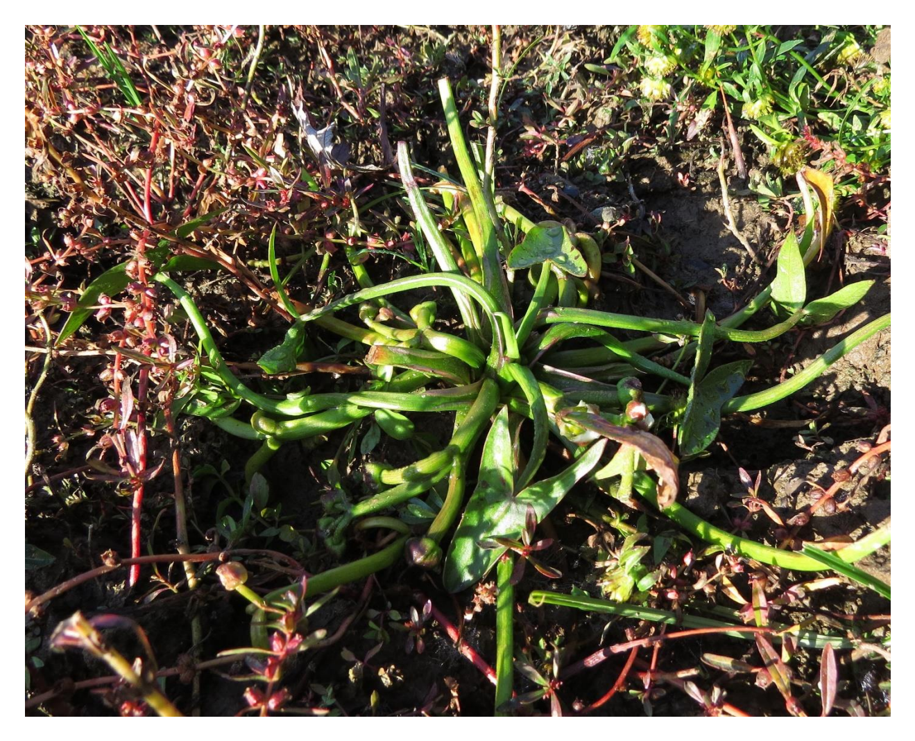
Figure 23: Hooded arrowhead(Sagittaria montevidensis spp calycina was discovered on the mudflats.

Surprisingly, an additional species of canopy tree, Shumard oak ( Quercus shumardii ) was found to be common in the mesic woodlands in the northwest corner of the park. They are easily confused with northern red oak and had apparently been overlooked on previous inventories. Shumard oak prefers calcareous soils, so its presence in the western edge of the park where the limestone is more prevalent is not surprising.