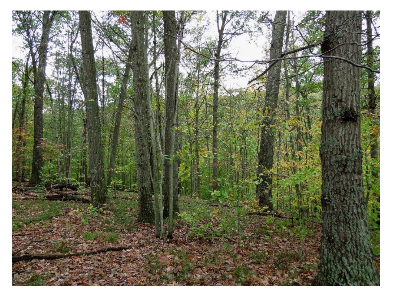
Figure 3: Dry ridge with scarlet oak as the dominant overstory species.

Due to thin soils, these slopes should be regarded as fragile natural areas to be avoided when possible. In areas where existing trails pass through them, the trails should follow the contours and be engineered to divert water from the trail. On the north side of the reservoir, the trail that passes through this community is already severely eroded and contains numerous footpaths down the slope to the waters' edge. This trail requires major reconstruction with constructed paths to the water for observation and fishing. Like the dry ridges, this community provides vital habitat for reptiles such as fence lizards.