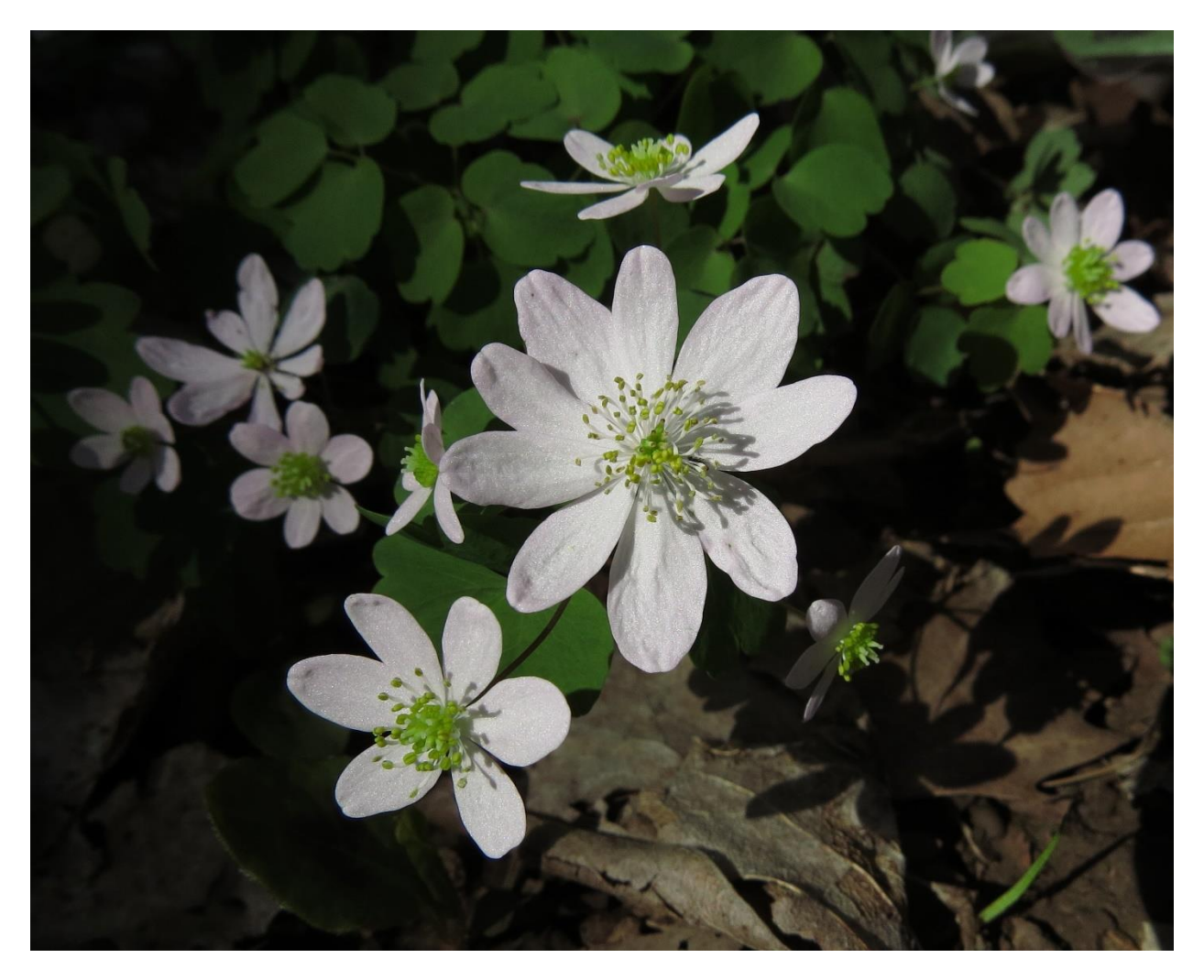
Figure 7: Rue amemone is commonly seen on mesic ridges and slopes