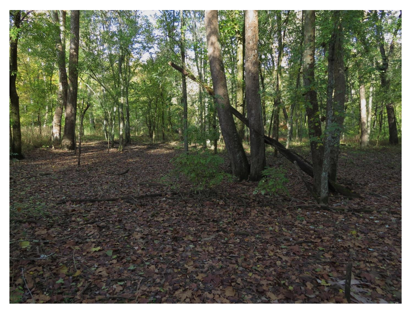
Figure 16: Depressions like this one in the wet floodplain woodlands are important amphibian breeding habitat

maple. False nettle is abundant in the herbaceous layer. Common graminoids include wood reed ( Cinna arundinacea ), fowl manna grass ( Glyceria striata ), hop sedge ( Carex lupulina ) and awl-fruited oval sedge ( Carex tribuloides ).