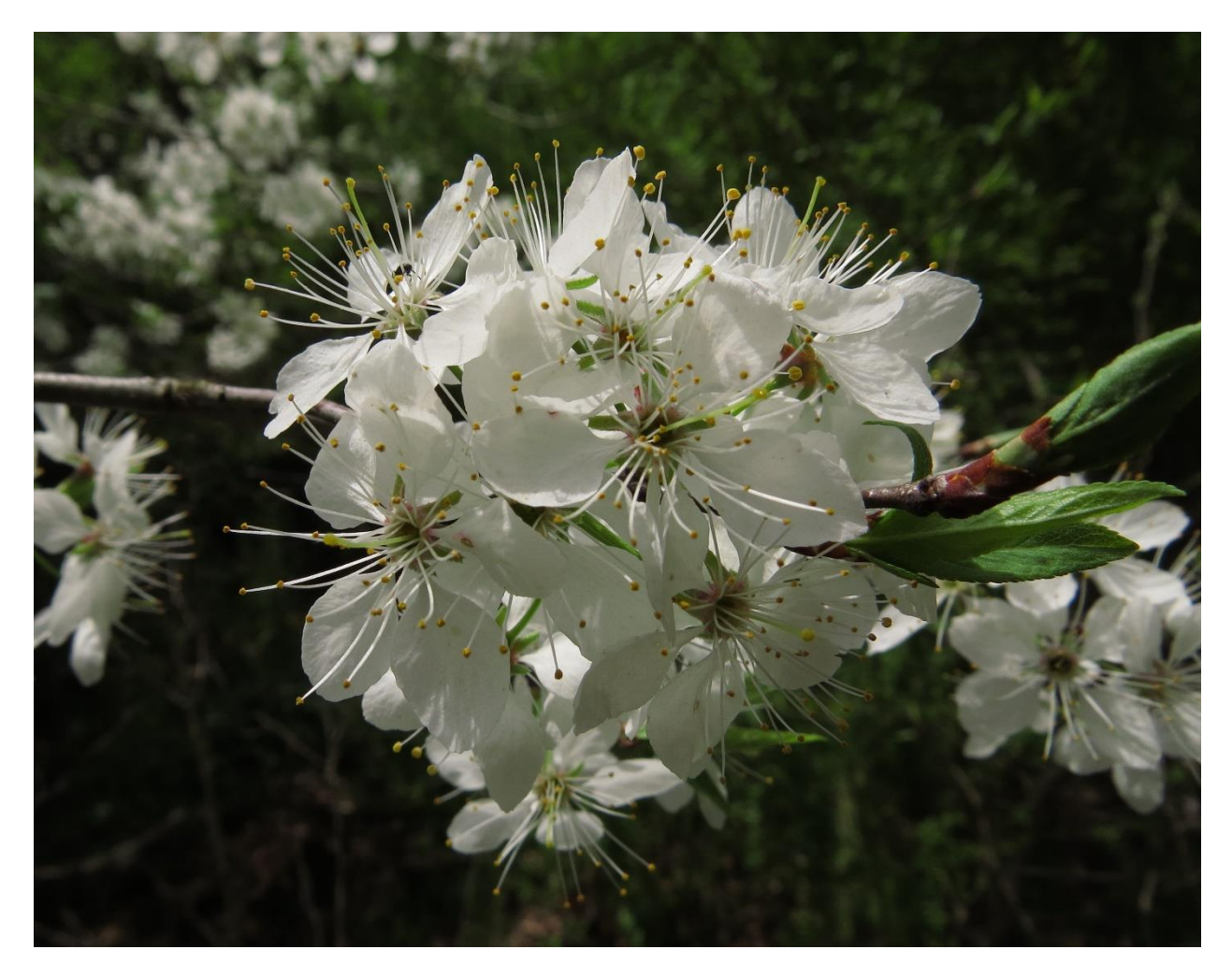
Figure 25: Prunus americana was discovered on the wet-mesic floodplain of Griffy Creek.

A single colony of American plum ( Prunus americana ) was found on the wet-mesic floodplain of Griffy Creek as well. Other small flowering trees that were identified and not previously recorded included roughleaf dogwood ( Cornus drummondii ) and downy hawthorn ( Crateagus mollis ). Finally, another understory tree that had not been confirmed on previous surveys was downy serviceberry ( Amelanchier arborea ). It is not readily separated from the closely related Allegheny serviceberry ( Amelanchier laevis ) except when in bloom. Fortunately, both species were blooming side by side on a dry wooded slope during the plant community mapping in April, facilitating an ID.