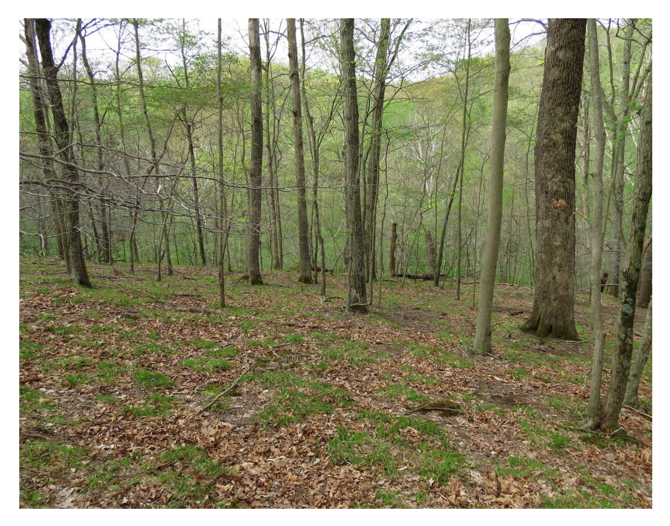
Figure 5: Dry mesic slopes occur on south and west-facing aspects