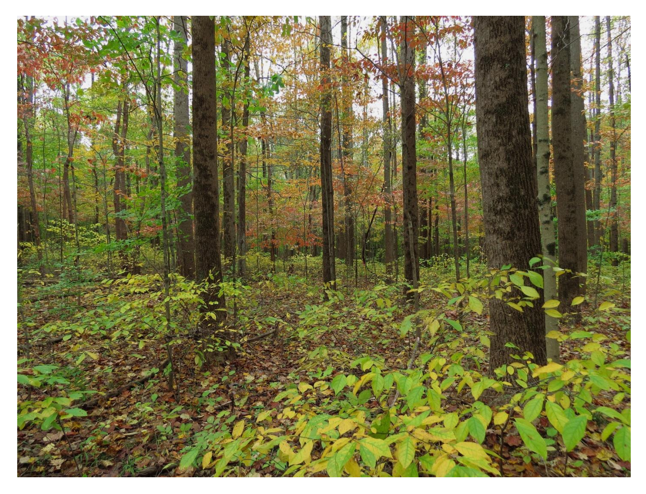
Figure 8: Young woodlands on mesic ridges with tulip trees as the dominant overstory tree