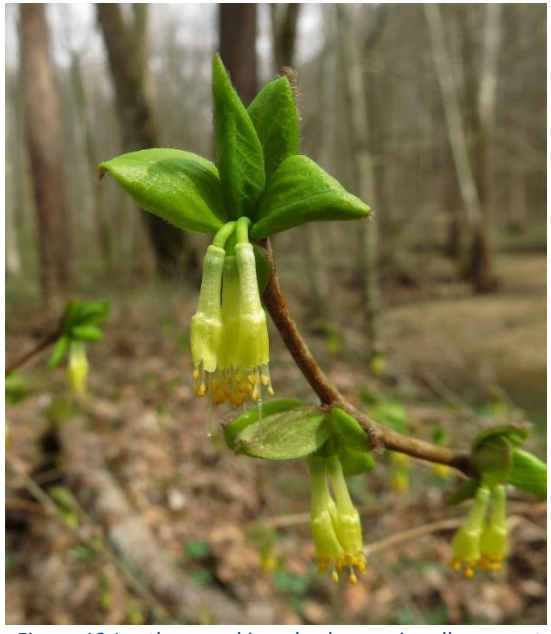
Figure 13:Leatherwood is a shrub occasionally present in mesic and wet mesic floodplains.