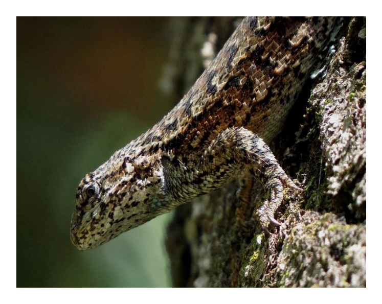
Figure 21: Northern fence lizards are commonly seen on dry slopes

Northern Fence Lizard (Sceloporus undulatus hyacianthinus)