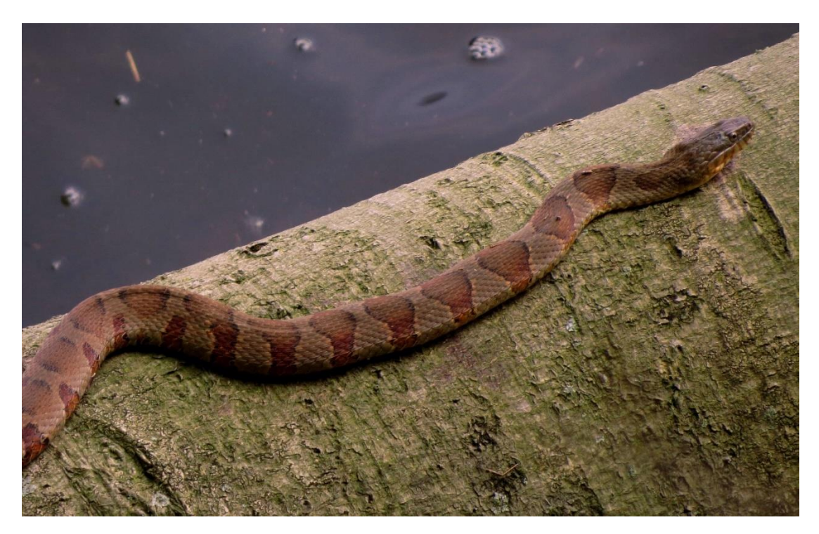
Figure 19: Midland banded water snakes are commonly seen along the edges of the reservoir