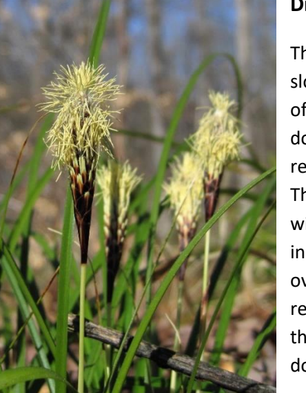
Figure 2: Male flowers of Carex picta