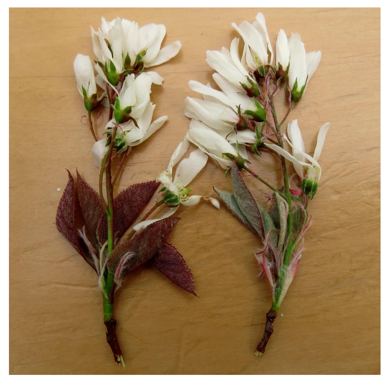
Figure 26: Amelanchier laevis (left) and Amelanchier arborea (right), the latter not previously identified in the park.

Cleft phlox (Phlox bifida) was a new herbaceous species found on a dry slope in the eastern portion of the park. Although it is common further east in dry woodlands in the Brown County Hills, it rare at Griffy Lake Nature Preserve.