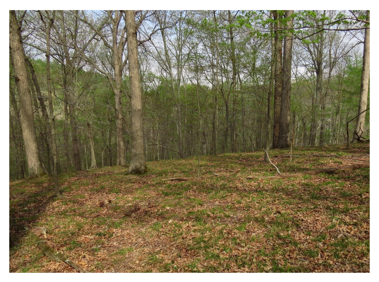
Figure 4: Carex picta often forms a nearly continuous groundcover on dry mesic ridges

Although these ridges general have deeper soils than the dry ridges, they are still very prone to damage from foot traffic and erosion, especially where they slope downward toward the lake. Trails that utilize these ridges should be engineered to frequently divert water from the trail to prevent downcutting erosion.