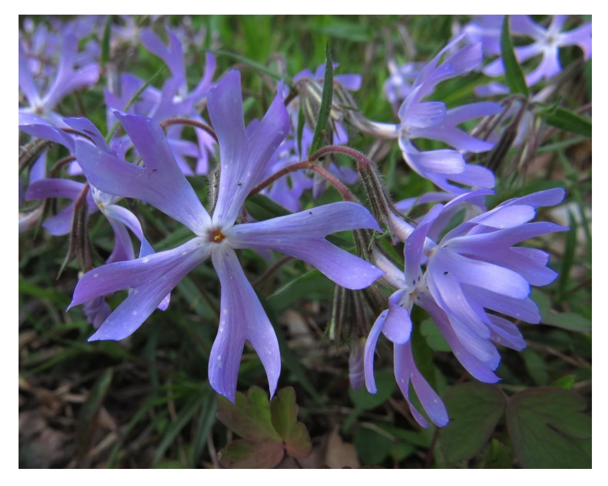
Figure 27: Phlox bifida was found on a dry slope in the eastern portion of the park.