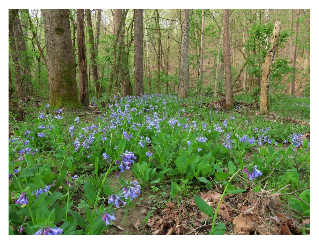
Figure 15: Virginia bluebells are frequent on wet-mesic floodplains of Griffy Creek

This community is subject to frequent inundation during flood events, however, the inundation is typically brief ranging from just a few hours to a day for extreme rainfalls. The existing trail that travels east from the boat rental parking lot traverses this community for most of its length. Persistent muddy conditions and scour during flood events are the primary limitations for trail construction through this community. Trail surfaces must not be allowed to erode below the grade of the surrounding floodplain to prevent persistent ponding. Surfacing the trail with crushed stone will help prevent rutting and widening of the trail that results from persistent muddy conditions and ponding. Trail planning in this area should also account for the likelihood of more frequent and severe flooding from extreme rainfall events exacerbated by climate change.