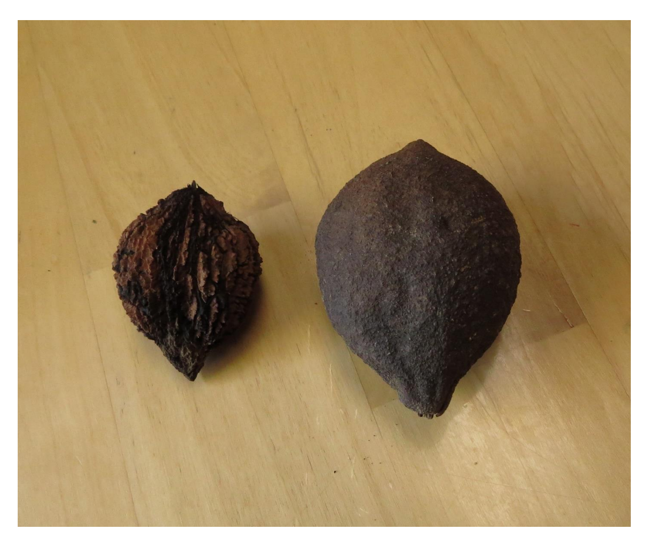
Figure 30: Unusual pointed black walnut found on the Griffy Creek floodplain