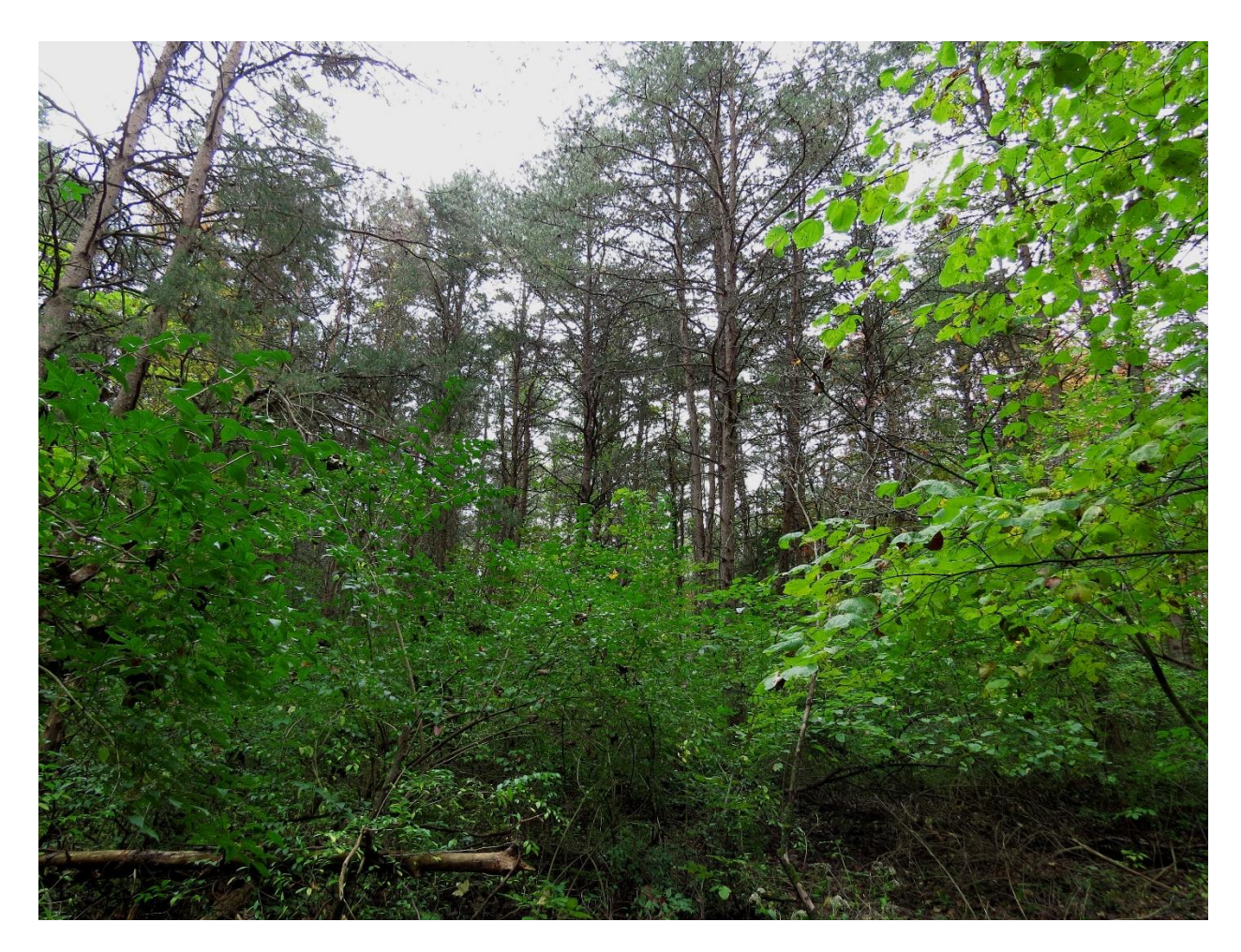
Figure 9: The pine plantings on limestone ridges are the lowest quality woodlands in the park