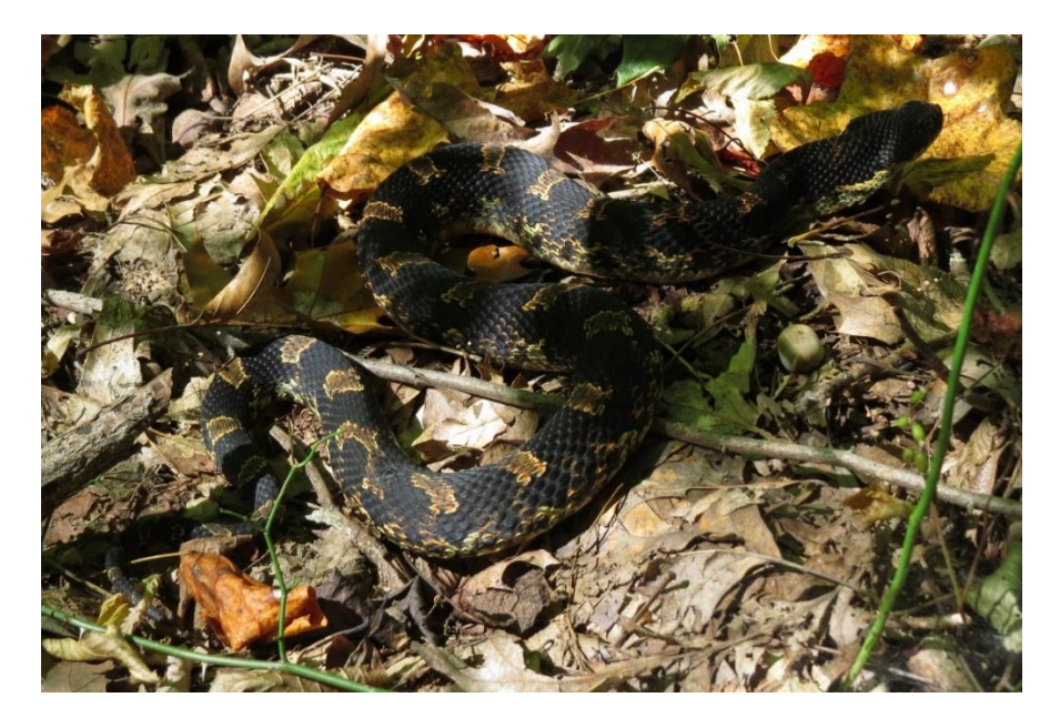
Figure 20: An eastern hognose snake was observed in early October on a mesic ridge