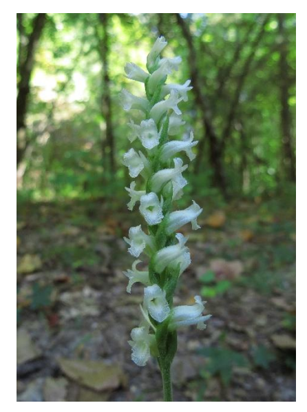
Figure 10 Spiranthes cernua was discovered at the edge of the sterile old field

This plant community occurs in one place on a limestone ridge in the northeastern part of the park. The dry sterile soil is likely at least partially the result of some prior land use as the surrounding area is young successional woodlands indicating it was cleared prior to construction of the reservoir. The open character of this community is also partially due to the excessive deer browse that limits tree recruitment. Herbaceous plants not found elsewhere in the park occurring in this area include purple milkwort ( Polygala sanguinea ), butterflyweed ( Asclepias tuberosa ), and beaked panic grass ( Coleataenia anceps ). This opening is threatened by the presence of the invasive autumn olive. Removal of this shrub from the vicinity should be a high stewardship priority.