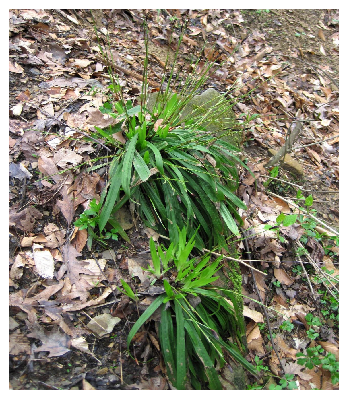
Figure 22: Carex plantaginea was one of 12 new Carex species found in the park

flatsedges ( Cyperus spp ), purplestem beggarticks ( Bidens connata ), and hooded arrowhead ( Sagittaria montevidensis ssp. calycina ).