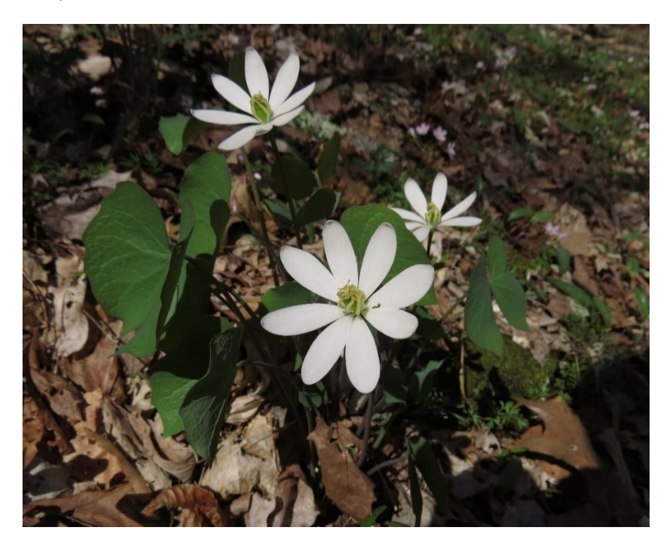
Figure 12: Twinleaf is frequent on ridge sloping mesic woodlands where calcareous soils exist.

Mesic slopes represent the largest block of woodland in the park and also contains many of the areas of highest natural area value. All aspects and degrees of slope are represented in this area from gentle grades to vertical cliffs. Trails traversing this community must be constructed with carefully grading and diversion of rainwater away from the trail. Grade reversals should be utilized to mitigate the slope in steep sections.