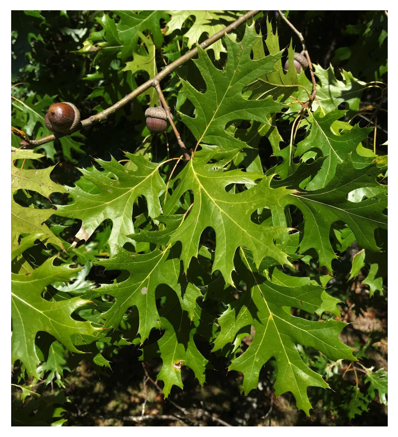
Figure 24: Leaves and acorns of Shumard oak, not previously reported in the park.