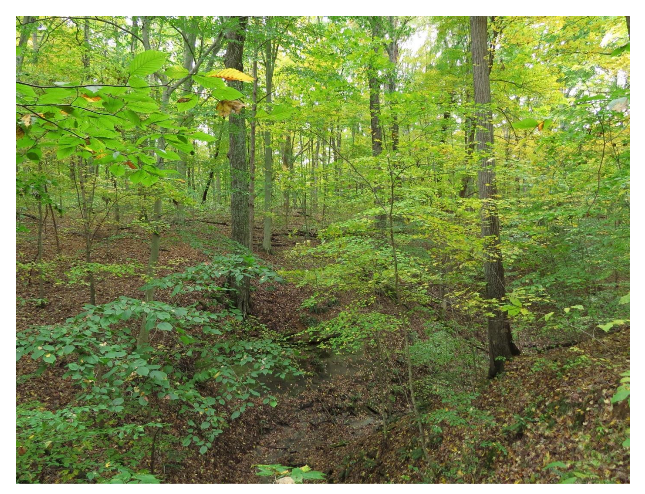
Figure 11: Mesic sloping woodlands contain a diverse variety of tree species sharing the canopy.

This is the most common plant community in the park. It also harbors the greatest diversity of canopy species of any of the communities in the park. Among these species are American beech, sugar maple, tulip tree, shagbark hickory, bitternut hickory, pignut hickory, northern red oak, white oak, black walnut, and American basswood ( Tilia americana ). The shrub layer contains spicebush ( Lindera benzoin ), blackhaw viburnum ( Viburnum prunifolium ), maple-leaf viburnum, and leatherwood ( Dirca palustris ). Herbaceous associates are varied and include a rich assemblage of spring ephemeral wildflowers, particularly in the ravines. Common spring wildflowers include prairie trillium ( Trillium recurvatum ), bent trillium ( Trillium flexipes ), squirrel corn ( Dicentra canadensis ), Dutchman's breeches ( Dicentra cucullaria ), celandine poppy ( Stylophorum diphyllum ), twinleaf ( Jeffersonia diphylla ), dwarf larkspur ( Delphinium tricorne ), cutleaf toothwort, spring beauty, harbinger of spring ( Erigenia bulbosa ), and Jack-in-the-pulpit ( Arisaema triphyllum ). A variety of woodland sedges occur in this habitat as well as beak grass ( Diarrhena americana ) and woodland fescue ( Festuca subverticillata ).