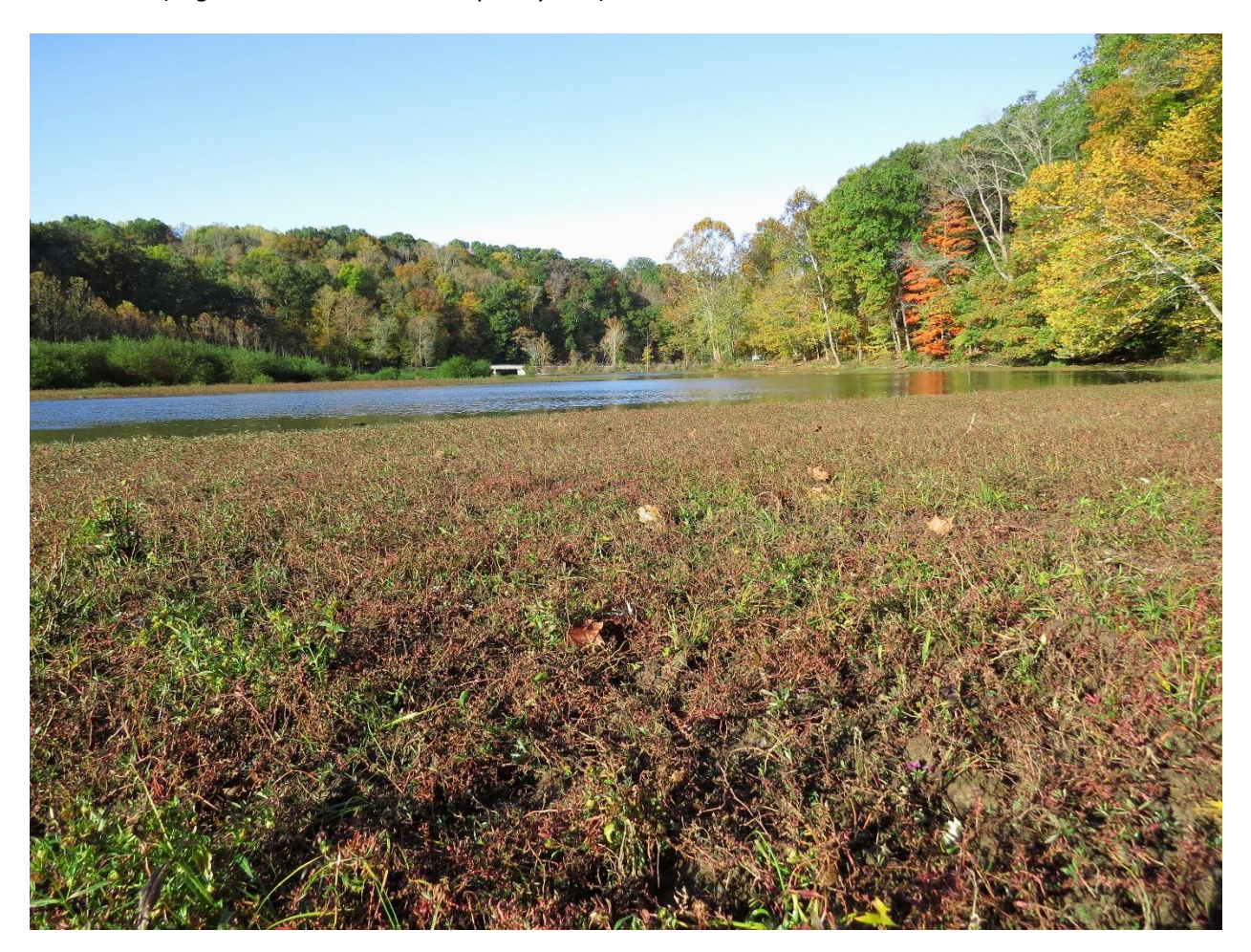
Figure 18: Seasonal Mudflats harbor a unique community of annual plants

This habitat appears in the middle of summer and often continues to expand until October as the reservoir levels recede due to declining stream inflow during the warm months. These mudflats provide important habitat for migratory shorebirds during the late summer and early fall. It also harbors a unique plant community of annual species that germinate as the water recedes and quickly mature and produce seeds. While some of the species also occur in other disturbed habitats such as agricultural fields, other species are mudflat specialists. Among the mudflat specialists are several species of nutsedges and flatsedges ( Cyperus spp. ), bur marigolds ( Bidens spp. ), Obe-Wan-Conobea ( Leucospora multifida ), false pimpernel ( Lindernia dubia ), slender fimbry ( Fimbristylis autumnalis ), and hooded arrowhead ( Sagittaria montevidensis ssp. calycina ).