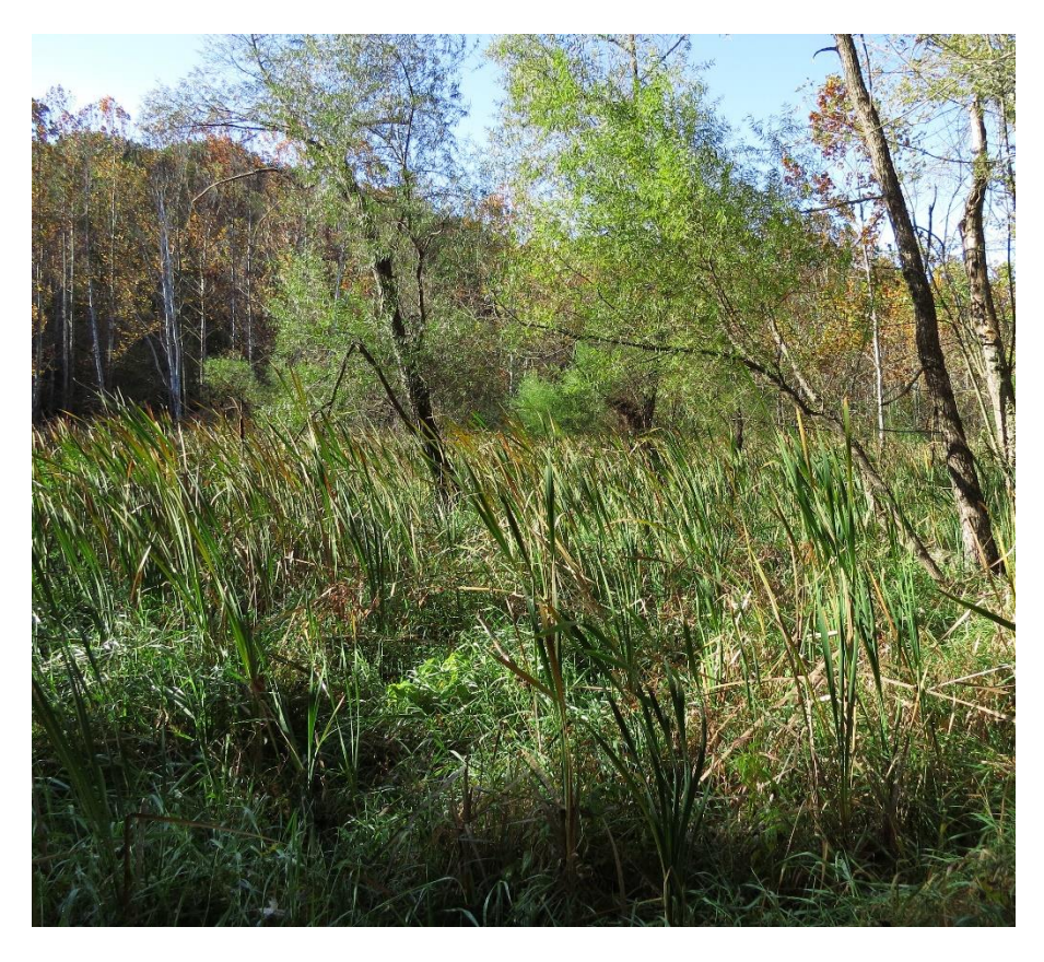
Figure 17: Hybrid cattails dominate the emergent wetlands

Another area of emergent wetlands occurs in an old field habitat below the dam west of Dunn Street. This area is also dominated by hybrid cattails. Other common herbaceous species include dark green bulrush ( Scirpus atrovirens ), lurid sedge, and swamp rose mallows ( Hibiscus moschuetos ).