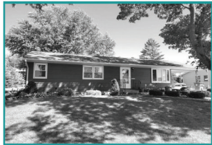
Reduced! Motivated! 613 7th Ave. NE, Oelwein $69,900