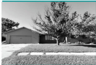
NEW PRICE! 820 Prestein Dr., Denver $265,900