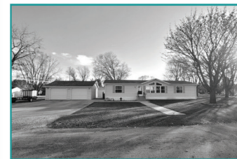
COMING SOON!! 400 Lincoln Dr., NE Oelwein 2 Stall, 2 sheds, fenced...

View All Listings At www.oelweinrealty.com