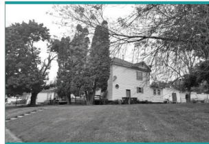
Motivated Seller! 719 S Frederick, Oelwein $64,900