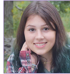
BELLA TATTOO APPRENTICE