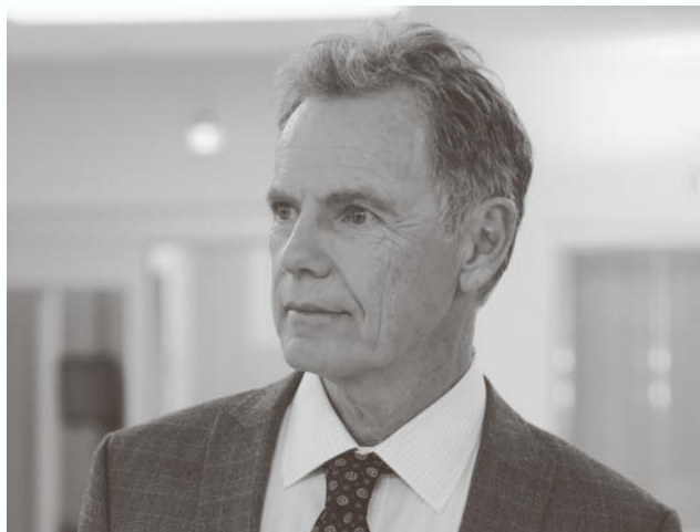
Bruce Greenwood in "The Resident"

When a newborn at Chastain needs an extremely difficult surgery, a distinguished pediatric surgeon is called in to perform in this new episode. Complications arise when Devon (Manish Dayal) realizes that she's in no state to operate.