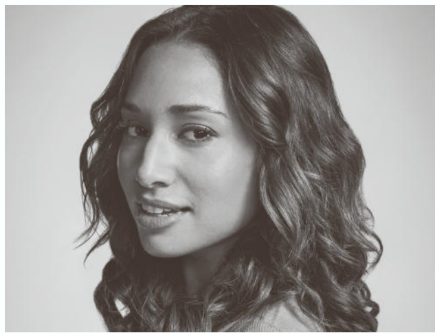
Meaghan Rath from "Hawaii Five-0"

Sara Gilbert, Sharon Osbourne, Sheryl Underwood, Eve, Carrie Ann Inaba and Marie Osmond host this daytime talk show, offering up opinions on the latest news through the eyes of mothers from different generations and backgrounds.