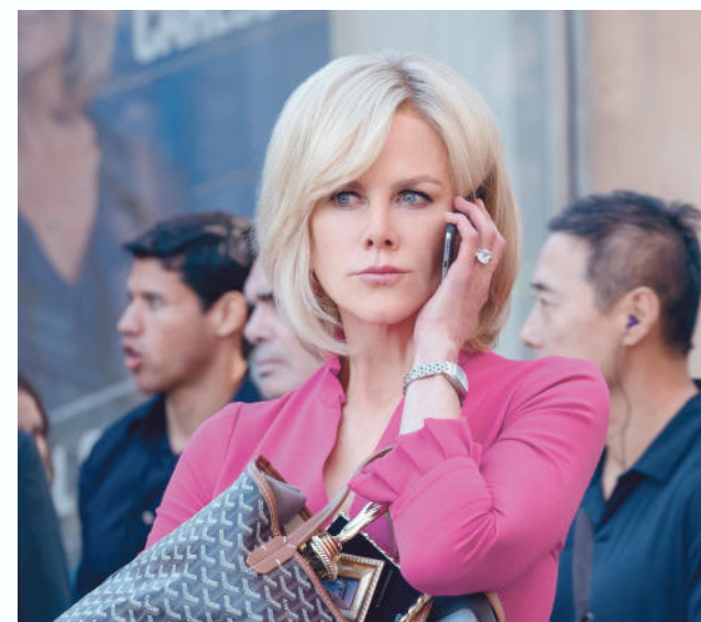
Nicole Kidman in "Bombshell"