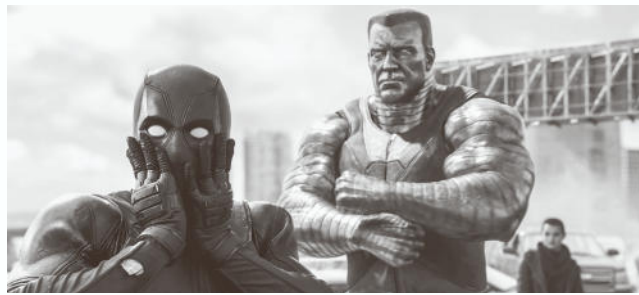
A scene from "Deadpool"