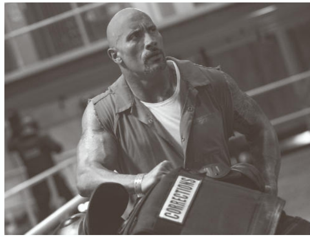
Dwayne Johnson in "The Fate of the Furious"

Meteorologist Ginger Zee explores the causes of unique weather events and natural disasters, discussing how to prepare for them in this family series. The show also shines light on those who brave natural disasters to save people in trouble.