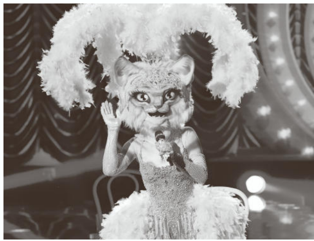
The Kitty from "The Masked Singer"

Nick Cannon hosts as disguised celebrities perform over-the-top song and dance numbers, while panelists Jenny McCarthy, Nicole Scherzinger, Ken Jeong and Rob-in Thicke attempt to guess who is hiding behind the mask based on clues given by the stars.