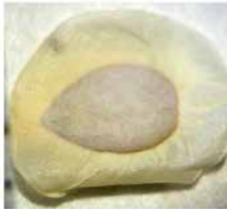
Mentzelia pterosperma seed