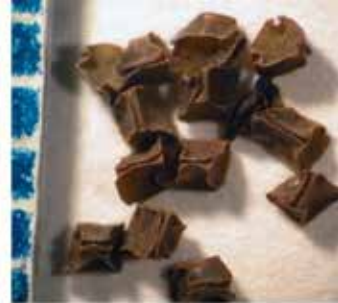
Mentzelia dispersa seeds