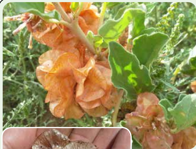
SAND-VERBENA (Smallflower Sandverbena) Tripterocalyx micranthus Family: Four O'Clock (Nyctaginaceae)

Greek koryphe and anthos refer to the location of the flower buds at the crown of the plant. Vivipara comes from Latin and means self-propagating by the production of plantlets. Coryphantha vivipara commonly ranges in the dry prairie montane grasslands and high deserts of the Great Plains from Canada to south of the Mexican border into the Chihuahuan Desert, up to elevations of 8,000 ft or more. This cold-hardy cactus can be successfully grown in a garden desertscape or trough and is available at nurseries. It is considered by some to be threatened.