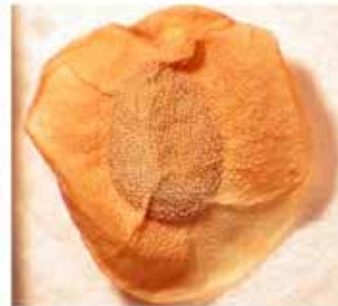
Mentzelia multiflora seed (rough in appearance)