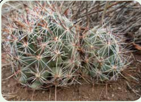
Nipple Cactus Coryphantha vivipara Family: Cactus (Cactaceae)

More often than not, this stout, fleshy inconspicuous plant will be totally overlooked by the casual observer. Its ball-shaped mound is covered with knobby projections called tubercles; each sport 12-16 spines 12 mm. in length (some bi-colored) emanating radially from a