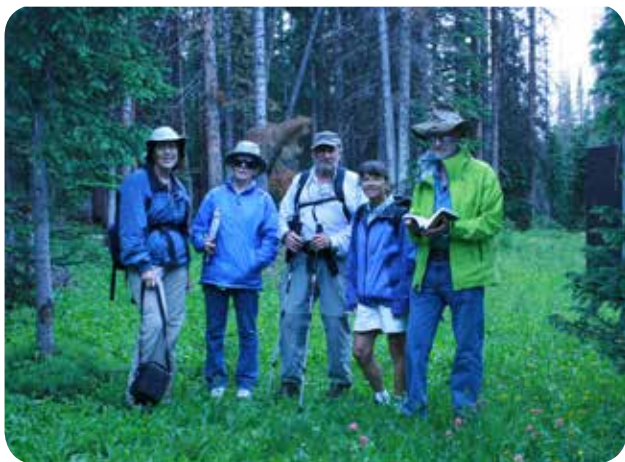
Zimmerman Lake Field Trip

The Northern Chapter is exploring new ground, so to speak: beginning with our initial fall meeting on Thursday, October 3, we will be alternating the meeting location between the Gardens on Spring Creek in Fort Collins (where we have been meeting for some time) and High Plains Environmental Center in Loveland (located in the Centerra development near I-25). So please make sure you check our monthly e-newsletter and/or the website before you come to make sure you are heading to the right location! We will continue to meet on the first Thursday of each month (with some exceptions depending on holidays and such). Please be sure to check the monthly chapter e-newsletter or the CoNPS website ( http://www.conps.org/Chapters/northern.shtml ) for updates and more detailed information before the event. If you would like to be added to the chapter's e-newsletter