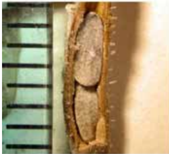
Mentzelia oligosperma seeds in capsule