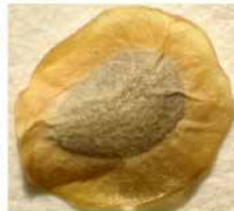
Mentzelia speciosa seed (smooth in appearance)