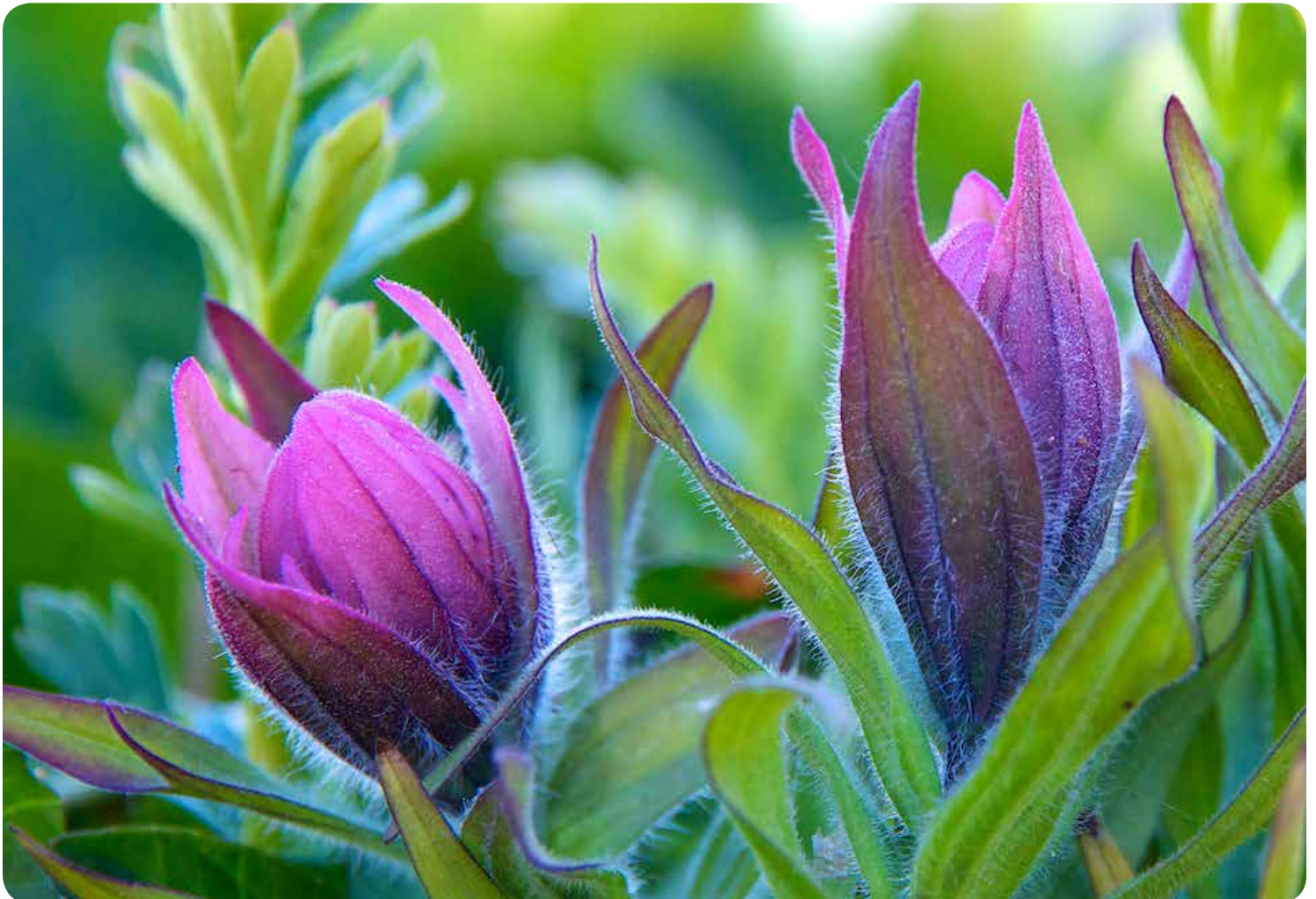
Cover photo: Aquilegia coerulea at Crested Butte, Colorado

See Back Cover for Landscape Category Winner