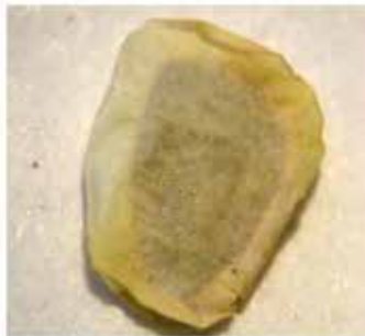
Mentzelia laevicaulis seed