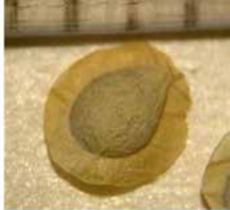
Mentzelia densa seed