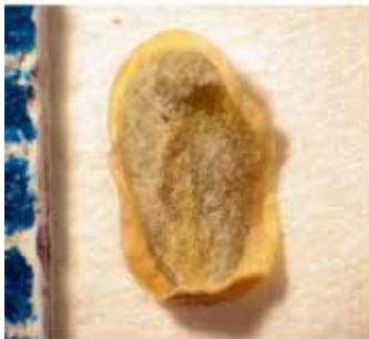
Mentzelia laciniata seed