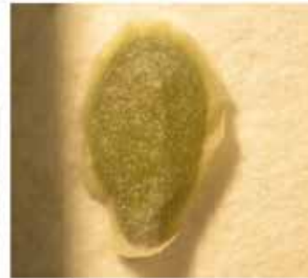
Mentzelia pumila seed