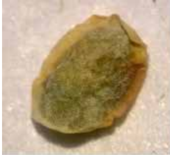
Mentzelia chrysantha seed