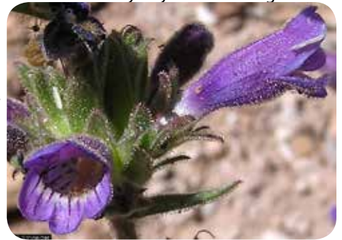
Penstemon breviculus

So we know that Penstemon breviculus lives within eight miles of the entrance to Mesa Verde National Park as do Populus angustifolia / Alnus incana woodlands. We know that Platanthera sparsiflora var. ensifolia ( Platanthera tescamnis ) lives somewhere up in the Thompson Divide as do Abies lasiocarpa / Rubus parviflorus ( Rubacer parviflorum ) forests, but we don't know exactly where they live. And even if we did, the Heritage program is unlikely to know all of the locations where these occurrences are found. It is no accident that so many rare plant and plant community locations are documented near roads and trails. There are lots of places in Colorado where we haven't even looked yet. That is why we need to protect large areas of contiguous ecosystems from any kind of development; and that's why we should step back and do some thoughtful planning about which areas should be left untouched for future generations to enjoy.