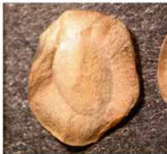
Mentzelia rusbyi seed