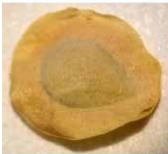
Mentzelia reverchonii seed