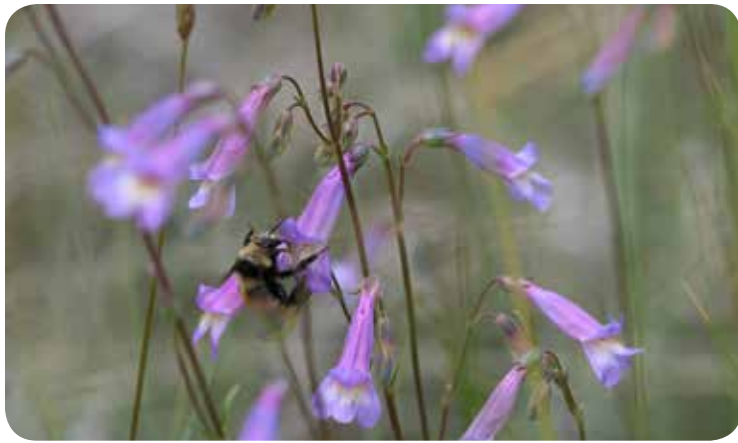
Penstemon griffinii

subtle characters that challenge even veteran botanists. Colorado boasts nearly one-quarter of the 238 North American species. Following an introduction to the morphology and taxonomy of the genus, we will explore the major sections and many of the species represented in Colorado. Samples of many species will be available for close examination by hand lens and dissecting scope. A basic knowledge of plant morphology and descriptive terminology is essential.