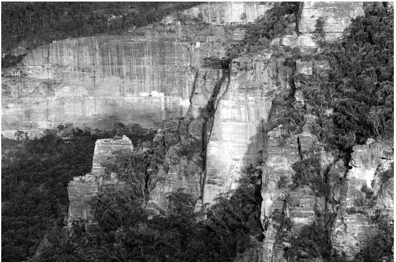
Fig. 2. Many eucalypt species grow in the dissected sandstone landscapes of the Blue Mountains and Wollemi areas where habitats range from moist sheltered gullies to exposed ridges and cliffines.

A further ten eucalypts have been recognised as rare on the list of Rare or Threatened Australian Plants (ROTAP, Briggs & Leigh 1996).). These eucalypts typically have a highly restricted or disjunct distribution, but are subject to a lower level of threat. A good example is Eucalyptus baeuerlenii , which has a very restricted distribution on cliff ledges at Wentworth Falls–Leura, but is within the GBMWA and is being managed for conservation.