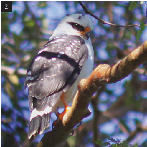
Figure 2. Black-faced Hawk Leucopternis melanops , 9 June 2010 (J. Montejo)