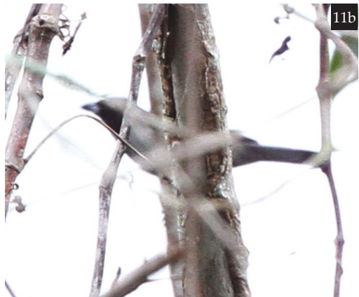
Figure 8. Bald Parrot Pyrilia aurantiocephala , 10 October 2006 (R. Hoyer)