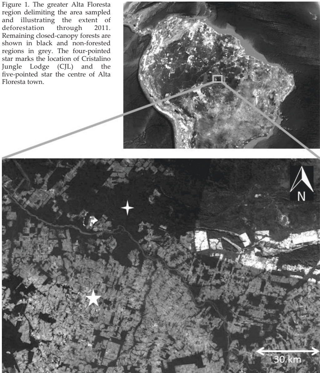
Figure 1. The greater Alta Floresta region delimiting the area sampled and illustrating the extent of deforestation through 2011. Remaining closed-canopy forests are shown in black and non-forested regions in grey. The four-pointed star marks the location of Cristalino Jungle Lodge (CJL) and the five-pointed star the centre of Alta Floresta town.

geographical context. To better partition the many species added to the list, we group accounts by habitat ( terra firme forest, transitional forest, wetlands and river edge, edge, and non-forest species) and by migratory status (austral, intra-tropical, and boreal migrants).