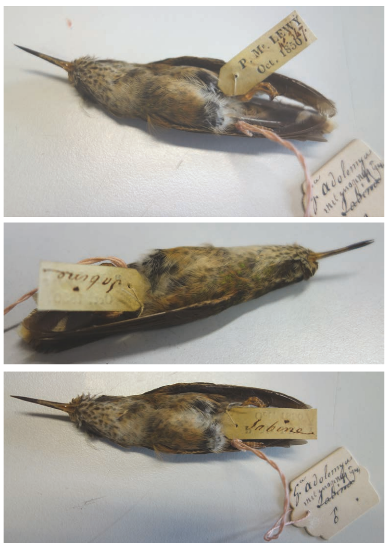
Figure 8. Possible Trochilus sabinae type (MNHN 347), Muséum National d'Histoire Naturelle, Paris (T. M. Donegan)

(vs. up to 40 marks for a Red-tailed Comet Sappho sparganurus or 160 marks for the most expensive bird-of-paradise). To compound matters, Bourcier sometimes specified 'type' on specimens that were representative of the species but not actual types (Greenway 1978: 5).