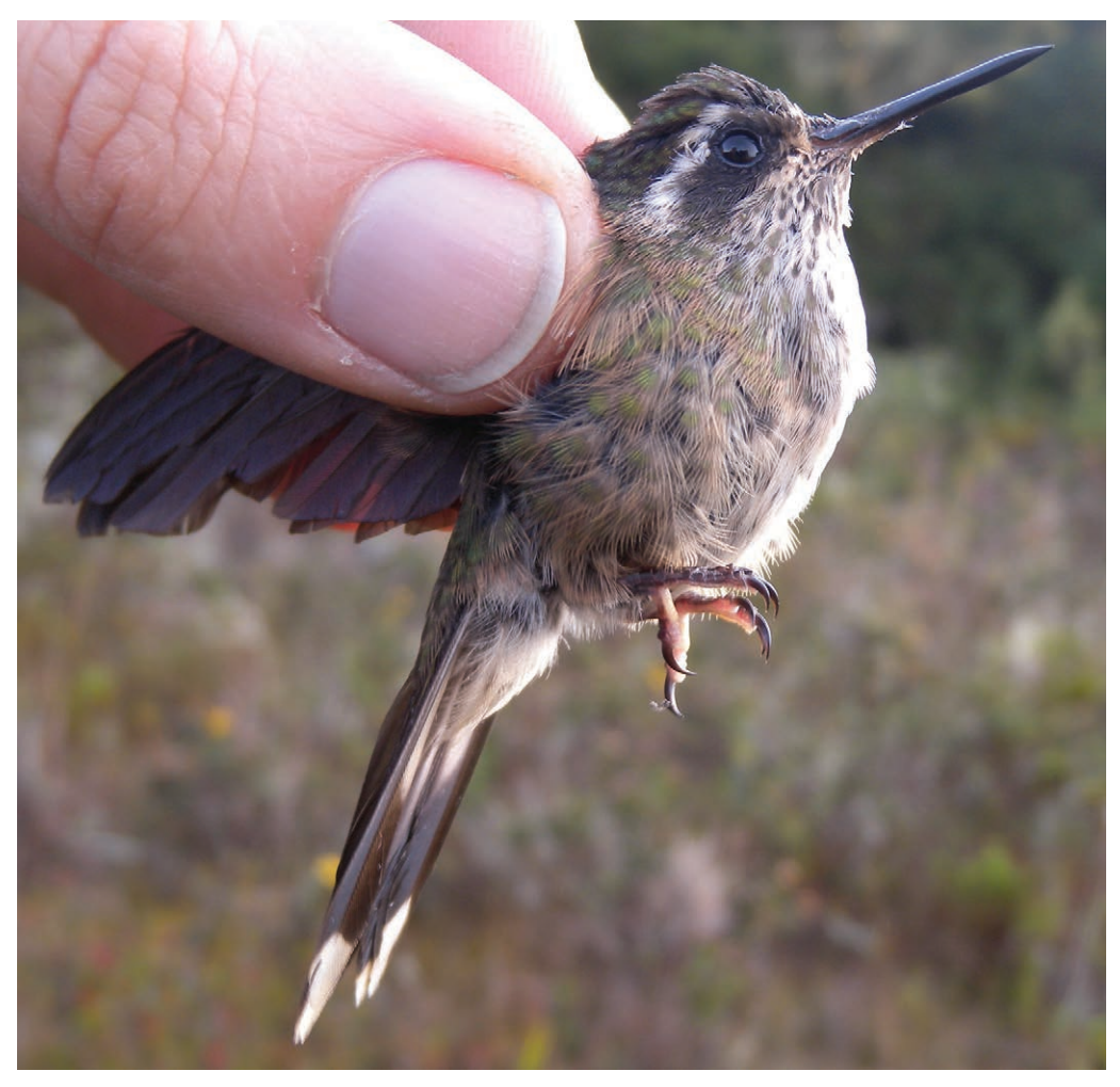
Figure 6. An individual of the Santander–Boyacá population of Speckled Hummingbird A. melanogenys . Páramo La Floresta, Serranía de los Yariguíes, Zapatoca, dpto. Santander, January 2011