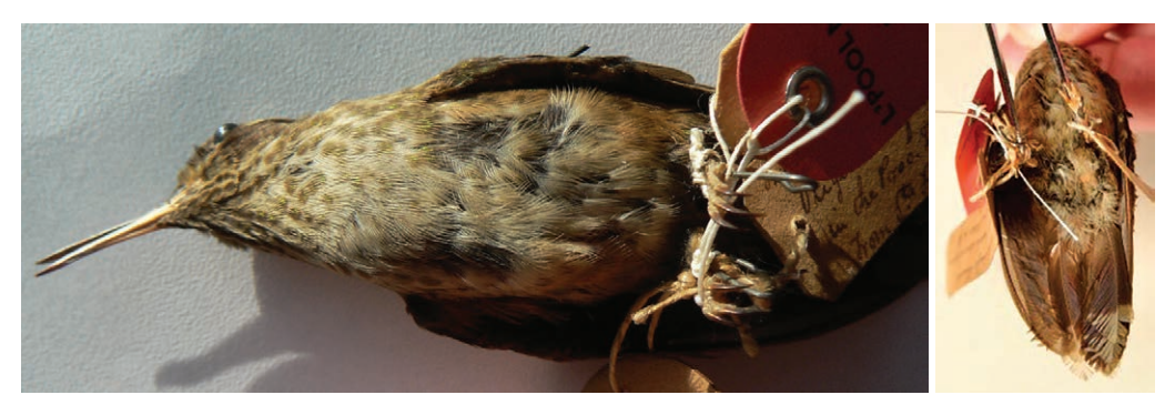
Figure 7. Type of Trochilus melanogenys (Liverpool museum D1098), showing the pale central vent typical of Cundinamarca birds

Figure 6. An individual of the Santander–Boyacá population of Speckled Hummingbird A. melanogenys . Páramo La Floresta, Serranía de los Yariguíes, Zapatoca, dpto. Santander, January 2011