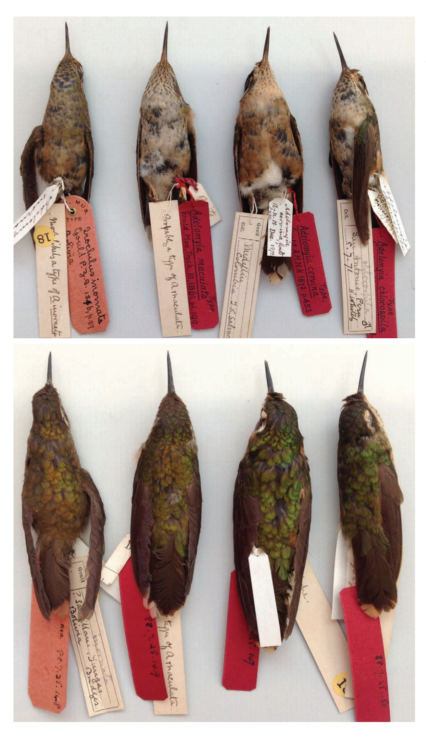
Figure 11. Other type specimens of names in genus Adelomyia, left to right: (i) inornata; (ii) maculata; (iii) cervina; and (iv) chlorospila, all at Natural History Museum, Tring (T. M. Donegan)

Trochilus rosae Bourcier & Mulsant, 1846 ( =Chaetocercus jourdanii rosae ) and Trochilus franciae Bourcier & Mulsant, 1846 ( =Amazilia franciae ). Most are written in a calligraphic style that was relatively widespread in the mid 1800s. The original labels of AMNH types are more ornate and written in three different colours for each of the species name, the word 'type'