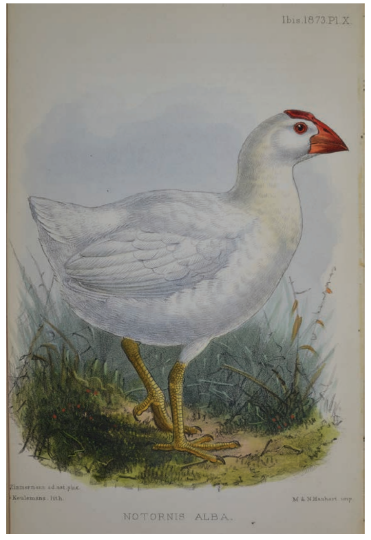
Figure 10. Illustration of a Takahe-like Lord Howe Gallinule Notornis alba in Salvin (1873) by J. G. Keulemans, based on a sketch provided by Pelzeln of the Vienna specimen (Hein van Grouw, Natural History Museum, Tring)

Gallinule (F)ulica) alba); New Zealand, rare; brought by Sir J. Banks'. The specimen was purchased by Lord Stanley and, along with his Knowsley collection, bequeathed to the people of Liverpool and finally donated to the free public museums of Liverpool by the 13th Lord Derby around 1850 (Rowley 1875, Forbes 1901).