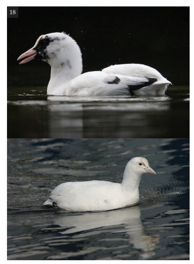
Figure 18. Two Common Coots Fulica atra showing different stages of progressive greying; top: Tolkamer, the Netherlands, 29 June 2006 (© Harvey van Diek), below (in final stage of progressive Greying): Capelle aan den IJssel, the Netherlands, 28 March 2004 (© Chris van Rijswijk)

Figure 19. Pl. 31 in Buller (1888); full image (left) and inset (right) of New Zealand Swamphen P. p. melanotus with progressive greying based on a specimen in Buller's collection (Hein van Grouw, Natural History Museum, Tring)