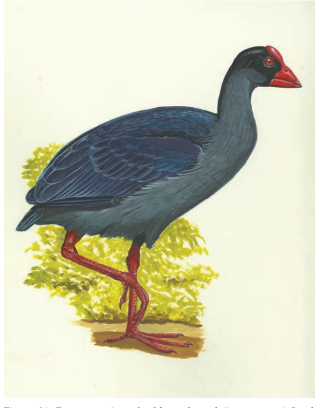
Figure 21. Reconstruction of a blue-coloured (i.e. younger) Lord Howe Gallinule Porphyrio albus , before it becomes white (Julian P. Hume)