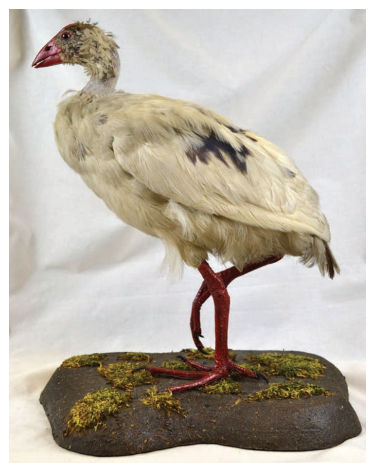
Figure 11. Liverpool specimen of Porphyrio albus (WML D3213), probably collected March or May 1788 on Lord Howe Island, and the type of Porphyrio stanleyi Rowley, 1875, which was probably re-prepared (modelled) after Keuleman's illustration (see Fig. 9) (Hein van Grouw)

with Pelzeln (1860) that Lord Howe Gallinule was more similar to New Zealand Takahe Notornis mantelli and therefore should be placed in Notornis , as shown in the accompanying illustration by J. G. Keulemans (Fig. 10). However, Salvin apparently never saw the Vienna specimen and based his attribution purely on a drawing of it provided to him by Pelzeln, stating: 'I therefore (depending, of course, upon the accuracy of the drawing sent me, which has been placed on stone by Mr. Keulemans on a slightly larger scale than the original sketch) have little hesitation in adding this species to the genus Notornis , thereby confirming the position pointed out for it by Herr von Pelzeln...'. Salvin's caution seems justified as, in our opinion, Pelzeln must have been biased towards Takahe when he provided the sketch.