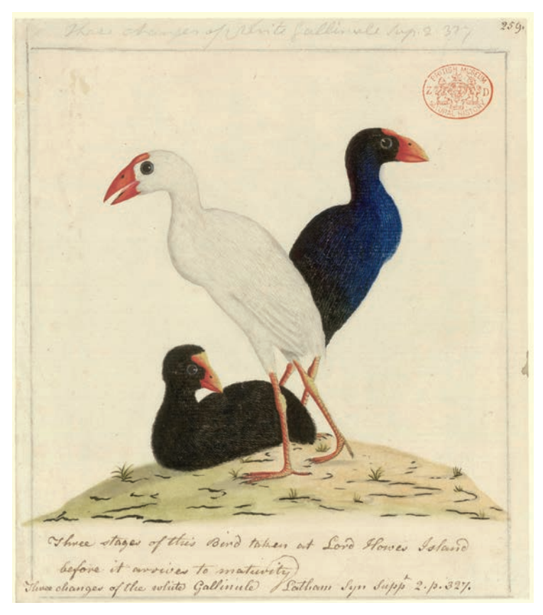
Figure 8. Illustration by an anonymous artist of three Lord Howe Gallinules Porphyrio albus from Thomas Watling's collection, N H M U K - L - W a tling - 330-M-1; the handwritten note reads 'Three stages of this Bird, taken at Lord Howes Island, before it arrives at maturity (Natural History Museum, London)

gallinule (cf. Iredale 1910, Hindwood 1932). Despite this lack of first-hand evidence, several commentators confused the provenance, even leading to the description of supposed Norfolk Island birds as a second species of white gallinule.