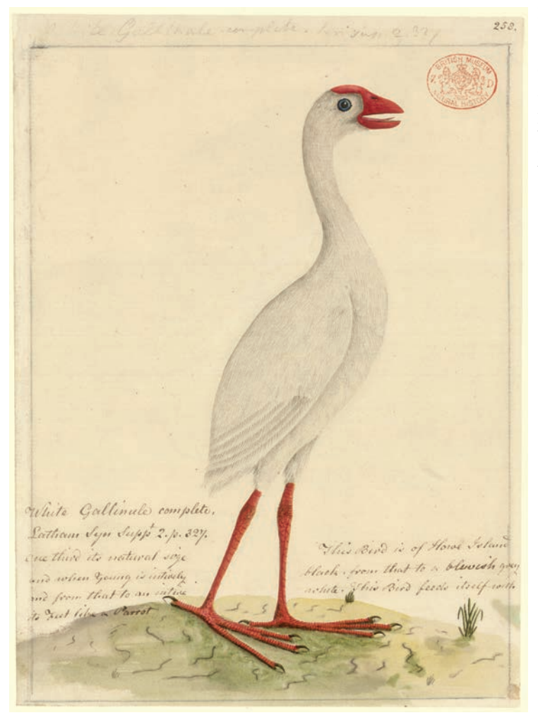
Figure 7. Illustration by an anonymous artist of a Lord Howe Gallinule Porphyrio albus from Thomas Watling's collection, NHMUK-L-Watling-329-M-1; the handwritten notes read 'This bird is of Lord Howe and when young is intirely [ sic ] black, from that to a bluish grey and from that to an intire [ sic ] white. The bird feeds itself with its feet like a parrot' (Natural History Museum, London)

He made an ornithological report, the first survey of the avifauna of Lord Howe Island for 63 years, but did not mention the gallinule (Foulis 1853, Hindwood 1940). No doubt a poorly volant, chicken-sized gallinule quickly fell prey to whalers and sealers, and disappeared extremely rapidly, possibly even by the end of the 18th century. And, although Bassett-Hull (1909) hoped for its rediscovery, the confirmed existence of the Lord Howe Gallinule spanned just two years.