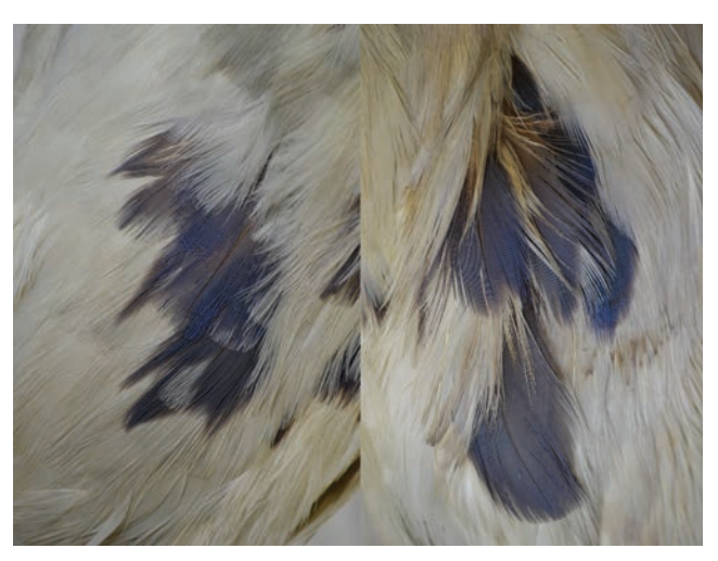
Figure 20. 'Shoulders' (left and right side) of Liverpool specimen of Lord Howe Gallinule Porphyrio albus (WML D3213) showing a few remnant purple-blue feathers, a colour not found in the shoulder/ upperparts plumage of any subspecies of Purple Swamphen P. porphyrio

The most striking difference between P. albus and other Porphyrio , except P. p. melanotus , is the short middle toe, which is especially reduced in the Liverpool specimen. In all other P. porphyrio subspecies, the middle toe is the same length or even slightly longer than the tarsus, but in P. p. melanotus , however, the middle toe is shorter than the tarsus, just as in P. albus . The tail of the Vienna