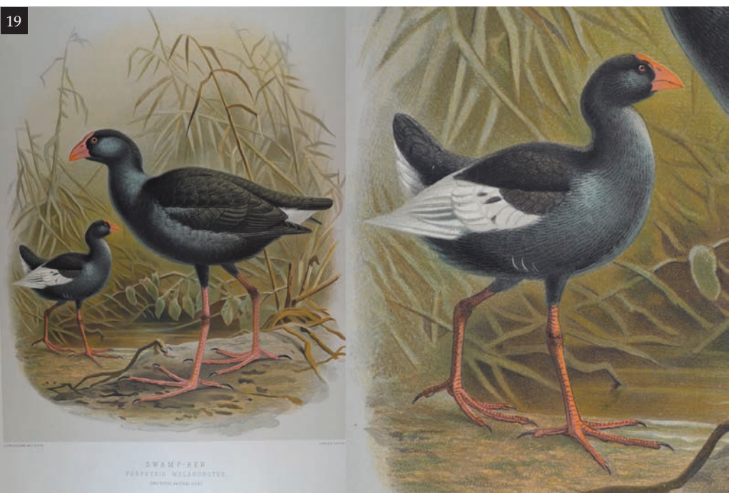
Figure 19. Pl. 31 in Buller (1888); full image (left) and inset (right) of New Zealand Swamphen P. p. melanotus with progressive greying based on a specimen in Buller's collection (Hein van Grouw, Natural History Museum, Tring)

Figure 18. Two Common Coots Fulica atra showing different stages of progressive greying; top: Tolkamer, the Netherlands, 29 June 2006, below (in final stage of progressive Greying): Capelle aan den IJssel, the Netherlands, 28 March 2004