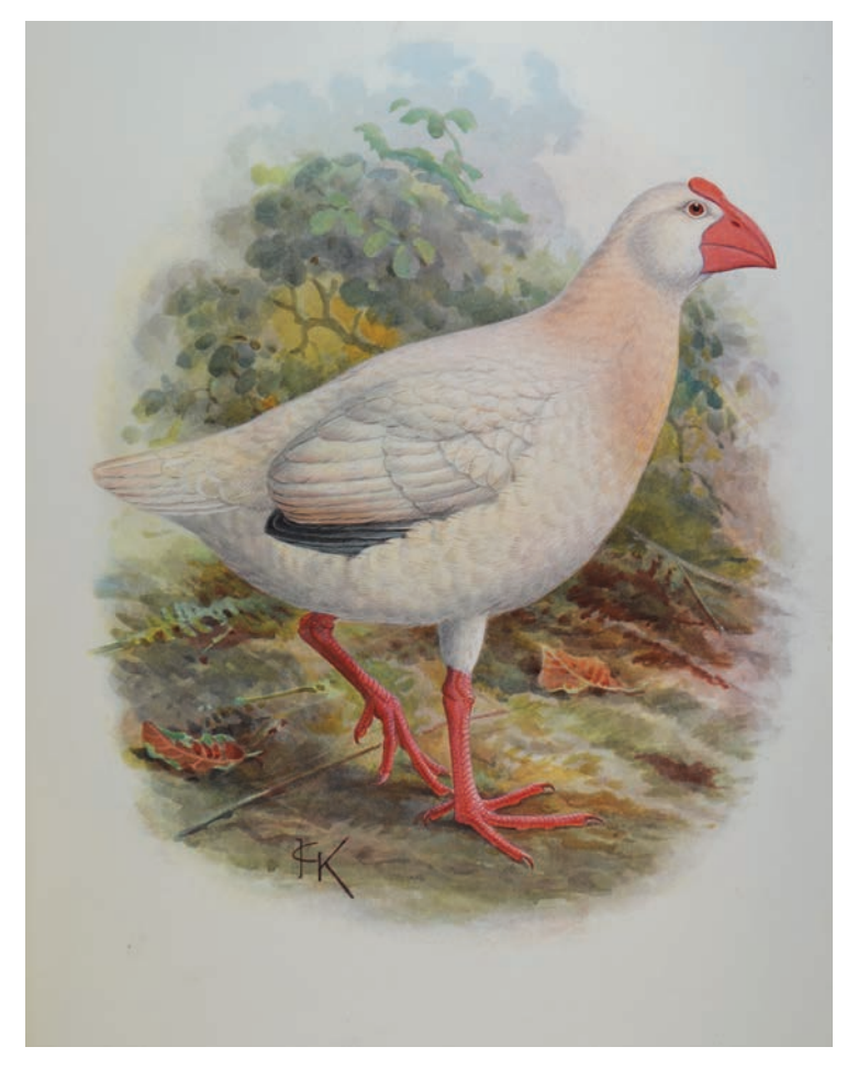
Figure 13. Illustration of a Takahe-like Lord Howe Gallinule Notornis alba in Rothschild (1907) by J. G. Keulemans, based on how Rothschild thought the species would have appeared in life; although it is based on the Vienna specimen, artistic license permitted Rothschild / Keulemans to erroneously picture the bird with coloured primaries (Hein van Grouw, Natural History Museum, Tring)

raperi in recognition of the artist. His grounds were extremely dubious to say the least and, subsequently, when Mathews (1936) had reproduced the Raper painting (Fig. 14) and compared it to the Vienna skin, he admitted his error and synonymised P. raperi under P. albus .