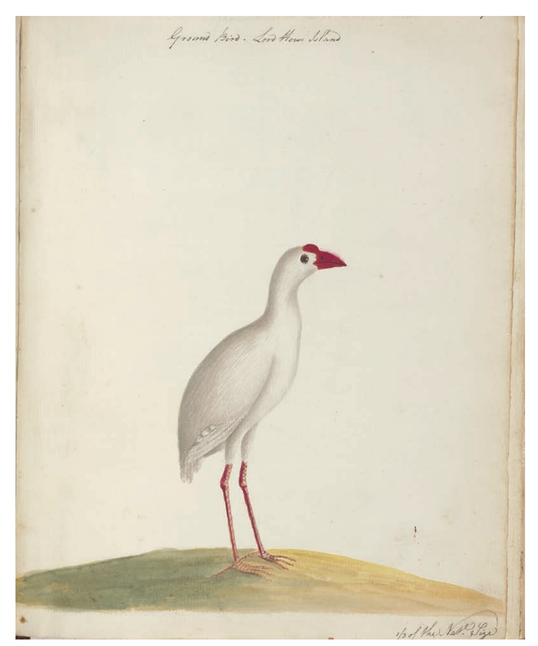
Figure 3. Ground Bird of Lord Howe Island; a Lord Howe Gallinule Porphyrio albus depicted by John Hunter (1788–90) (National Library of Australia, Canberra)