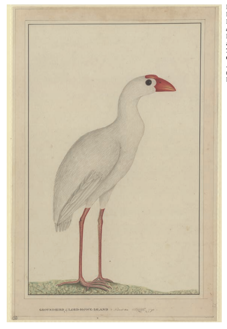
Figure 4. Ground Bird of Lord Howe Island; a Lord Howe Gallinule Porphyrio albus depicted by George Raper (1790), presumably after a live bird; drawing No. 71, George Raper Drawings Collection, Library and Archives, NHMUK London (Natural History Museum, London)

[sailors] also found on it, in great plenty, a kind of fowl, resembling much of the Guinea fowl in shape and size, but widely different in colour; they being in general all white, with a red fleshy substance rising, like a cock's comb, from the head, and not unlike a piece of sealing-wax. These not being birds of flight, nor in the least wild, the sailors availing themselves of their gentleness and inability to take wing from their pursuits, easily struck them down with sticks'.