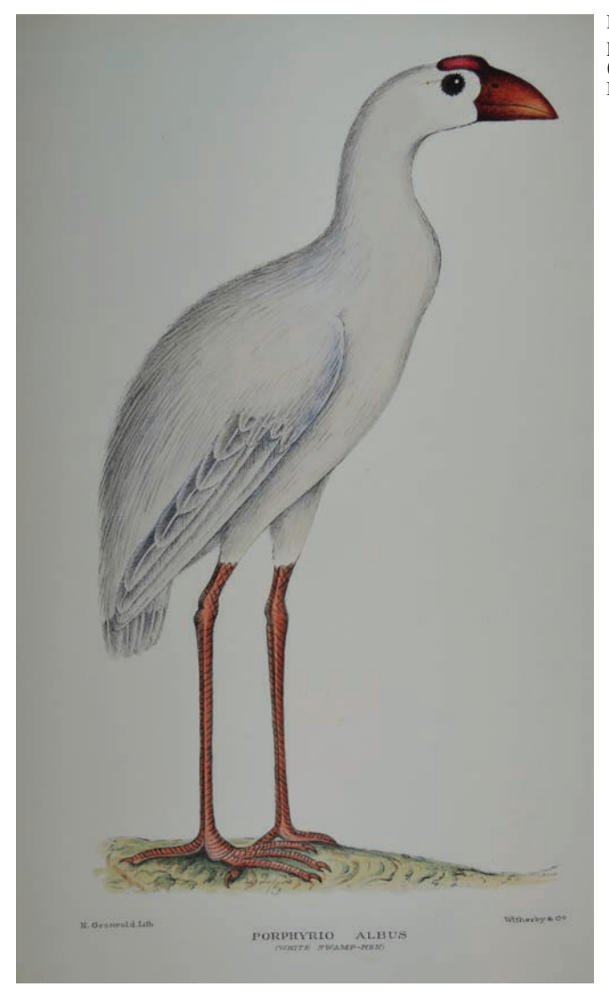
Figure 14. Reconstruction of Raper's painting 1790 in Mathews (1936) (Hein van Grouw, Natural History Museum, Tring)

since 1987 (Ripley 1977, Hutton 1990). Also on Norfolk Island, the species is probably self-introduced and has been recorded since the earliest European occupation (Christian 2005). In early 1900 it was not uncommon and recorded as breeding (Bassett-Hull 1909), but since the 1990s the number of breeding birds has increased dramatically (Christian 2005).