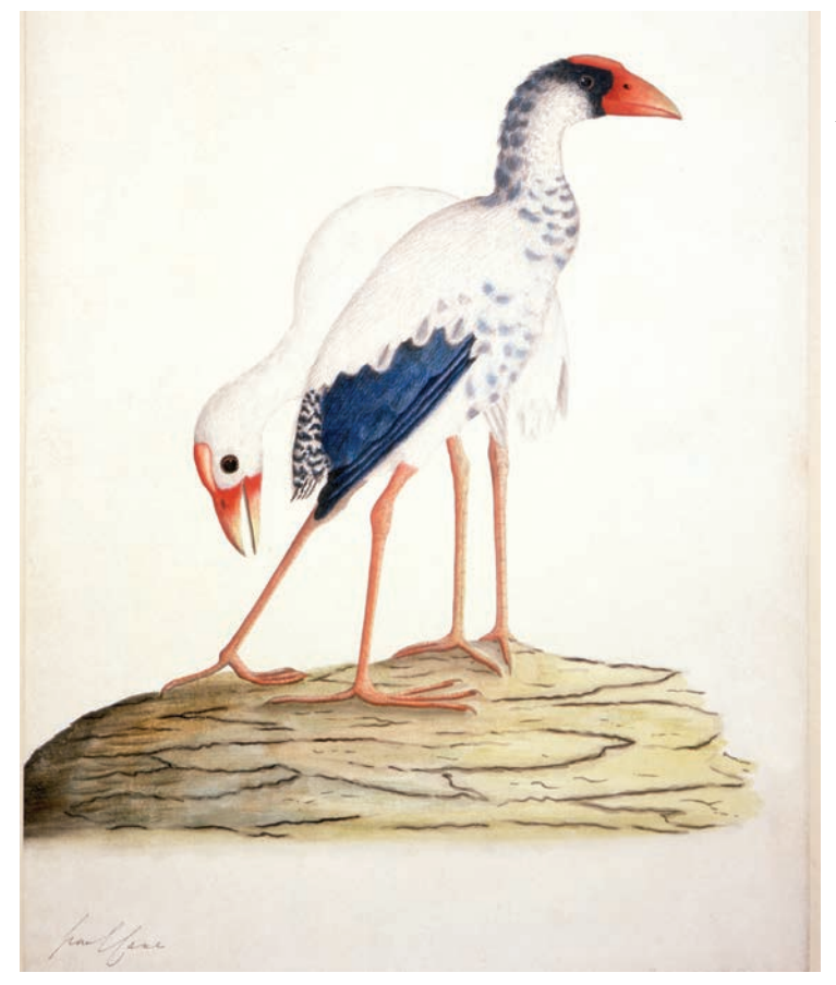
Figure 5. Illustration of two Lord Howe Gallinules Porphyrio albus , one all white and one still variegated, by George Raper (1790); this painting is particularly important as it clearly shows two stages of the colour aberration progressive greying (Alexander Turnbull Library, Wellington)

are furnished with a small crooked spine. In the dried specimen the legs and feet are yellow; but, perhaps, in the living bird might have been of the same colour with the beak.'