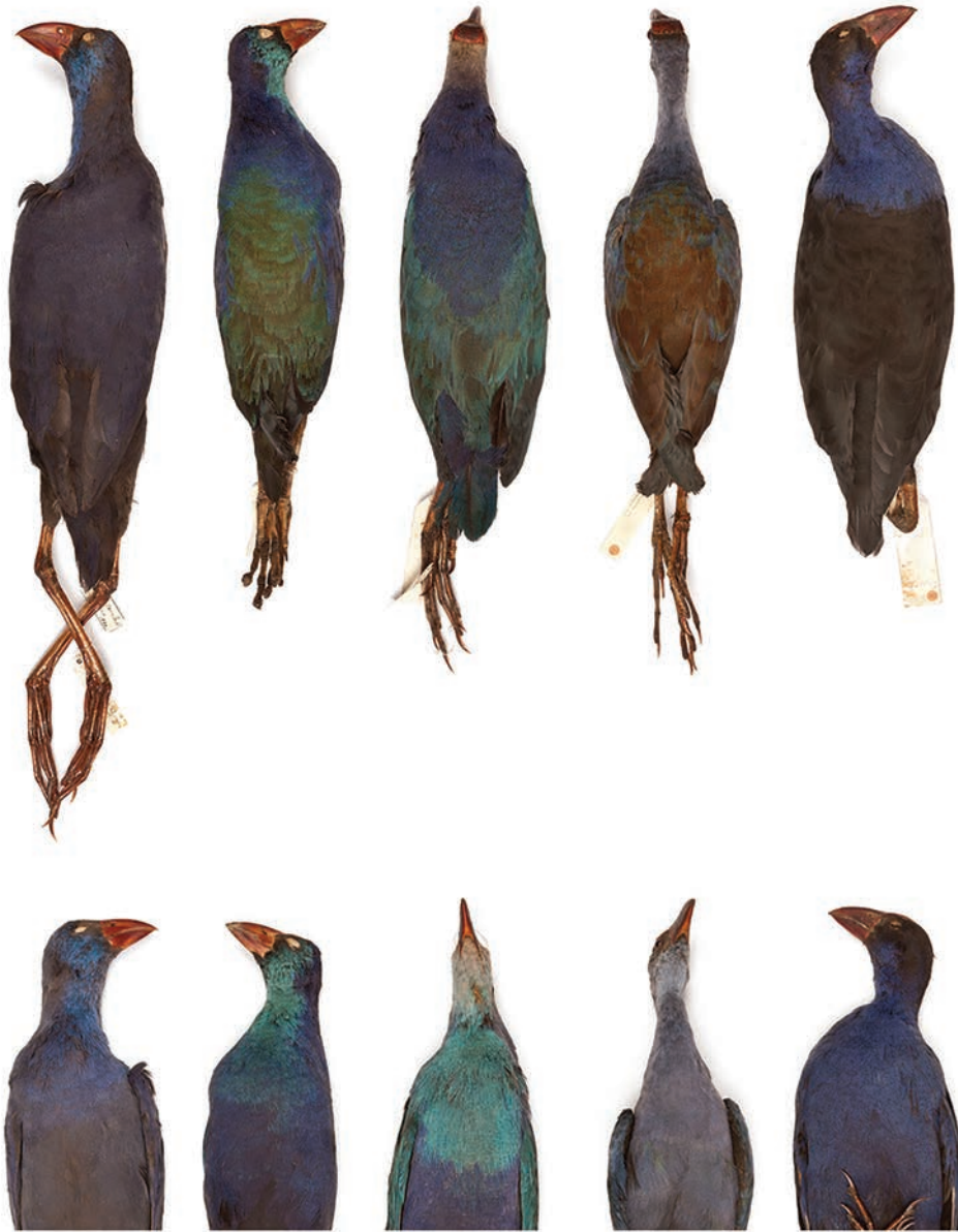
Figure 22. Coloration of different subspecies of Purple Swamphen Porphyrio porphyrio, dorsal (above), ventral (below), from left to right: P. p. porphyrio (NHMUK 1905.6.28.1010), P. p. madagascariensis (NHMUK 1955.6.N.17.38), P. p. poliocephalus (NHMUK 1881.12.29.31), P. p. pulverulentus (NHMUK 1842.2.15.140) and P. p. melanotus (NHMUK 1887.5.2.66)