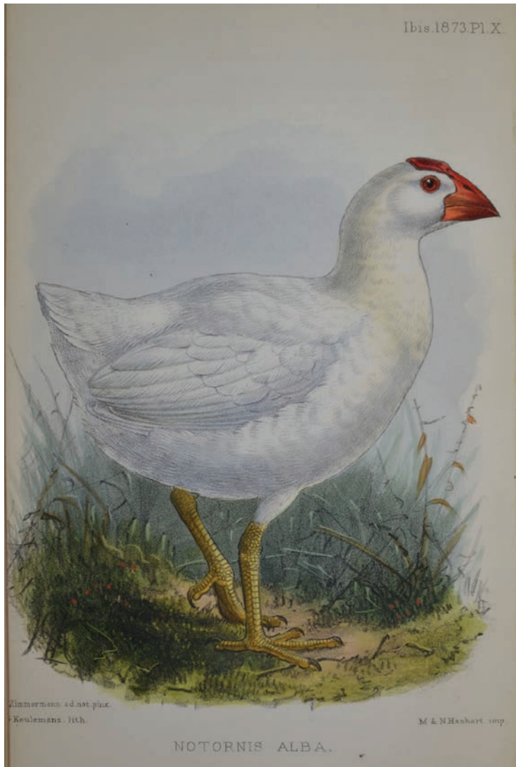
Figure 10. Illustration of a Takahe-like Lord Howe Gallinule Notornis alba in Salvin (1873) by J. G. Keulemans, based on a sketch provided by Pelzeln of the Vienna specimen (Hein van Grouw, Natural History Museum, Tring)

Gallinule ( Fulica ) alba ); New Zealand, rare; brought by Sir J. Banks'. The specimen was purchased by Lord Stanley and, along with his Knowsley collection, bequeathed to the people of Liverpool and finally donated to the free public museums of Liverpool by the 13th Lord Derby around 1850 (Rowley 1875, Forbes 1901).