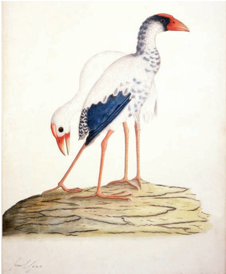
Figure 5. Illustration of two Lord Howe Gallinules Porphyrio albus , one all white and one still variegated, by George Raper (1790); this painting is particularly important as it clearly shows two stages of the colour aberration progressive greying

are furnished with a small crooked spine. In the dried specimen the legs and feet are yellow; but, perhaps, in the living bird might have been of the same colour with the beak.'