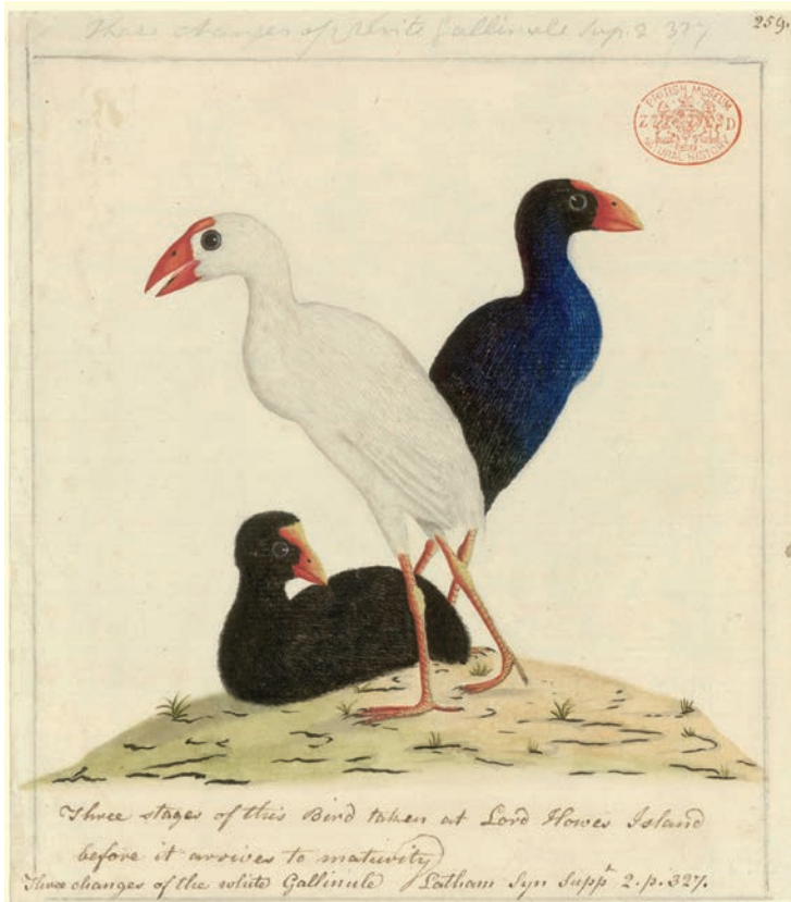
Figure 8. Illustration by an anonymous artist of three Lord Howe Gallinules Porphyrio albus from Thomas Watling's collection, NHMUK-L-Watling-330-M-1; the handwritten note reads 'Three stages of this Bird, taken at Lord Howes Island, before it arrives at maturity (Natural History Museum, London)

gallinule (cf. Iredale 1910, Hindwood 1932). Despite this lack of first-hand evidence, several commentators confused the provenance, even leading to the description of supposed Norfolk Island birds as a second species of white gallinule.