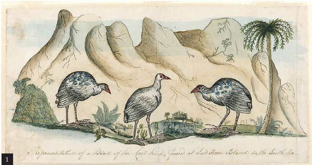
Figure 1. Watercolour of three Lord Howe Gallinules Porphyrio albus by Arthur Bowes Smythe, c.1788, based on live birds that Bowes Smith observed during his visit to Lord Howe Island in May 1788. The handwritten note reads 'Representation of a Bird of the Coot kind, found at Lord Howe Island, in the South Sea' (National Library of Australia, Canberra)