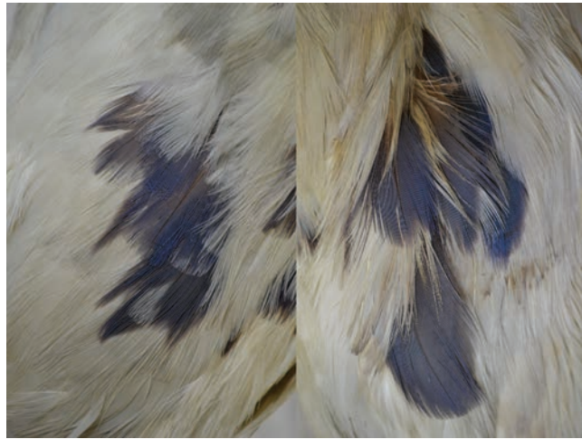
Figure 20. 'Shoulders' (left and right side) of Liverpool specimen of Lord Howe Gallinule Porphyrio albus (WML D3213) showing a few remnant purple-blue feathers, a colour not found in the shoulder/upperparts plumage of any subspecies of Purple Swamphen P. porphyrio

The most striking difference between P. albus and other Porphyrio , except P. p. melanotus , is the short middle toe, which is especially reduced in the Liverpool specimen. In all other P. porphyrio subspecies, the middle toe is the same length or even slightly longer than the tarsus, but in P. p. melanotus , however, the middle toe is shorter than the tarsus, just as in P. albus . The tail of the Vienna