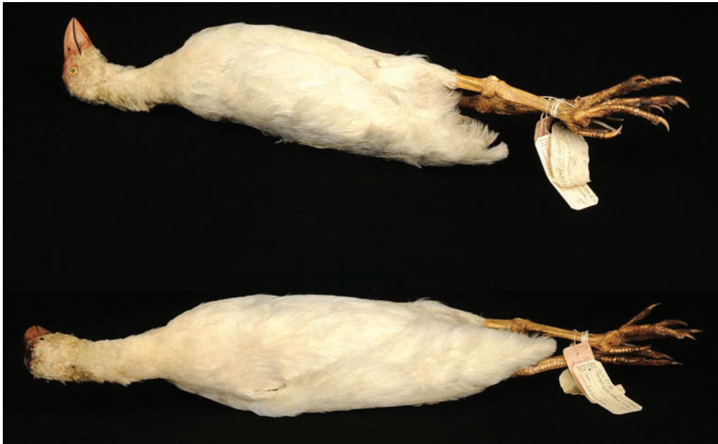
Figure 12. Lateral (top) and dorsal views of the specimen at the Naturhistorisches Museum Wien (NMW 50761), probably collected March 1788 on Lord Howe Island, the type specimen of Porphyrio alba (White, 1790)

by Keulemans, is identical in pose to the Liverpool mount. So either Forbes was in error, or the specimen has been remade (again) since Forbes, based on the plate in Rowley. Sarah Stone's illustration of the Vienna bird was probably derived from the original pose of the mounted specimen, rather than the specimen being modelled on her painting; the skin is now demounted with legs outstretched (Fig. 12).