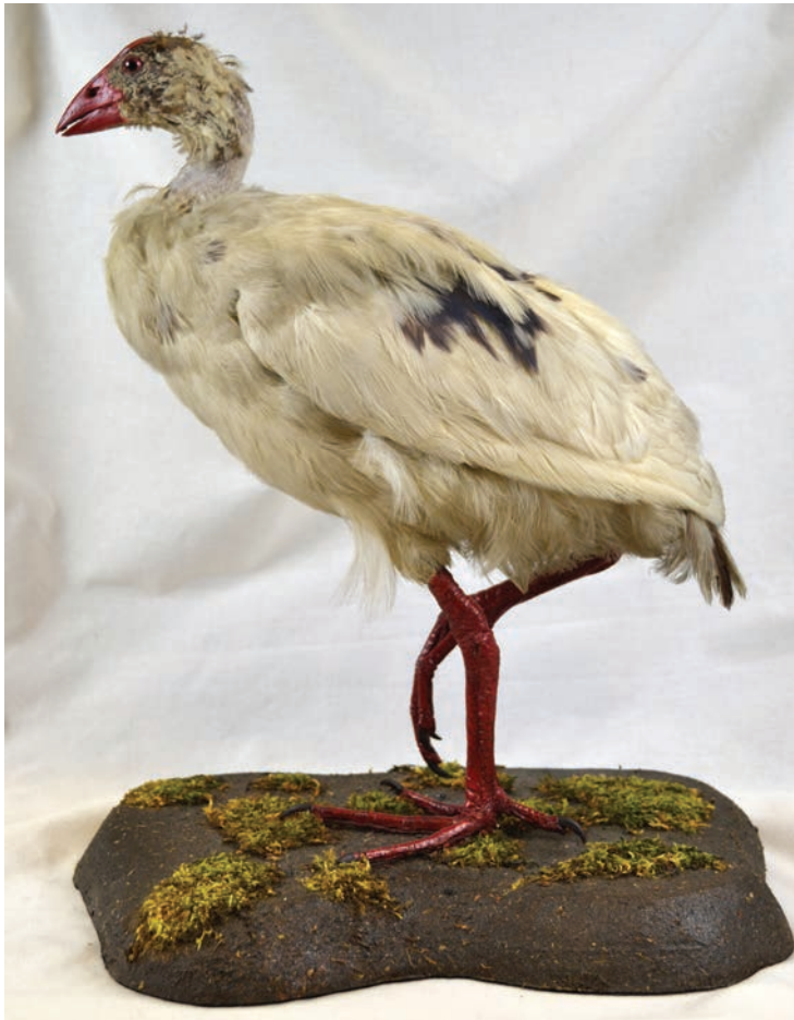
Figure 11. Liverpool specimen of Porphyrio albus (WML D3213), probably collected March or May 1788 on Lord Howe Island, and the type of Porphyrio stanleyi Rowley, 1875, which was probably re-prepared (modelled) after Keuleman's illustration (see Fig. 9) (Hein van Grouw)

with Pelzeln (1860) that Lord Howe Gallinule was more similar to New Zealand Takahe Notornis mantelli and therefore should be placed in Notornis , as shown in the accompanying illustration by J. G. Keulemans (Fig. 10). However, Salvin apparently never saw the Vienna specimen and based his attribution purely on a drawing of it provided to him by Pelzeln, stating: 'I therefore (depending, of course, upon the accuracy of the drawing sent me, which has been placed on stone by Mr. Keulemans on a slightly larger scale than the original sketch) have little hesitation in adding this species to the genus Notornis , thereby confirming the position pointed out for it by Herr von Pelzeln...'. Salvin's caution seems justified as, in our opinion, Pelzeln must have been biased towards Takahe when he provided the sketch.