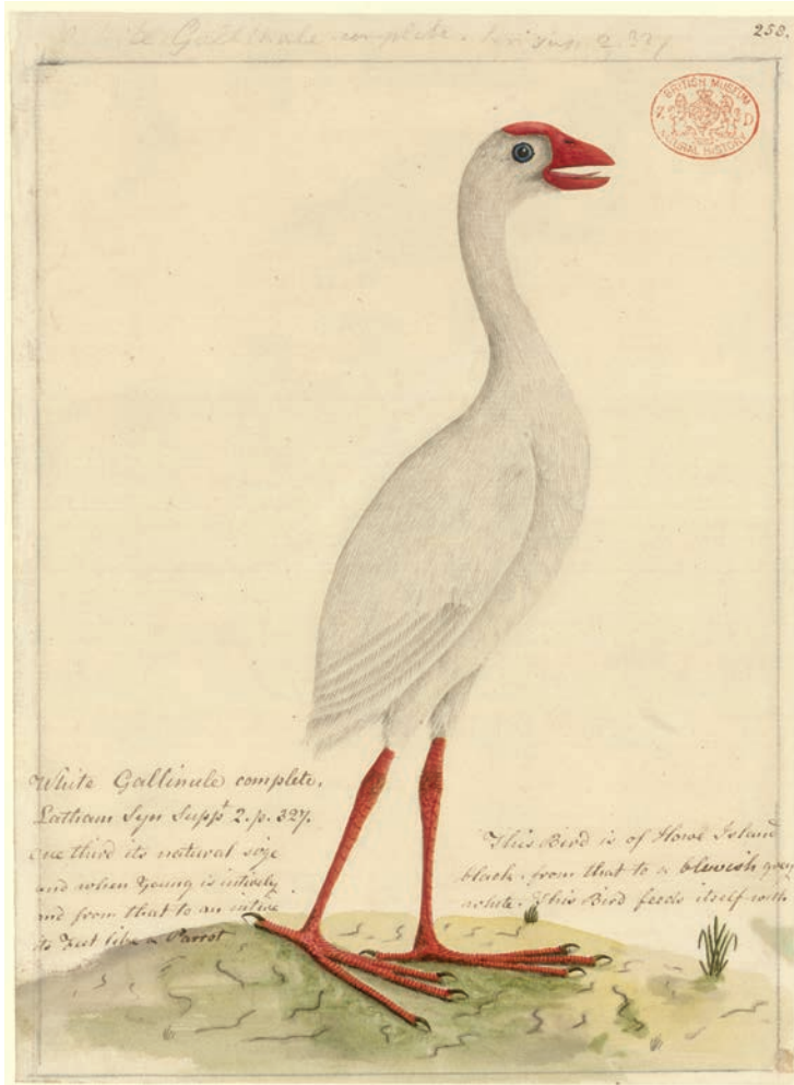
Figure 7. Illustration by an anonymous artist of a Lord Howe Gallinule Porphyrio albus from Thomas Watling's collection, NHMUK-L-Watling-329-M-1; the handwritten notes read 'This bird is of Lord Howe and when young is intirely [sic] black, from that to a bluish grey and from that to an intire [sic] white. The bird feeds itself with its feet like a parrot' (Natural History Museum, London)

He made an ornithological report, the first survey of the avifauna of Lord Howe Island for 63 years, but did not mention the gallinule (Foulis 1853, Hindwood 1940). No doubt a poorly volant, chicken-sized gallinule quickly fell prey to whalers and sealers, and disappeared extremely rapidly, possibly even by the end of the 18th century. And, although Bassett-Hull (1909) hoped for its rediscovery, the confirmed existence of the Lord Howe Gallinule spanned just two years.