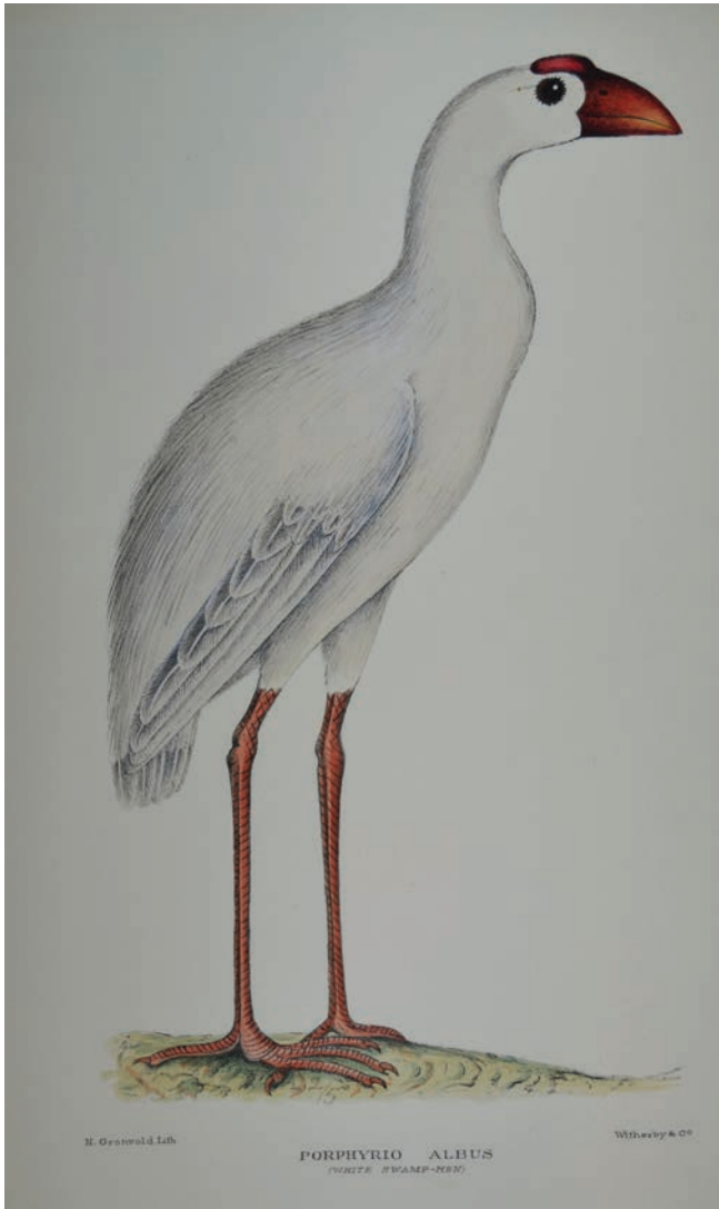
Figure 14. Reconstruction of Raper's painting 1790 in Mathews (1936) (Hein van Grouw, Natural History Museum, Tring)

since 1987 (Ripley 1977, Hutton 1990). Also on Norfolk Island, the species is probably self-introduced and has been recorded since the earliest European occupation (Christian 2005). In early 1900 it was not uncommon and recorded as breeding (Bassett-Hull 1909), but since the 1990s the number of breeding birds has increased dramatically (Christian 2005).