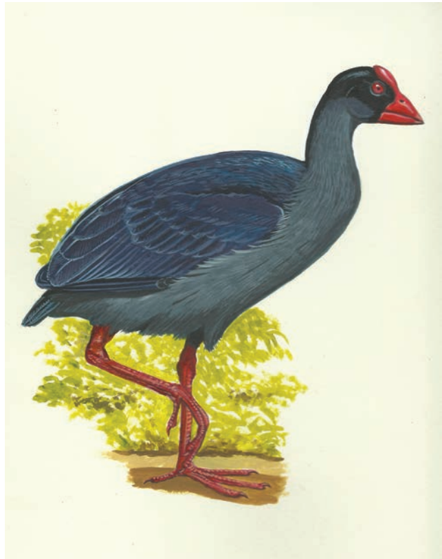
Figure 21. Reconstruction of a blue-coloured (i.e. younger) Lord Howe Gallinule Porphyrio albus , before it becomes white (Julian P. Hume)