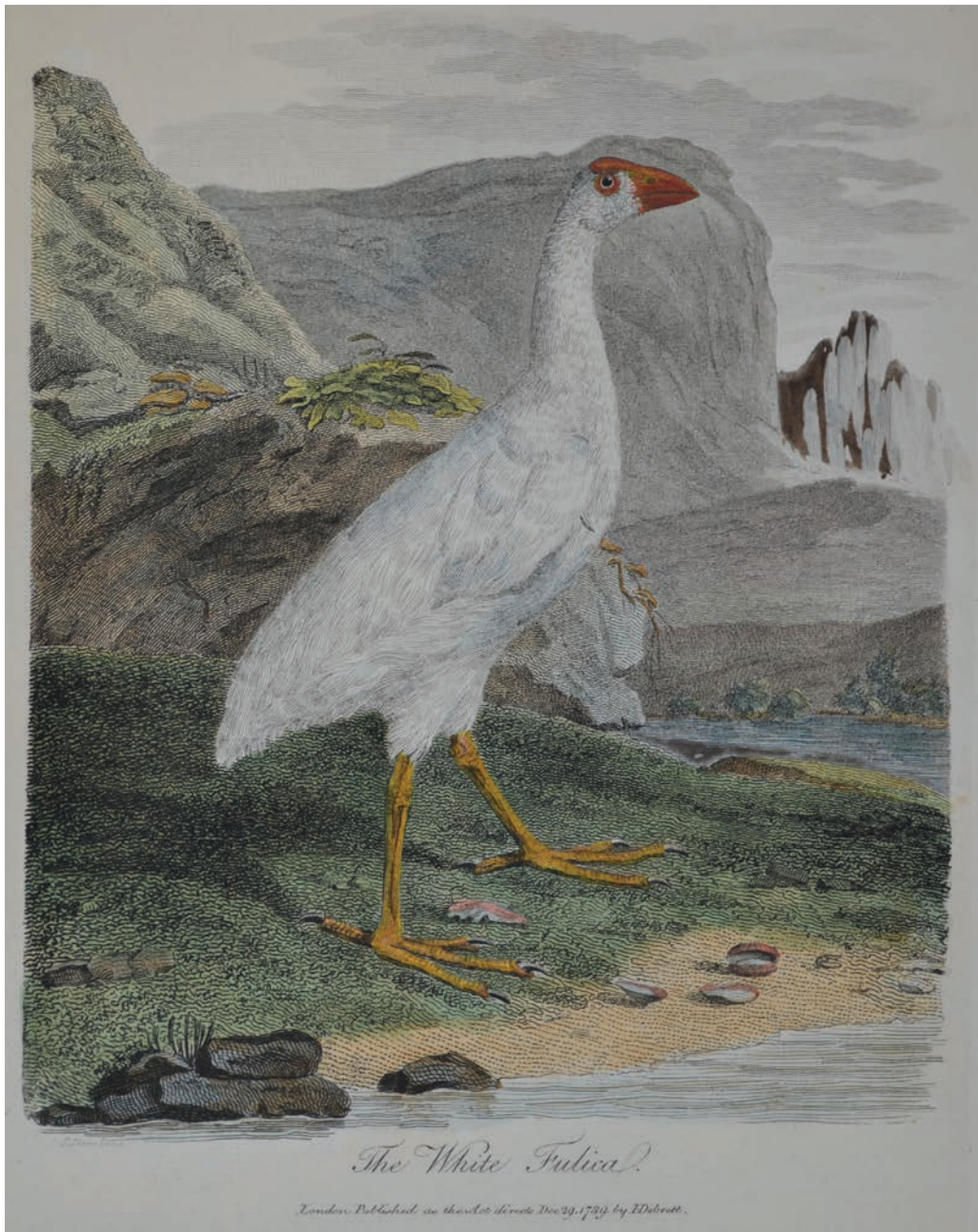
Figure 6. The White Fulica, pl. 27 in White (1790), as depicted by Sarah Stone based on the mounted specimen in the Leverian Museum (Hein van Grouw, Natural History Museum, Tring)