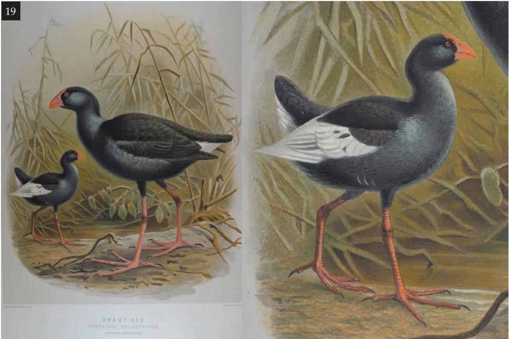
Figure 19. Pl. 31 in Buller (1888); full image (left) and inset (right) of New Zealand Swamphen P. p. melanotos with progressive greying based on a specimen in Buller's collection