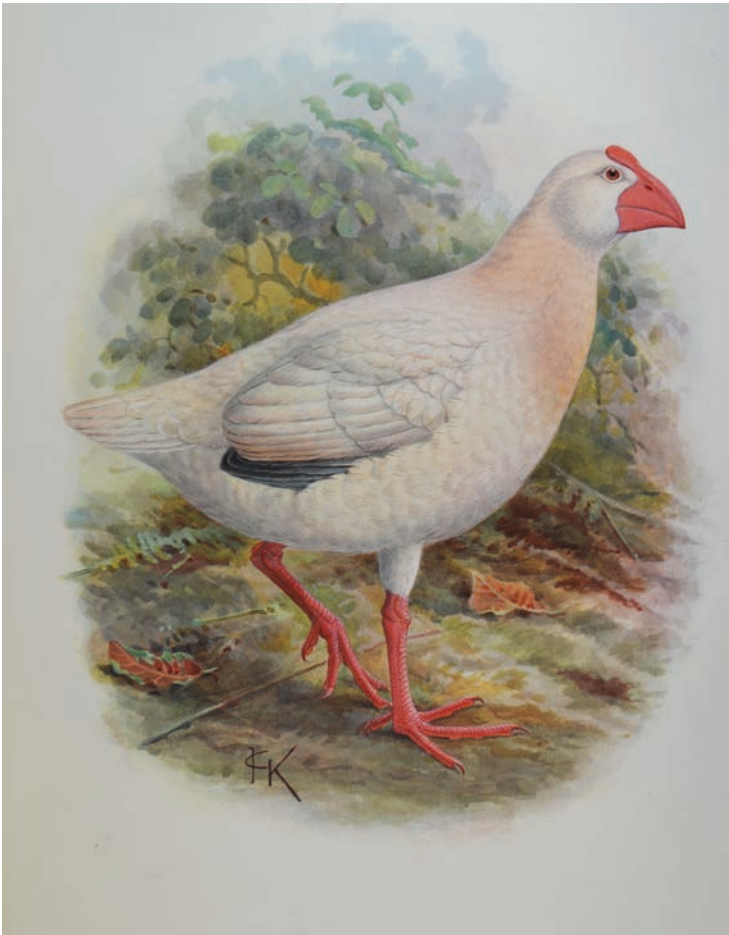
Figure 13. Illustration of a Takaha-like Lord Howe Gallinule Notornis alba in Rothschild (1907) by J. G. Keulemans, based on how Rothschild thought the species would have appeared in life; although it is based on the Vienna specimen, artistic license permitted Rothschild / Keulemans to erroneously picture the bird with coloured primaries

raperi in recognition of the artist. His grounds were extremely dubious to say the least and, subsequently, when Mathews (1936) had reproduced the Raper painting (Fig. 14) and compared it to the Vienna skin, he admitted his error and synonymised P. raperi under P. albus .