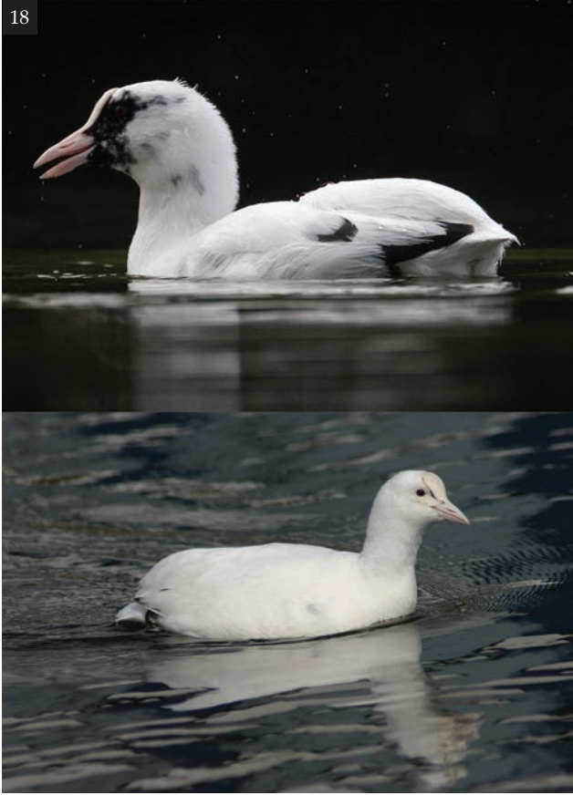
Figure 18. Two Common Coots Fulica atra showing different stages of progressive greying; top: Tolkamer, the Netherlands, 29 June 2006, below (in final stage of progressive Greying): Capelle aan den IJssel, the Netherlands, 28 March 2004