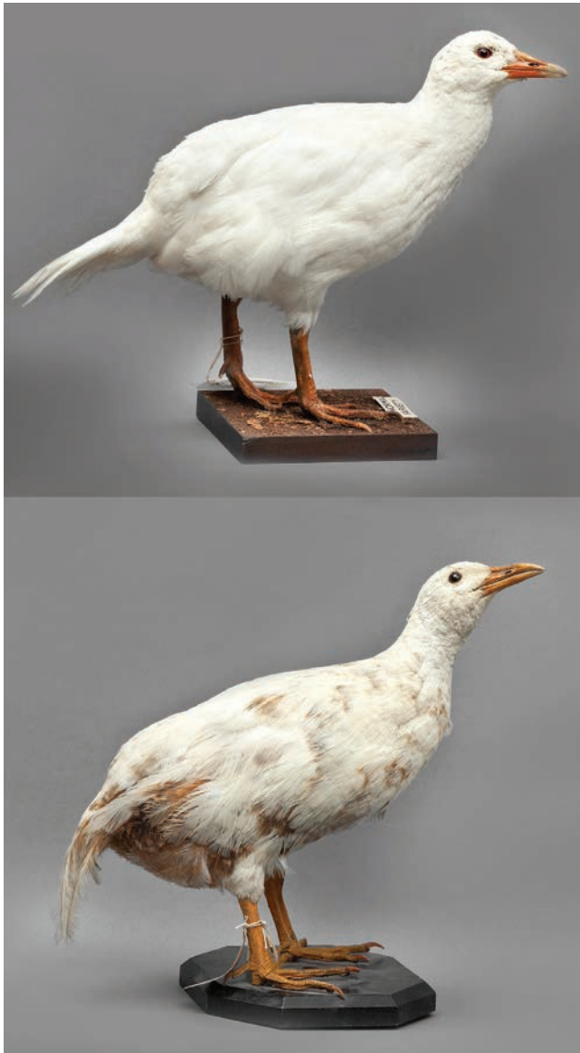
Figure 15. Two specimens of Weka Gallirallus australis showing different stages of progressive greying; top: NHMUK 2004.15.419 (in the final stage of progressive greying), below: NHMUK 1939.12.9.3710

wrote to him from Rangitikei: 'I obtained two specimens of Pukeko [Swampheh] which are partial albinos, but the pure white one I had seen I was not able to get, though he was seen again'.