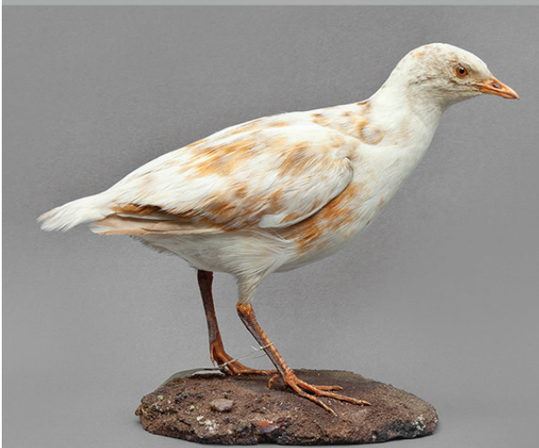
Figure 16. Two specimens of Common Moorhen Gallinula chloropus showing different stages of progressive greying; left: NHMUK 1996.41.2095, right: NHMUK 1996.41.2359