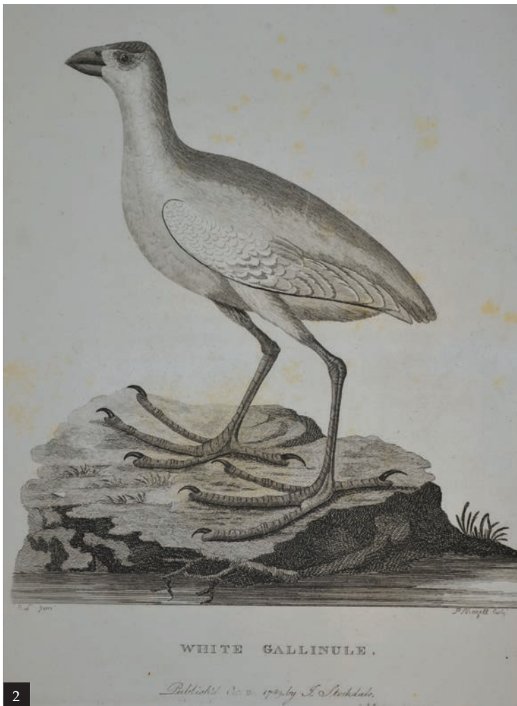
Figure 2. White Gallinule, pl. 44 in Phillip (1789), probably based on a live specimen (Hein van Grouw, Natural History Museum, Tring)