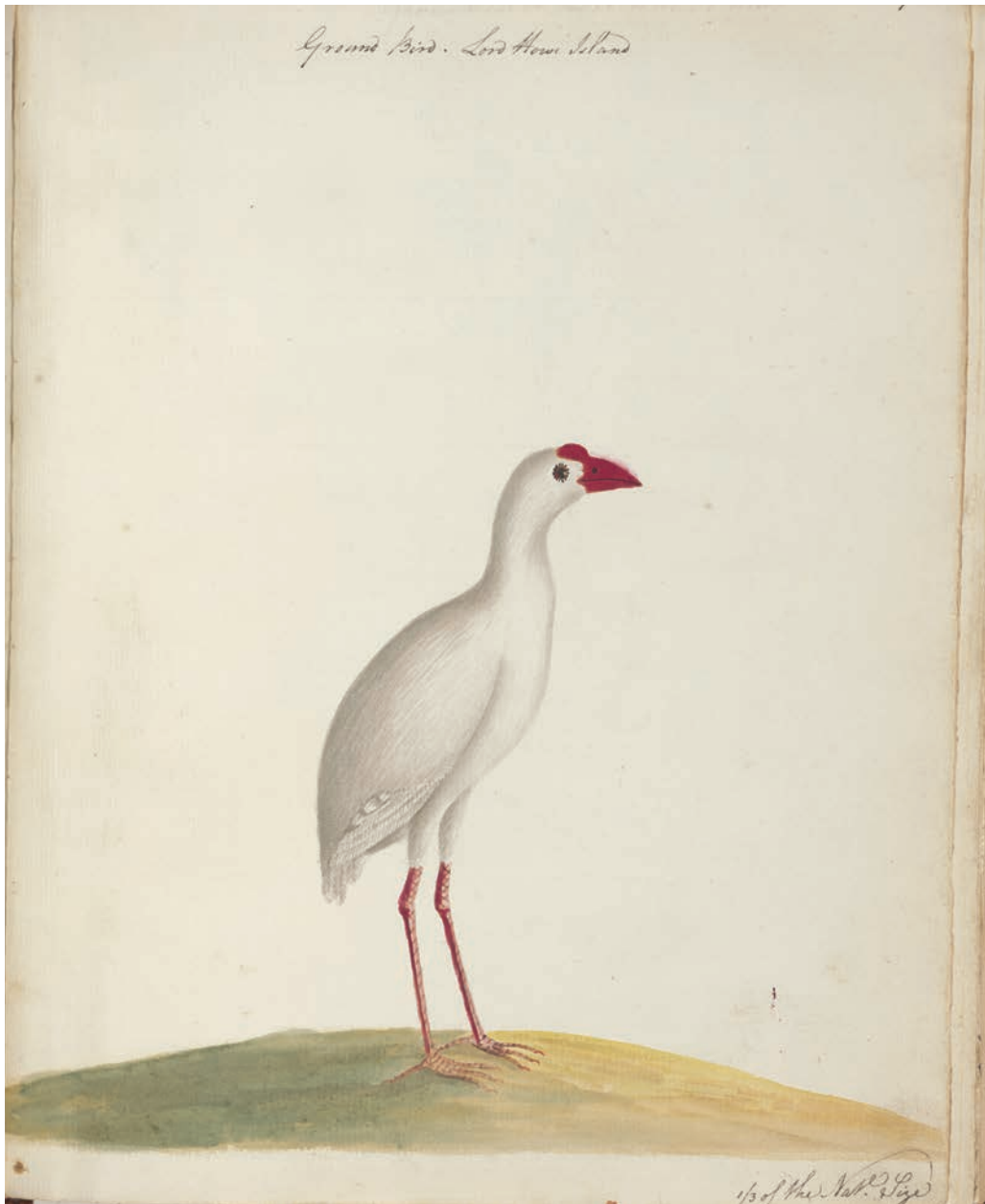
Figure 3. Ground Bird of Lord Howe Island; a Lord Howe Gallinule Porphyrio albus depicted by John Hunter (1788–90) (National Library of Australia, Canberra)