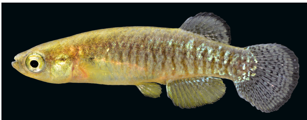
Fig. 11. Valencia letourneuxi , not preserved, male, about 30 mm SL; Albania: Lake Butrint; from a captive stock.

on road to Krestinu, at turnoff from road from Igoumenitsa to Smertos, 39°32'53" N 20°14'6" E. – CMK 16946, 14; Greece: Epiros prov: Acheron River estuary, canal in swamp west of Mesopotamo, 39°14'54" N 20°30'52" E. – CMK 16952, 1; Greece: Epiros prov: Barbanakos spring at Stefani, about 5 km northeast of Louros, 39°10'28" N 20°48'29" E.