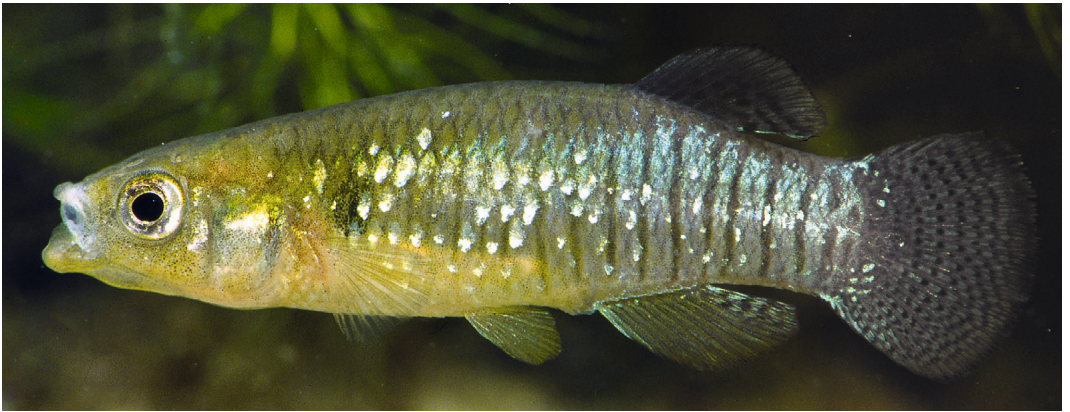
Fig. 8. Valencia letourneuxi , not preserved, male, about 40 mm SL; Greece: Corfu Island.