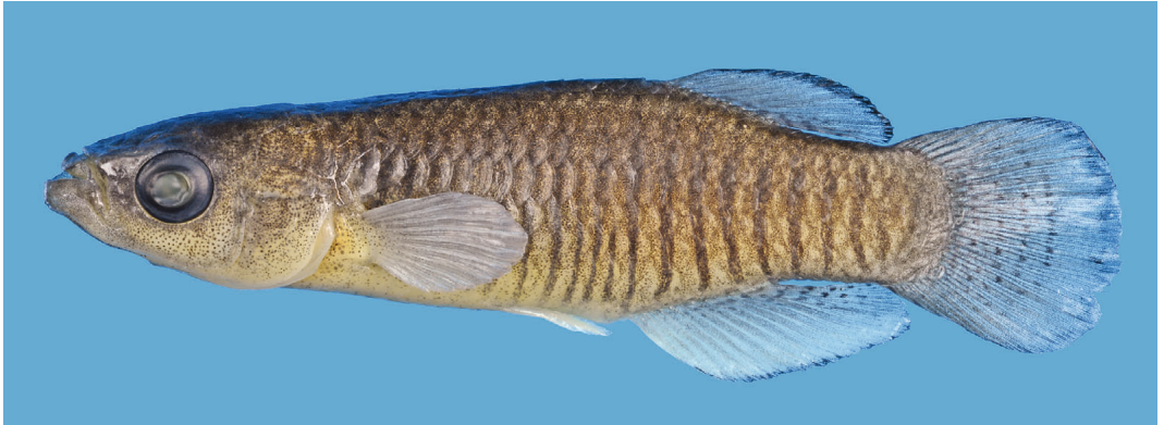
Fig. 1. Valencia robertae , ZFMK 59197, holotype, 38.6 mm SL; Greece: River Pinios.