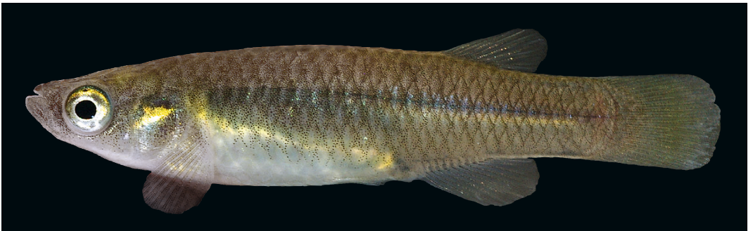
Fig. 9. Valencia letourneuxi , not preserved; about 50 mm SL; Greece: lower Acheron drainage.

Comparative material. Valencia letourneuxi : MNHN A-2342, 3, 27.7–56.6 mm SL; MNHN A-2343, 3, 27.5–35.5 mm SL, MNHN A-2344, 3, 25.2–47.4 mm SL; syntypes, Greece: Corfu Island: Cressida. – FSJF 3426, 8,