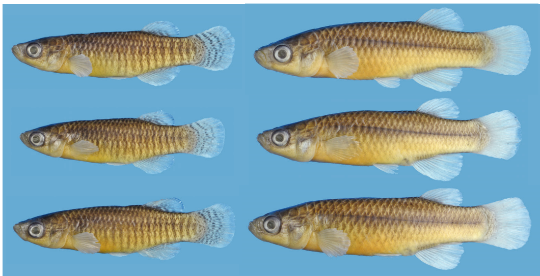
Fig. 10. Valencia letourneuxi , FSJF 3426, left from top: males 34.8, 31.6, 35.2 mm SL; right from top: females 43.9, 41.9, 45.6 mm SL; Greece: Corfu Island.