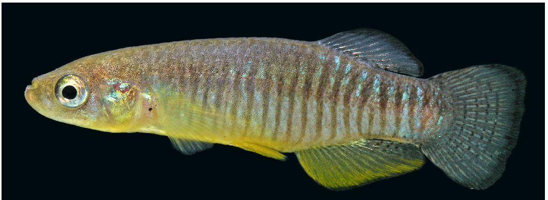
Fig. 3. Valencia robertae , ZFMK 59197, holotype, male, 38.6 mm SL; Greece: River Pinios.