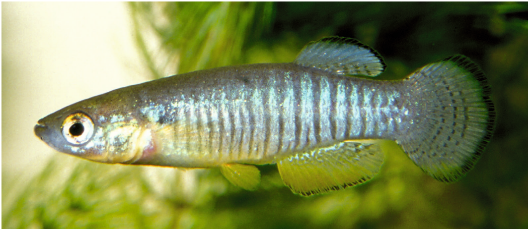
Fig. 5. Valencia robertae , not preserved, male collected in 1994, about 30 mm SL; Greece: River Pinios (right side reversed).