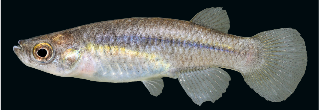
Fig. 7. Valencia robertae , not preserved, female, about 30 mm SL; Greece: River Mornos.