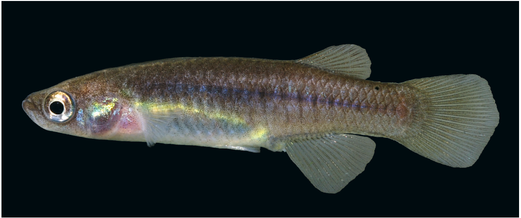
Fig. 4. Valencia robertae , ZFMK 59204, paratype, female, 37.8 mm SL; Greece: River Pinios.