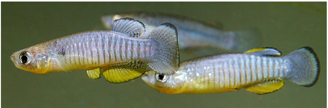
Fig. 6. Valencia robertae , not preserved, males, about 30 mm SL; Greece: River Mornos.