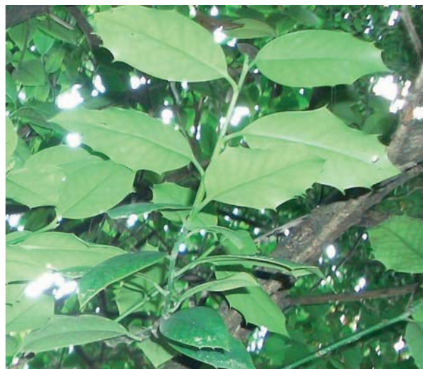
Fig. 3. Quercus calliprinos from Qafa e Llogorasë, Vlora district.