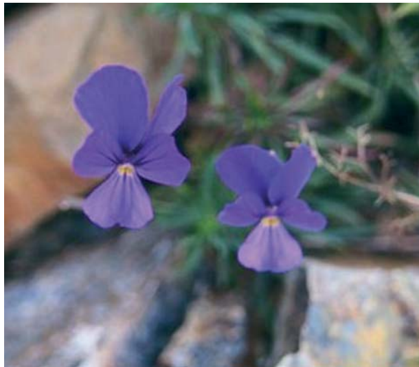
Fig. 5. Viola raunsiensis from Kukës district, N Albania.

Mediterranean element of the Albanian flora was reported previously from the Vjosa river valley at the Greek border, at altitudes between 300 and 700 m. The new record from the Osumi gorge is from south-facing slopes situated 70 km further north at altitudes between 400 and 500 m. Solitary individuals were found growing along forest roads in the macchie.