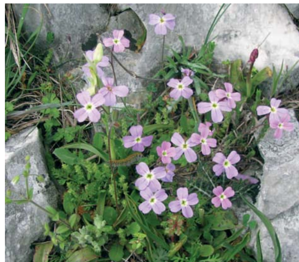
Fig. 2. Malcolmia graeca subsp. bicolor from Qafa e Llogorasë, Vlora district.