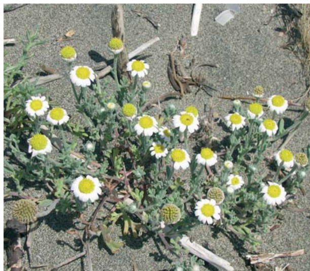
Fig. 1. Anthemis tomentosa from Spille, Kavaja district.

Parasitic on the serpentine species Alyssum murale and A. markgrafii which are well-known nickel hyperaccumulators. O. rechingeri is recorded from serpentine substrate in SW Anatolia, C and NW Greece. Its occurrence in Albania extends the known distribution westwards. It is the only parasitic flowering plant in Europe which is an obligate serpentinophyte.