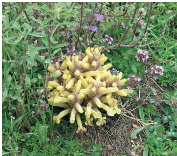
Fig. 4. Orobanche rechingeri parasitic on Alyssum murale at Dushku lake, Gramshi district.