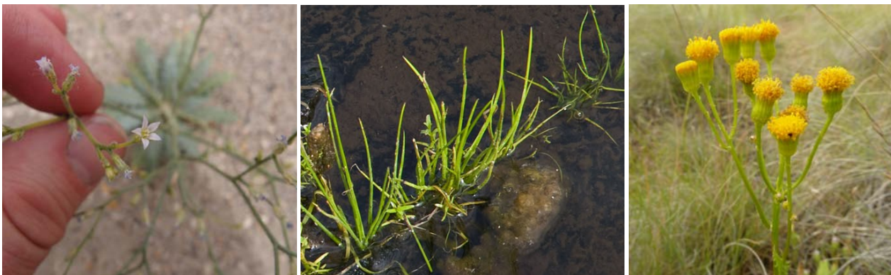
Far left: Aliciella leptomeria. Center: Isoetes nuttallii. Right: Packera cana.