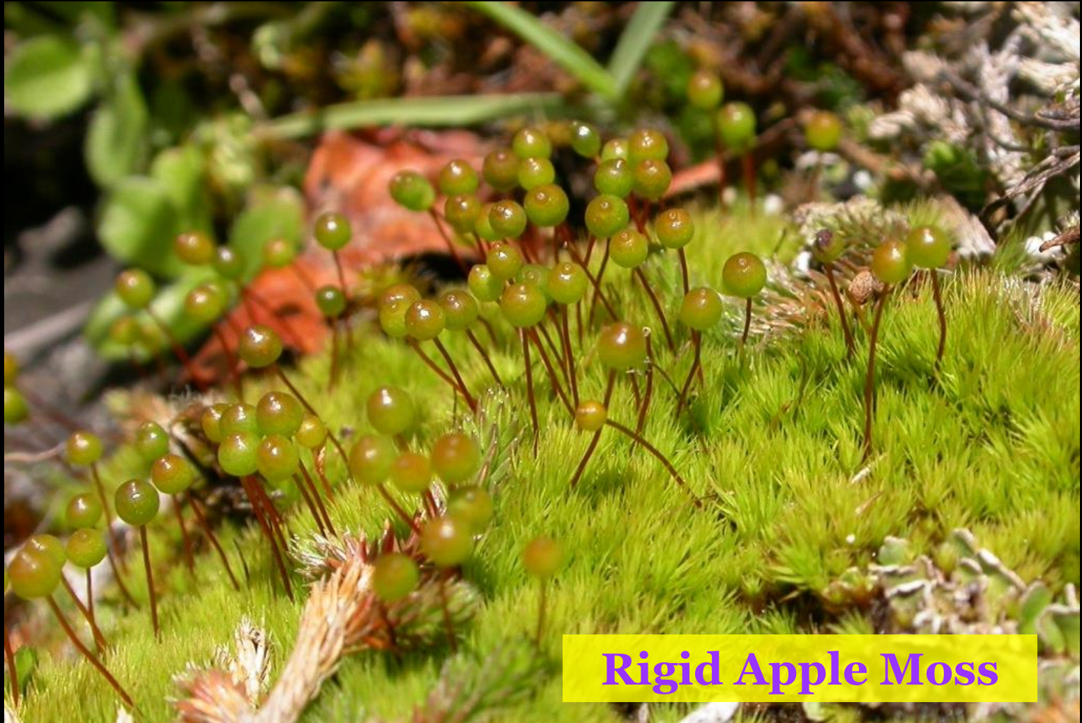
Rigid Apple Moss