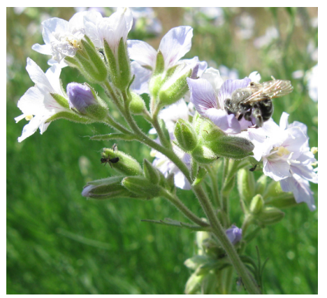
Washington polemonium with pollinator