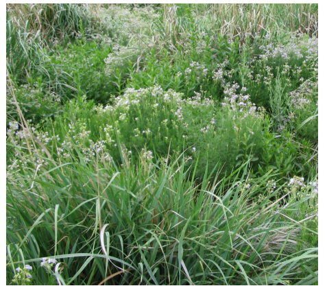
Washington polemonium scabland habitat