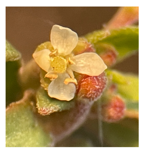
Small evening primrose (Eremothera minor)

Monitoring annuals in the drylands of eastern Washington also pose a logistical challenge. We often don't know which year will be a good year for annuals while making our priority monitoring list in the winter. In fact, last year's precipitation was below average until April, but April through June saw above-average precipitation. By then Rare Care volunteers had already made their spring monitoring plans and we were very fortunate to have two volunteers in the right time at the right place.