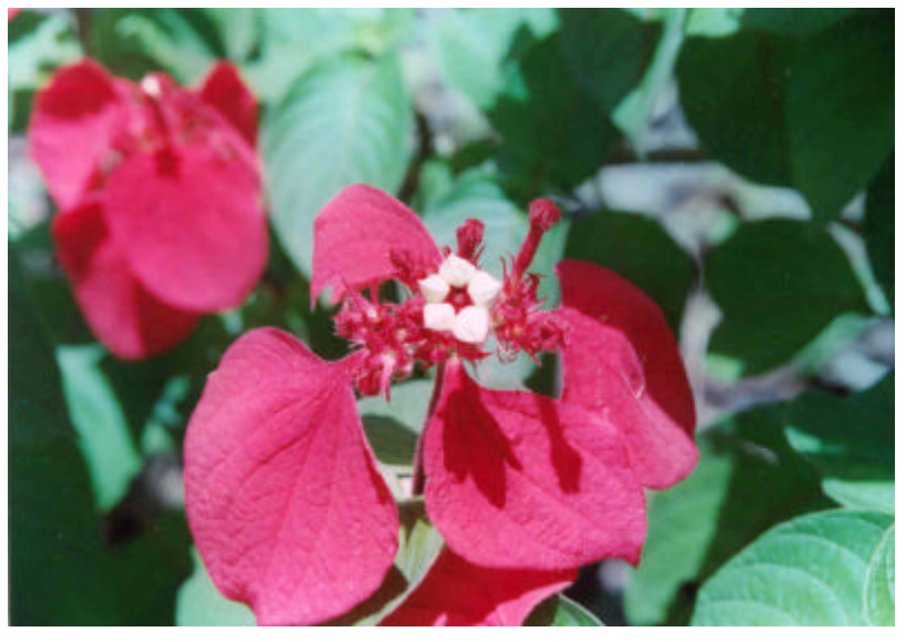
Figure 3 M. erythrophylla inflorescence showing red Calycophylls and white 5-petalled flower