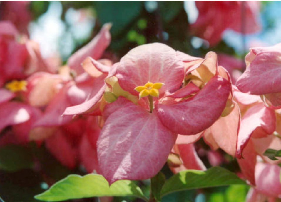
Figure 5 Musseanda 'Queen Sirkit" showing 5-petalled tubular flower and pink calycophylls