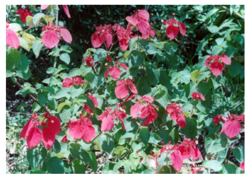
Figure 2 Musseanda erythrophylla