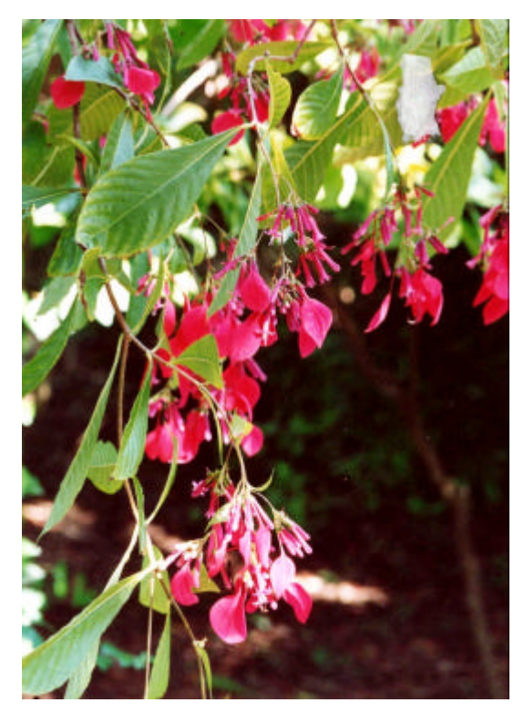
Figure 1. Pogonopus speciosus