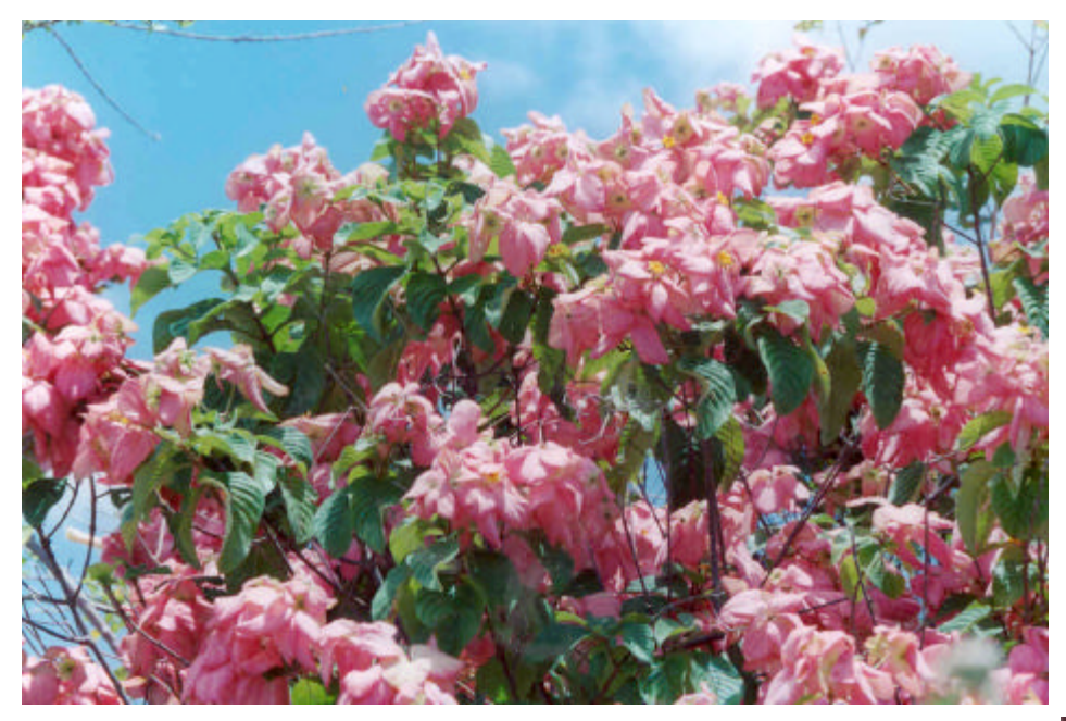
Figure 4 Musseanda 'Queen Sirkit'