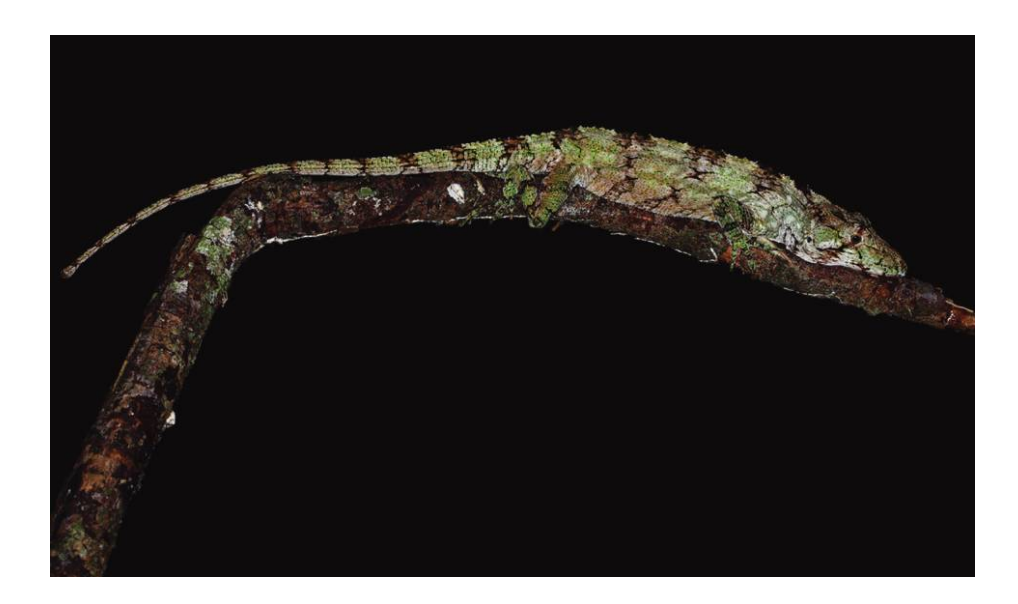
Anolis landestoyi perched on a branch.