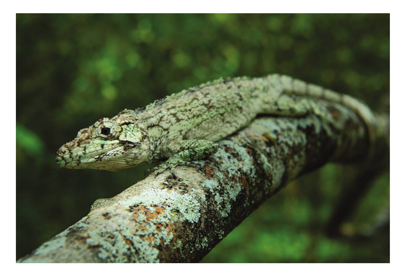
Figure 1: Anolis landestoyi sp. nov. (DLM_DR2011_11), posed in natural habitat.

online). Distinguishable from similar anoles in the Cuban chamaeleonides clade by dewlap color and pattern; absence of a large, rugose parietal casque in adults; presence of nuchal ocellus; presence of a single scale between nasal and rostral, flank scales in partial contact; weakly to strongly keeled ventrals; and multicarinate supradigitals (table S3). Additional diagnostic information is provided in section S1(c) of the appendix and table S3.