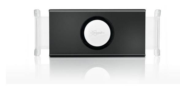
*Fits all tablets 7" up to 13"

The stylishly designed Vogel's tablet holder fits all tablets from 7-13 inches that are 0.2-0.5 inches (0.5-1.3 cm) thick. It features Vogel's RingO mounting technology, which can be easily clicked on to the tablet mount.