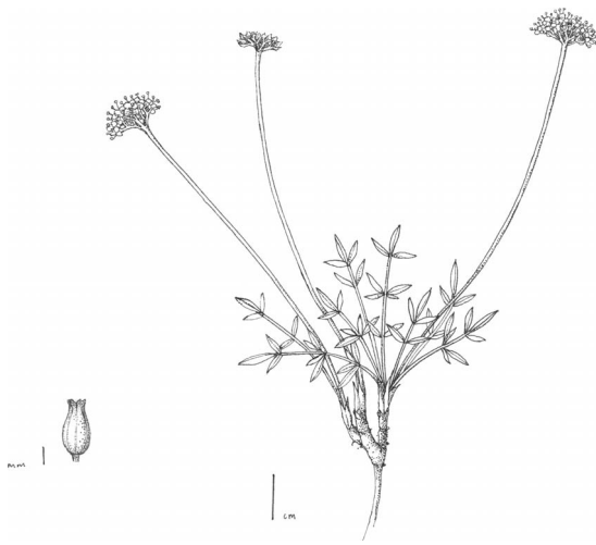
FIG. 1. Musineon naomiensis L. M. Shultz and F. J. Smith, sp. nov. (A) Habit. (B) Fruit. Illustration by Lara Call Gastinger.

with persistent leaf bases; acaulescent, faintly aromatic. Roots thick taproot that is usually branched. Leaves pinnately compound with 5–7 leaflets, 2–5 (–7) X 1–2 cm, rarely twice-pinnate, broadly lanceolate in outline, glabrous, dark green on both surfaces, leaflets linear-oblancoate, 3–5 (–10) X 1.0–1.5 mm, with revolute margins, apical leaflets longer than the laterals; petioles 1–3 cm long with conspicuous papery sheaths. Inflorescence a compound umbel, compact, 5–8 (–10) mm