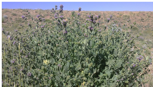
Figure 1. Photograph of Ballota nigra subsp. kurdica Taken at the Time of Collection

port of its chemical composition and antimicrobial activity has been presented in the present work to evaluate its potential as an antimicrobial agent in the future.