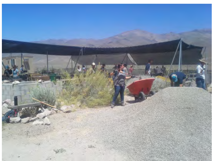
The Forest Service volunteers lending many helpful hands.