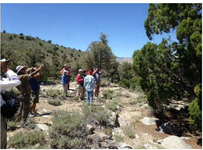
The group looking up for mistletoe.