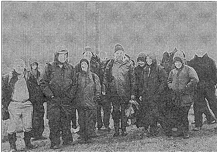
The party about to depart for Craig y Cilau National Nature Reserve near Crickhowell.