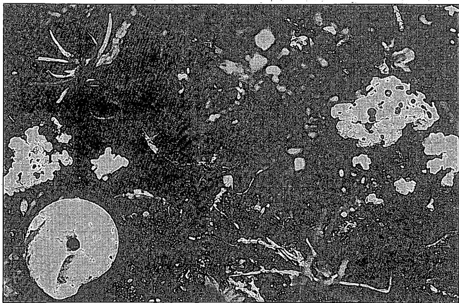
Buellia asterella - one of the BAP species restricted to Breckland.