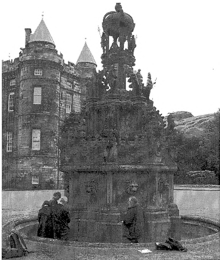
Fig 1. View of the fountain with Holyrood Palace and Arthur's Seat in the background. The figures are (from left to right) Irene Fortune, Raymond Raeburn, Peder Aspen and Brian Coppins. Brian stands in front of the monument's north-east aspect.