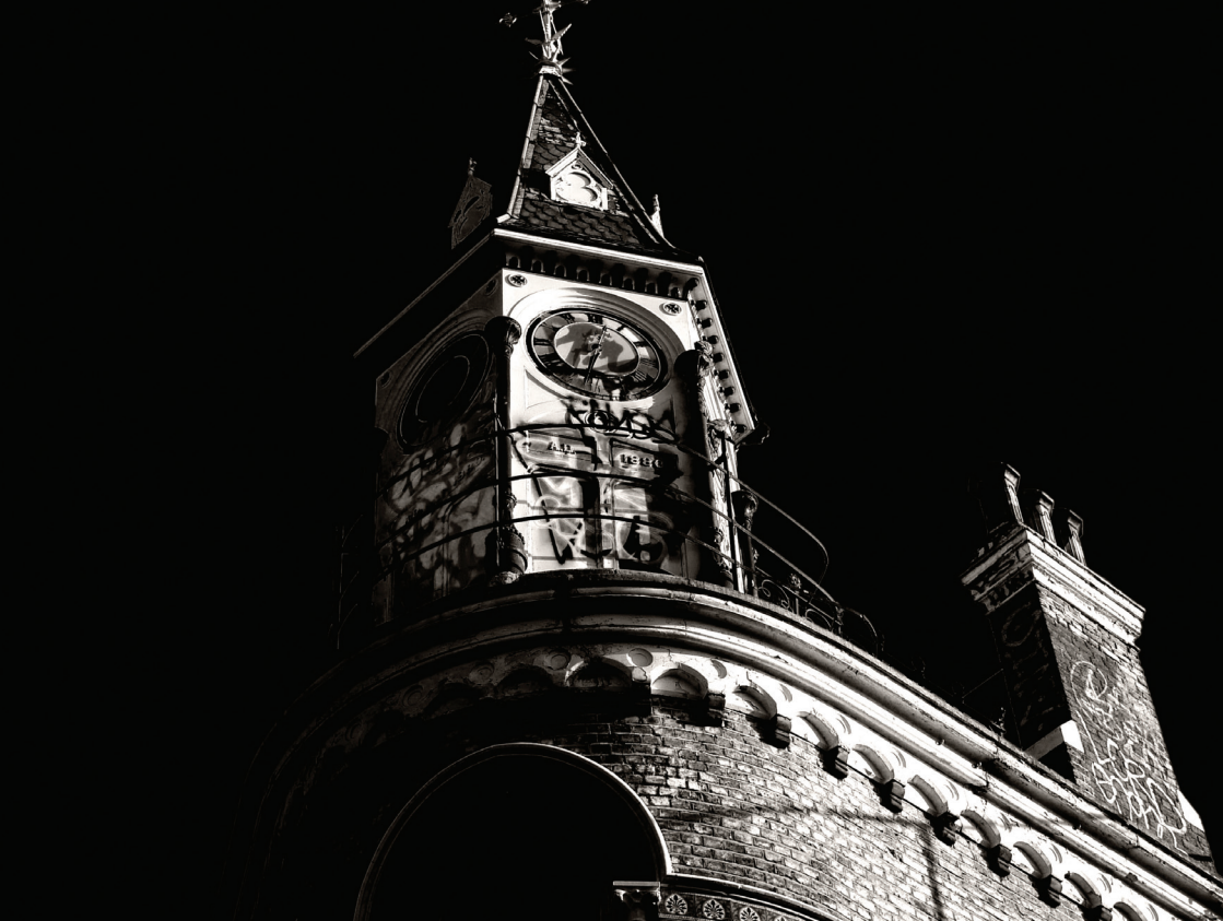
Photo: Clock tower of The Railway Hotel/Brady's pub, Atlantic Rd.