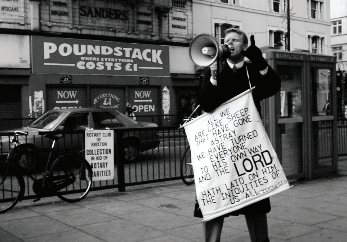
Photo: The Brixton Evangelist outside Brixton tube station, 2000