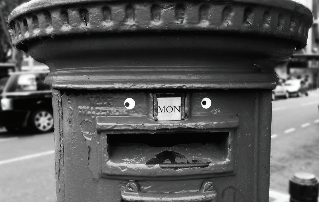
Photo: The happiest post box in Brixton, Coldharbour Lane/Somerleyton Road