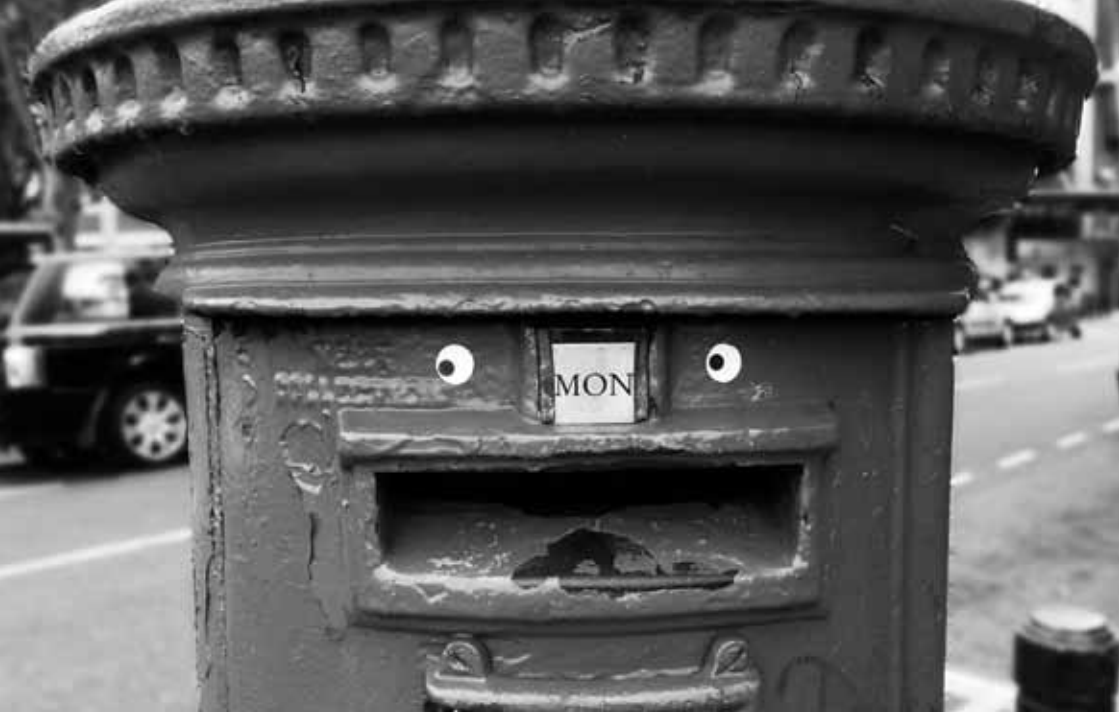
Photo: The happiest post box in Brixton, Coldharbour Lane/Somerleyton Road