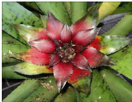
The inflorescence of Pete's Wittrockia 'Leopardinum'.

Dr Pete Pfister showed a hybrid, Wittrockia 'Leopardinum' discovered in late 1800 near Rio de Janeiro. Grows up to 1.5m wide and 80cm high. Takes up to 15 years to flower!!!! It is cold hardy, tolerant of tropical conditions and adaptable to a range of light levels. It has never been rediscovered in a natural habitat!! A cultivar of Wittrockia gigantea . The variegated form is very rare. It has a dark blood red flower. There are seven species in this genus.