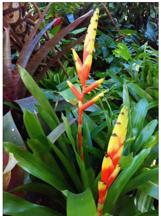
Barbs' Vriesea ensiformis var. bicolor .