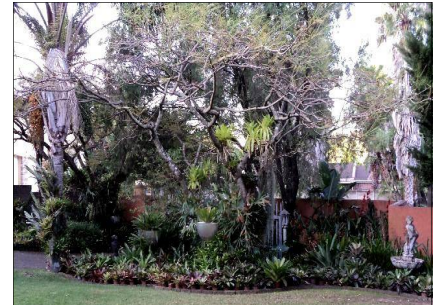
How things have changed, before and 14 years later photos of the house and looking down towards Brenda's garden next to the gate area.