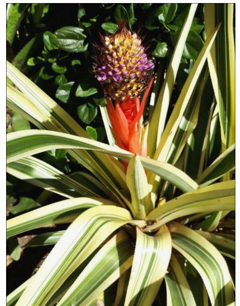
Aechmea 'Nationalis' Marginated