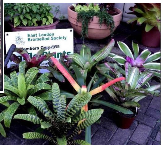
The selection of plants supplied by members for the local raffle winners to choose from.