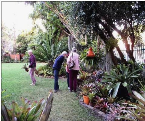
Members enjoying the garden. Right, a stunning display of Guzmania in the shady area of the back garden.