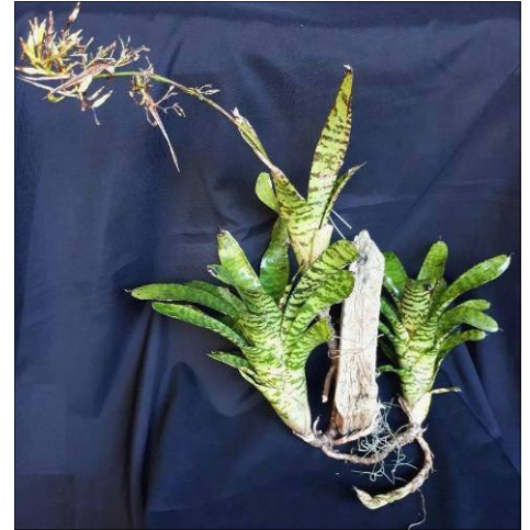
Dudley's mounted Aechmea correia-araujo with more pups developing.

Dudley Reynolds showed Deuterocohnia brevifolia . (maybe D. abstrusa formerly D. lorentziana ) It is a species native to Bolivia and North Western Argentina. The small, spiny succulent rosettes eventually grow into big clump shapes or mounds called: 'pollster'. This plant enjoys strong sunlight and must be grown in a free draining medium. Small green flowers emerge throughout the winter. I need to move mine into more sun.