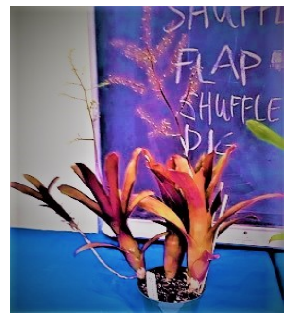
Araeoccus pariflorus 'Red Form' - Lee