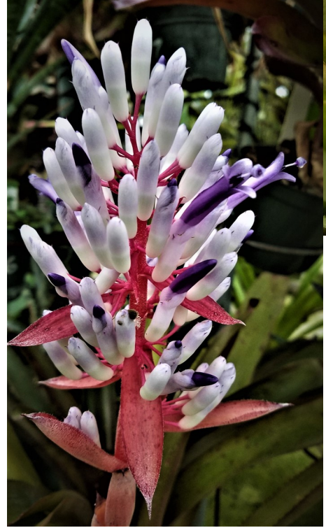
Portea alatisepala