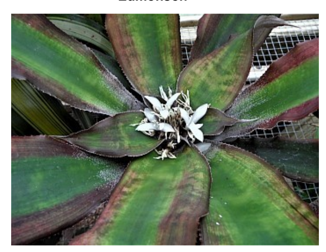
Cryptanthus 'Witch Doctor' Edmonson