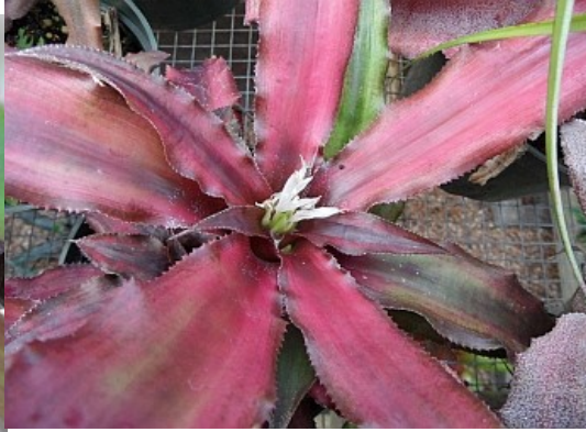
Cryptanthus 'Evon'