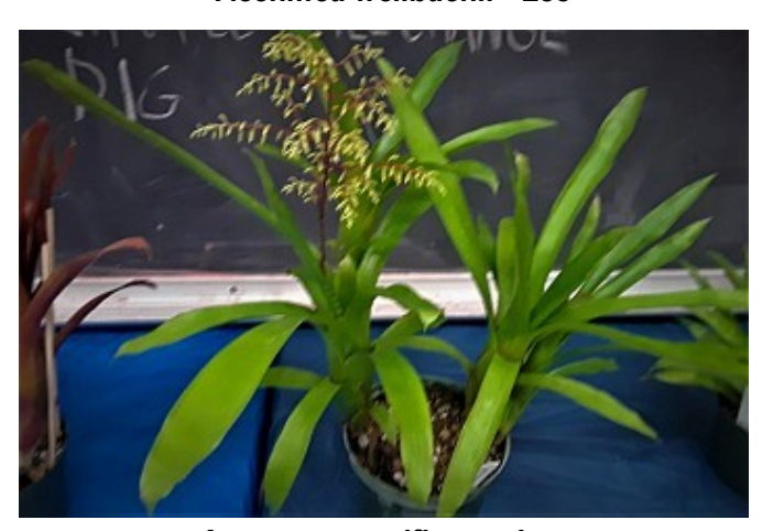
Araeoccus pariflorus - Lee