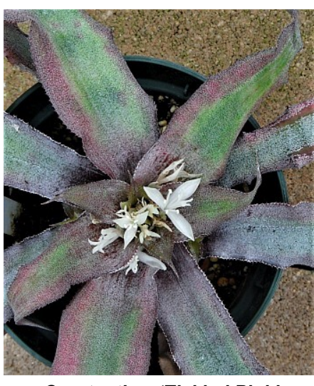
Cryptanthus 'Tickled Pink' (J. Edmonson)