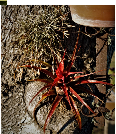
Upper left to lower right Tillandsia recurvata bloomed out Aechmea recurvata 'Red Form' in bloom Unknown Tillandsia seedlings growing on metal plant hanger (D. Whipkey)