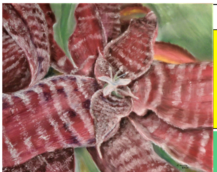
Cryptanthus 'Ruby Slippers' by Earthstar Designs

MEETING DATE: Tuesday, February 18, 2020