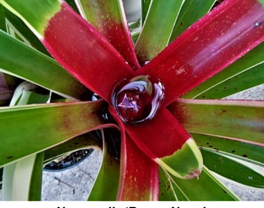
Neoregelia 'Bossa Nova'