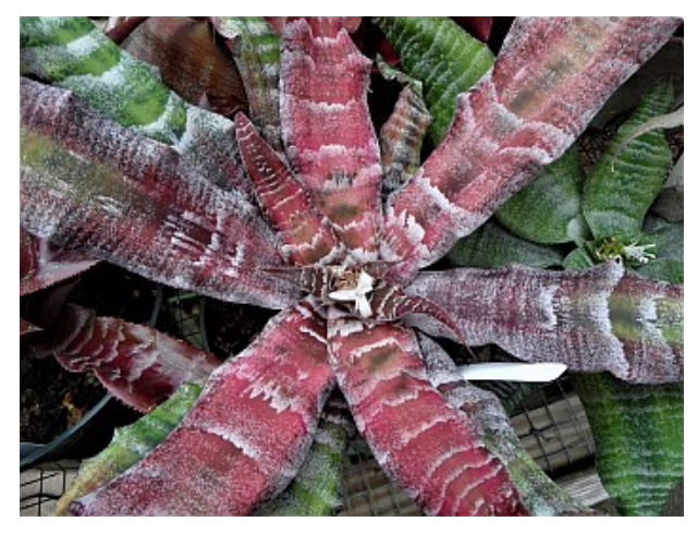
Cryptanthus 'Arctic Rainbow' and 'Lime Sprite' Edmonson