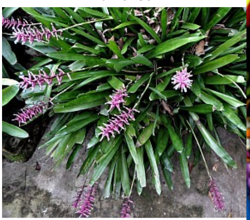
Aechema gamosepala Edmonson