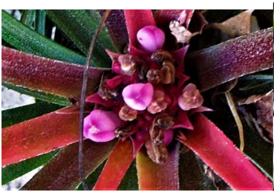
Aechmea recurvata