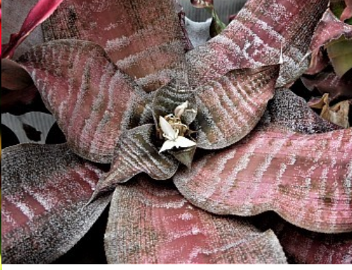
Cryptanthus 'Peachy Keen' Edmonson