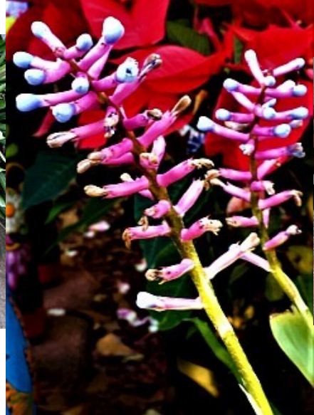
Aechema gamosepala Baker