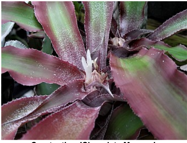
Cryptanthus 'Chocolate Mousse' -Edmonson