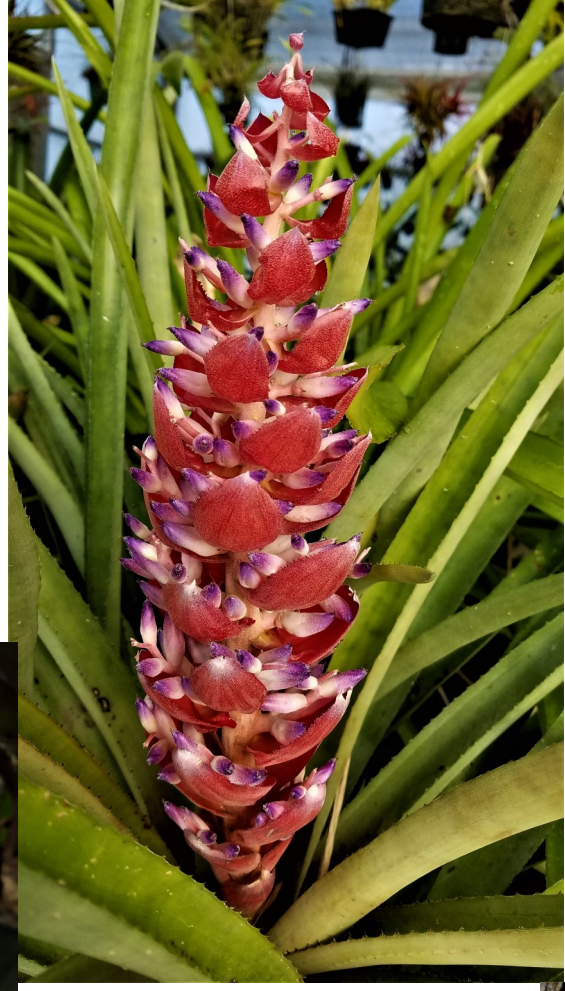
Aechmea lamarchei