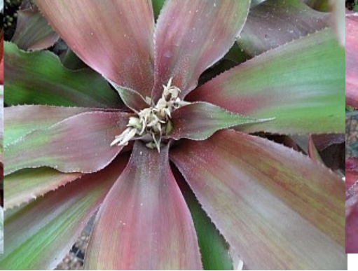
Cryptanthus 'Dragonfire'