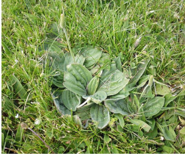
Plantago media

The records for this Register have been selected from the databases held by the Botanical Society of Britain and Ireland (BSBI).