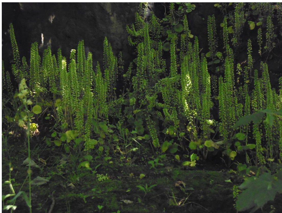
Umbilicus rupestris on shady rocks beside the stepped path leading to the summit of Calton Hill, Edinburgh. This was a new site for this species on 7 th September, 2011, when discovered by B.E.H.S. This photograph was taken on 18 th June, 2014, when the colony had grown a bit.