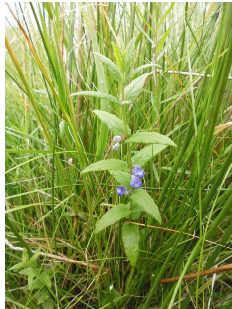
Scutellaria galericulata