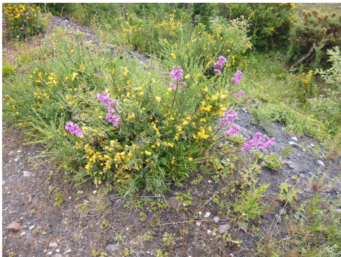
Silene viscaria among natural vegetation on the edge of the disused Monktonhall Bing. Photographed on 25 th May, 2019

Botanical Society of Britain and Ireland: bsbi.org Botanical Society of Scotland: www.botanical-society-scotland.org.uk British Pteridological Society: ebps.org.uk Historic Environment Scotland (formerly Historic Scotland): www.historicenvironment.scot Joint Nature Conservation Committee: jncc.gov.uk National Biodiversity Network: nbn.org.uk National Trust for Scotland: www.nts.org.uk NatureScot (formerly Scottish Natural Heritage): www.nature.scot Online Atlas of the British and Irish Flora: www.brc.ac.uk/plantatlas Pentland Hills Regional Park: www.pentlandhills.org Plantlife Scotland: www.plantlife.org.uk/scotland Royal Botanic Garden Edinburgh: www.rbge.org.uk Scottish Wildlife Trust: scottishwildlifetrust.org.uk The Wildlife Information Centre (TWIC): www.wildlifeinformation.co.uk UK Grid Reference Finder: gridreferencefinder.com Woodland Trust: www.woodlandtrust.org.uk