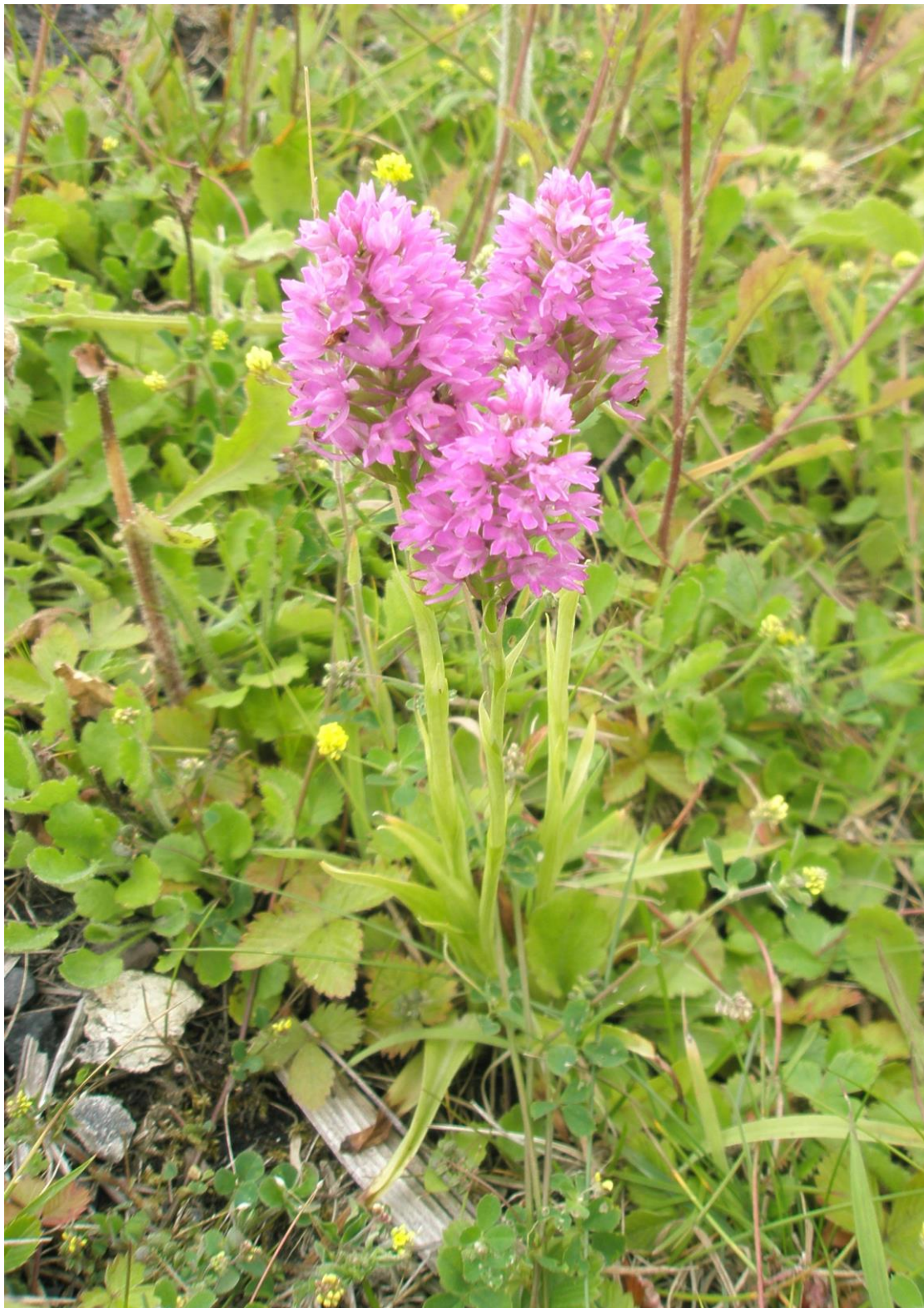
Anacamptis pyramidalis , extinct in VC 83