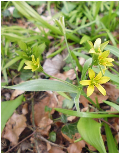
Gagea lutea