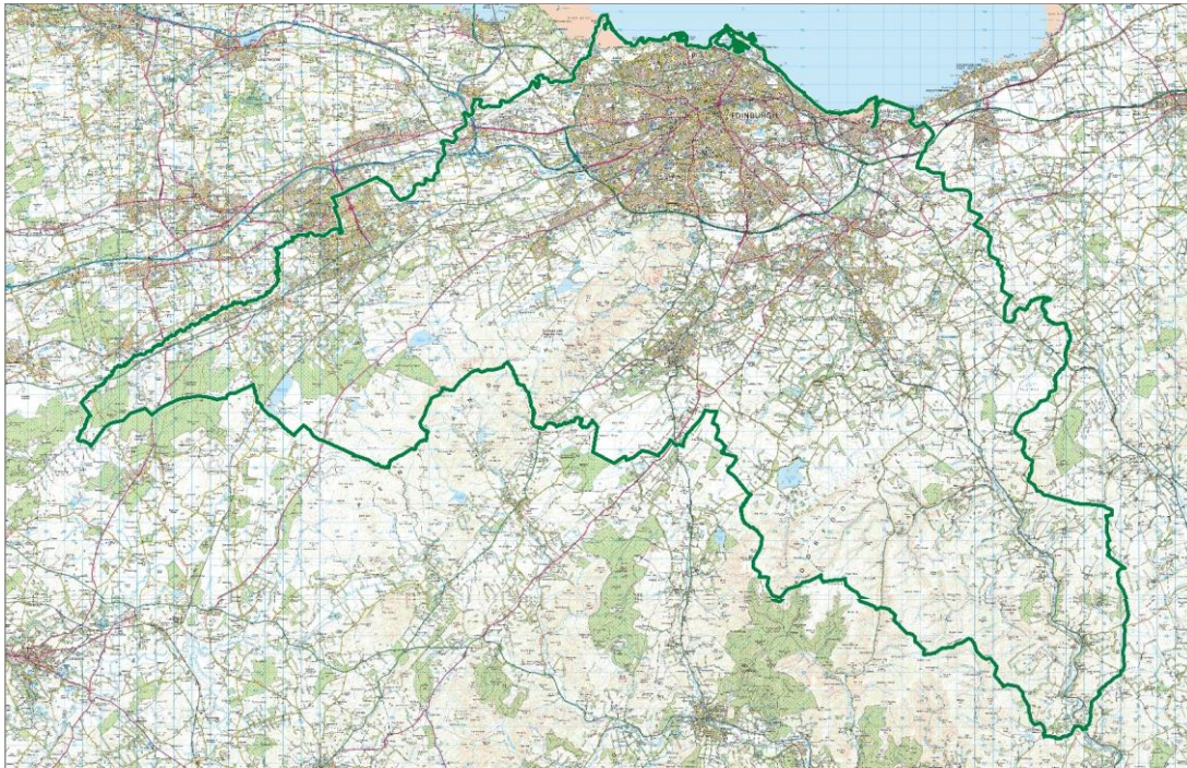
Watsonian Vice-county data sourced from the National Biodiversity Network. The data provider and the NBN Trust bear no responsibility for any further analysis or interpretation of the data. O.S. OpenData basemap. The maps contain Ordnance Survey data © Crown Copyright and database right.