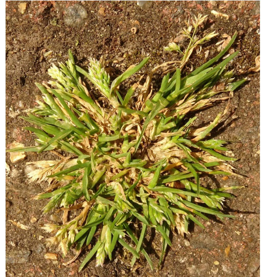
Short culmed pavement form of Poa annua with dark green leaves; only 1 panicle (top right) with long patent reflexed branches