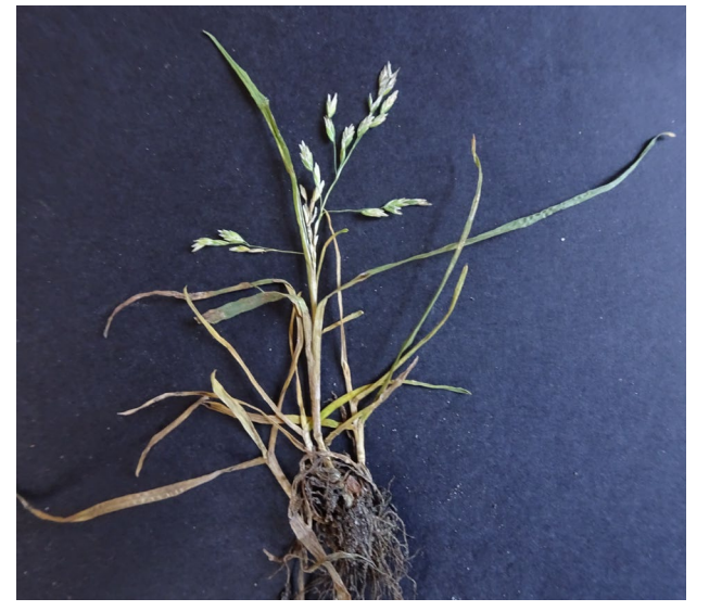
Typical upright form of Poa annua: long culmed plant with long patent-reflexed panicle branches, especially near base

P. infirma, procumbent and upright forms from same population; Central Norwich (vc 27); note pale green leaves and very small spikelets.