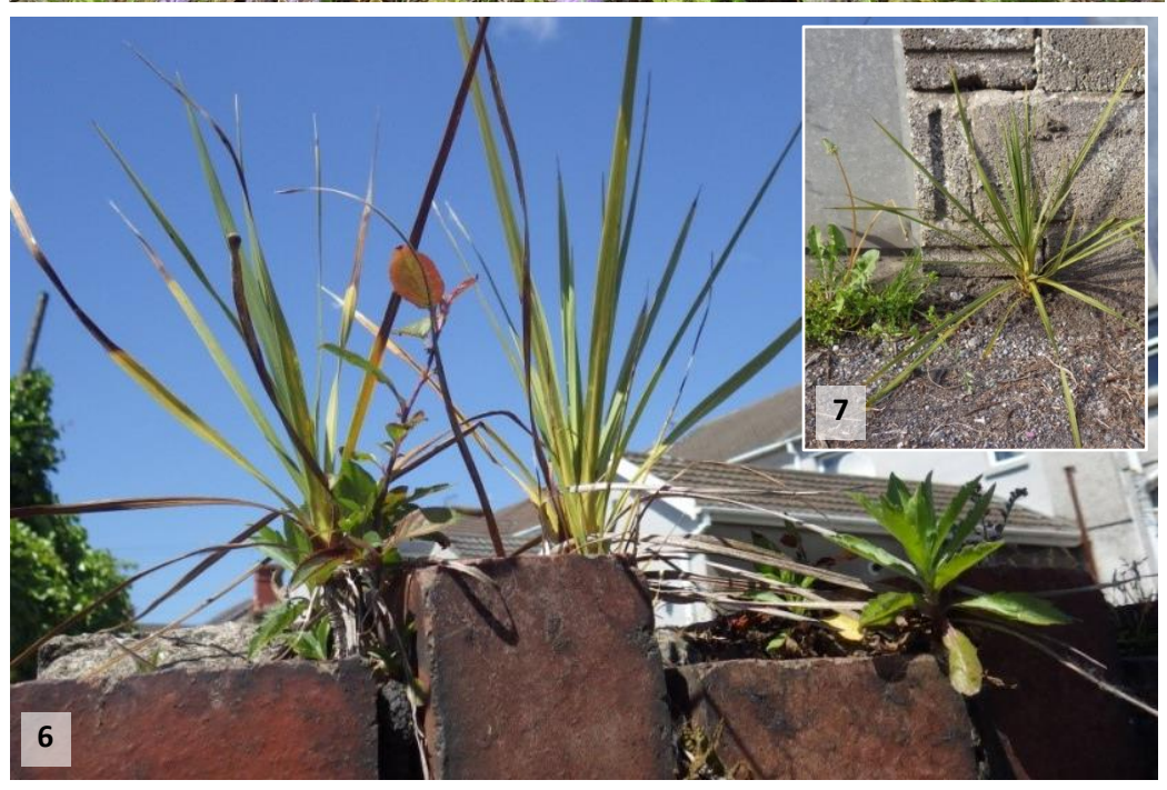
BSBI Welsh Bulletin No. 108 July 2021