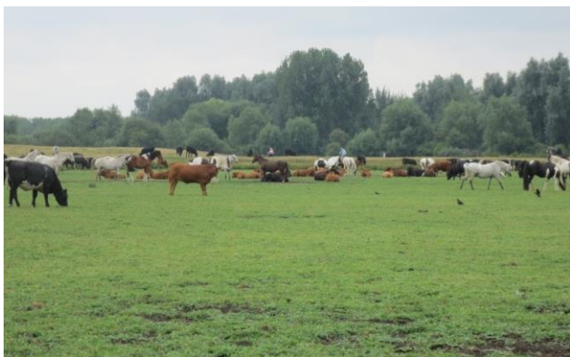
Port Meadow in Oxfordshire, one of only two extant native sites for Apium repens in the British Isles.

Compound umbels containing hermaphrodite white flowers are held on 4-7 smooth rays (the stalk of a partial umbel – not to be confused with the peduncle, the main stalk of an inflorescence). Peduncles are usually clearly longer than the rays and adjacent petiole (Tutin, 1980) although in heavily grazed pasture this feature is not always obvious. Bracts and bracteoles are lanceolate to ovate and deflexed (Tutin, 1980). The fruit – a double achene consisting of two suborbicular