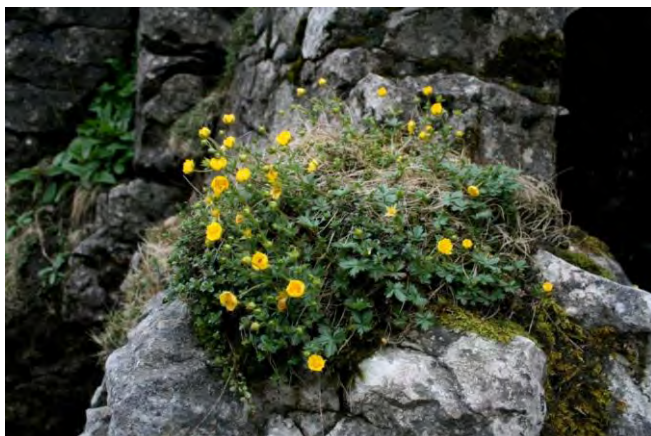
Potentilla crantzii at Crowdundle Beck, Cumberland.

On limestones in northern England most populations occur in NVC CG9 Sesleria albicans-Galium sternerii and CG10 Festuca ovina-Agrostis capillaris-Thymus praecox grassland. On grazed slopes at higher altitudes, often below crags, it is more typical of CG11 Festuca ovina-Agrostis capillaris-Alchemilla alpina grass-heaths, whereas on calcareous rock