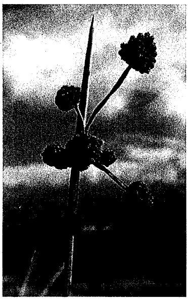
Above: Scirpoides holoschoenus (Round-headed Club-rush) and, right: specimens of Equisetum ramosissimum (Branched Horsetail), between Corporation Road and the River Usk, Newport, v.c. 35. See 'Equisetum ramosissimum Desf. – Branched Horsetail'.