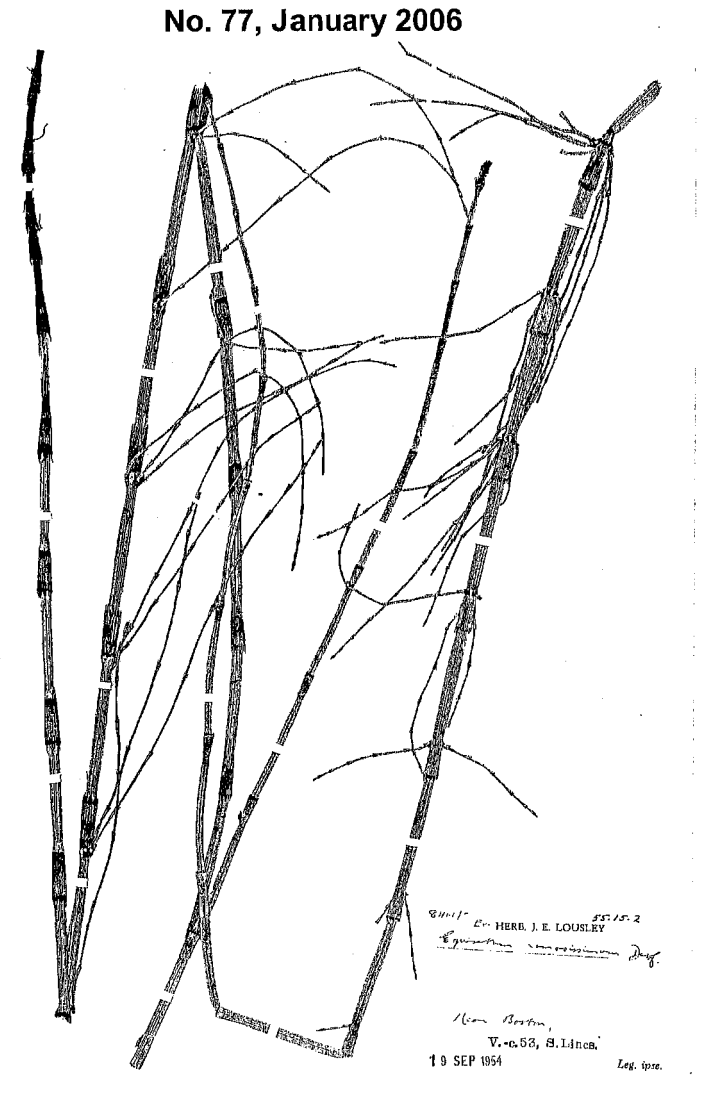
Photocopy of specimen of Equisetum ramosissimum (Branched Horsetail) at NMW (×1/3), a species new to Wales (see pp.10, 24).