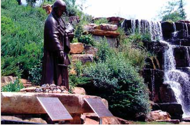
BRANKO MEDINICA '72 INTERNATIONAL SCULPTOR, BIRMINGHAM