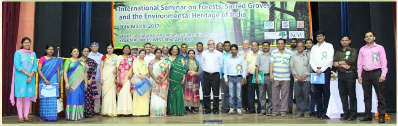
Participants of International Seminar on Forests, Sacred Groves and the Environmental Heritage of India