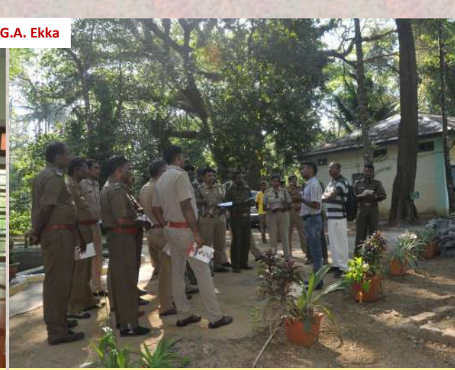
Forest Trainees along with Instructors, Forest Training Institute, Wimberligunj at Garden, ANRC, BSI, Port Blair