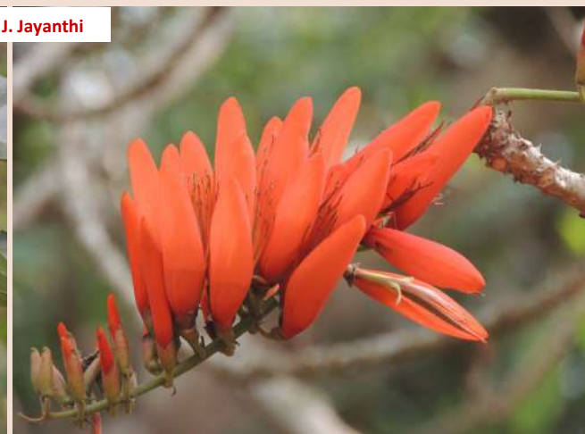
Erythrina suberosa (Fabaceae) in Biligirirangaswamy Temple WLS, Karnataka