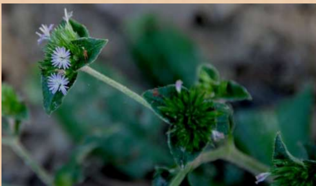
Elephantopus scaber (Asteraceae)