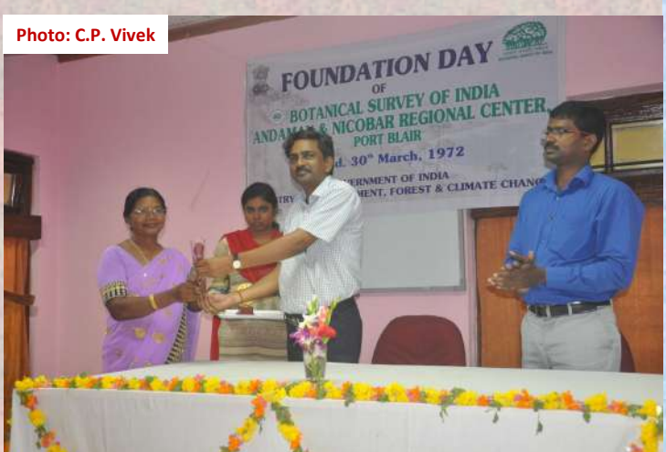
Celebration of 45th Foundation Day of BSI, Andaman and Nicobar Regional Centre, Port Blair

Foundation Day of ANRC was celebrated on 30.03.2017.