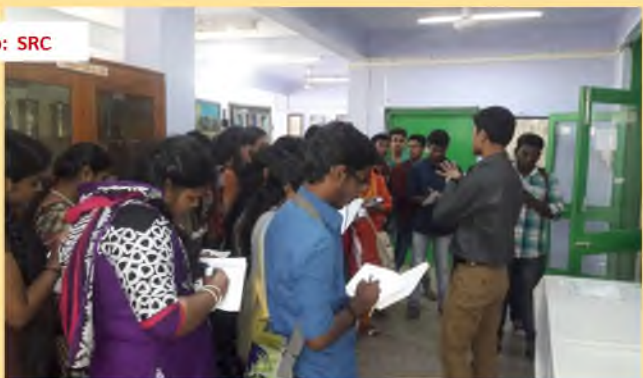
SRC scientific officials explaining to the students about Botanical collections displayed at the museum