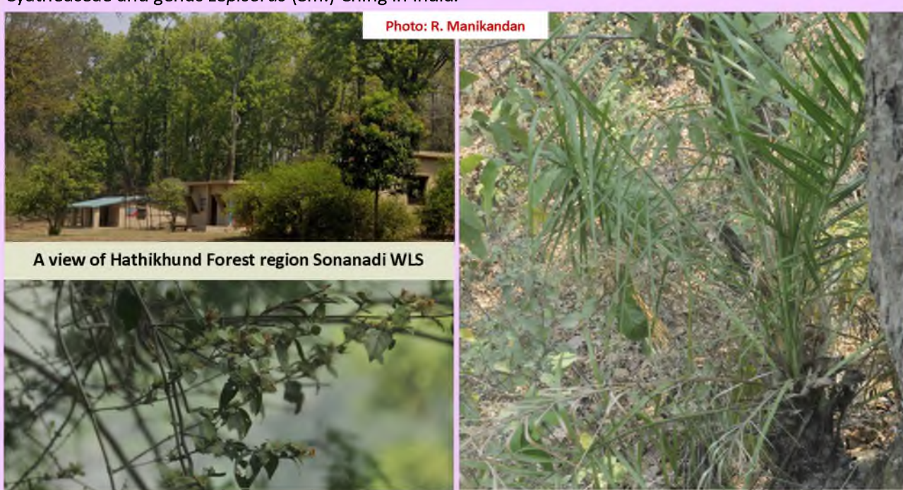
Jasminum arborescens flowering in Sonanadi WLS

Identified total 77 species and made description for 45 species in connection with the projects, Flora of Uttarakhand Vol. V, Floristic Diversity and Phytosociological study of Simbalbara National Park, Flora of Nandhour Wildlife Sanctuary, Flora of Sonanadi Wildlife Sanctuary, Revision of family Bignoniaceae, Cyatheaceae and genus Lepisorus (Sm.) Ching in India.