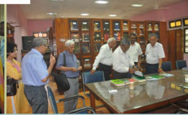
Visit of members of 16th meeting of the Advisory Committee for Ecosystem Research Programme (EcRP), New Delhi to Herbarium (left) and Library (right) of ANRC, Port Blair