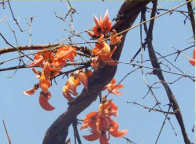
Butea superba (Fabaceae)