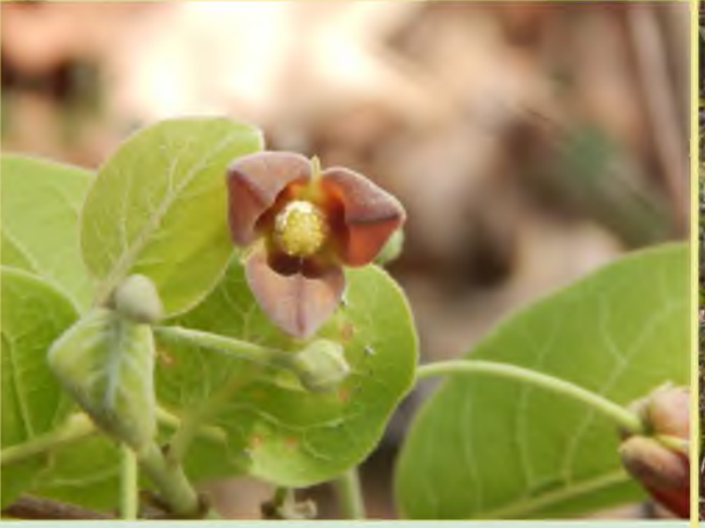
Miliusa tomentosa (Annonaceae)