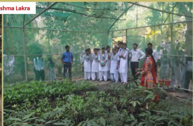
Teaching staff and Teacher trainees, Tagore Govt. College of Education, Port Blair, South Andaman at DEGA, Nayasahar

9 teaching staff and 110 teachers trainees of Tagore Govt. College of Education, Port Blair, South Andaman visited garden on 27.04.2016.