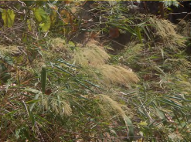
Thysanolaena maxima (Poaceae)